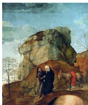
7 Hugo-van-der-Goes / Mary and Joseph on the Way to Bethlehem