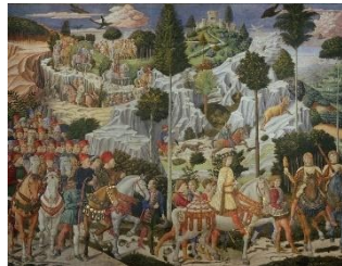
5 Gozzoli / Magi