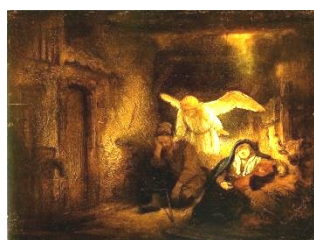
8 Rembrandt/ Dream of Joseph