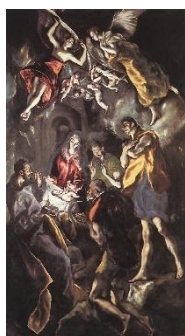
3 El Greco/ Adoration of the Shepherds