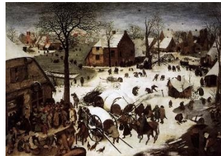
6 Pieter Bruegel the Elder/ Census at Bethlehem