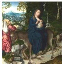
2 Van- der- Weyden/Flight Into Egypt