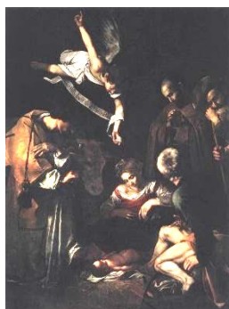
10 Caravaggio / the Nativity