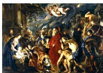
4 Rubens/Adoration of the Magi