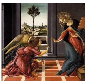
9 Botticelli /the Annunciation