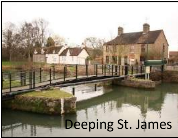
Deeping St. James