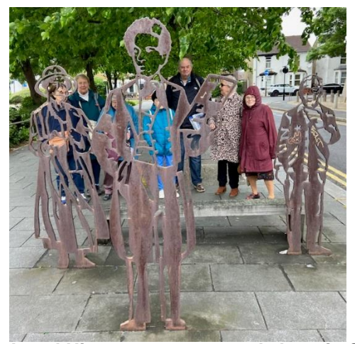
The Local History group out and about in Croydon

Our members come from all parts of Croydon and our activities take place in different venues right across the Borough – we feel we really are representative of our wider community!