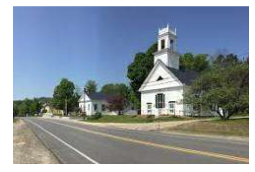
Sullivan County, 801 at the 2020