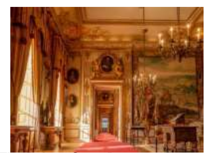
The Palace State Rooms: Enter the Palace and explore the gilded State Rooms with their priceless collections of portraits, tapestries and furniture.

Following the palace's completion, it became the home of the Churchill (later Spencer-Churchill) family for the next 300 years, and various members of the family have wrought changes to the interiors, park and gardens. At the end of the 19th century, the palace was saved from ruin by funds gained from the <u>9th Duke of Marlborough</u>'s marriage to American railroad heiress <u>Consuelo Vanderbilt</u>.