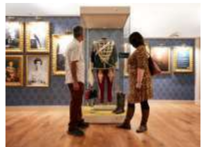
Our new Churchill Exhibition features a mix of historic artefacts and new technology, documenting key aspects of the adventurous life of Sir Winston Churchill