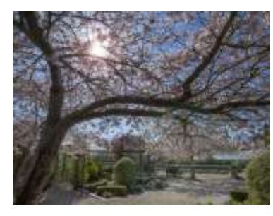
The Walled Garden. Enjoy our adventure playground and explore the gardens for special trails. Find your way out of the Walled Garden to the beautiful Marlborough Maze.