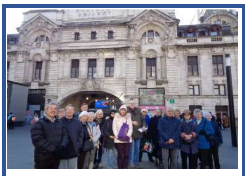
History of London 2 group – see inside for lots of interesting information about their visit to Victoria Station