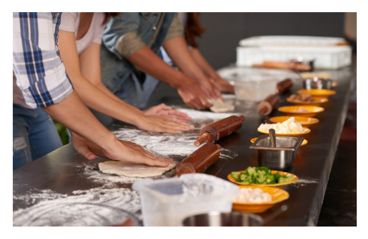
Save 18% on Buyagift eGift cards* with u3a Click and Save

u3a Offers and Services is the section of the newsletter offering discounts to u3a members and friends.