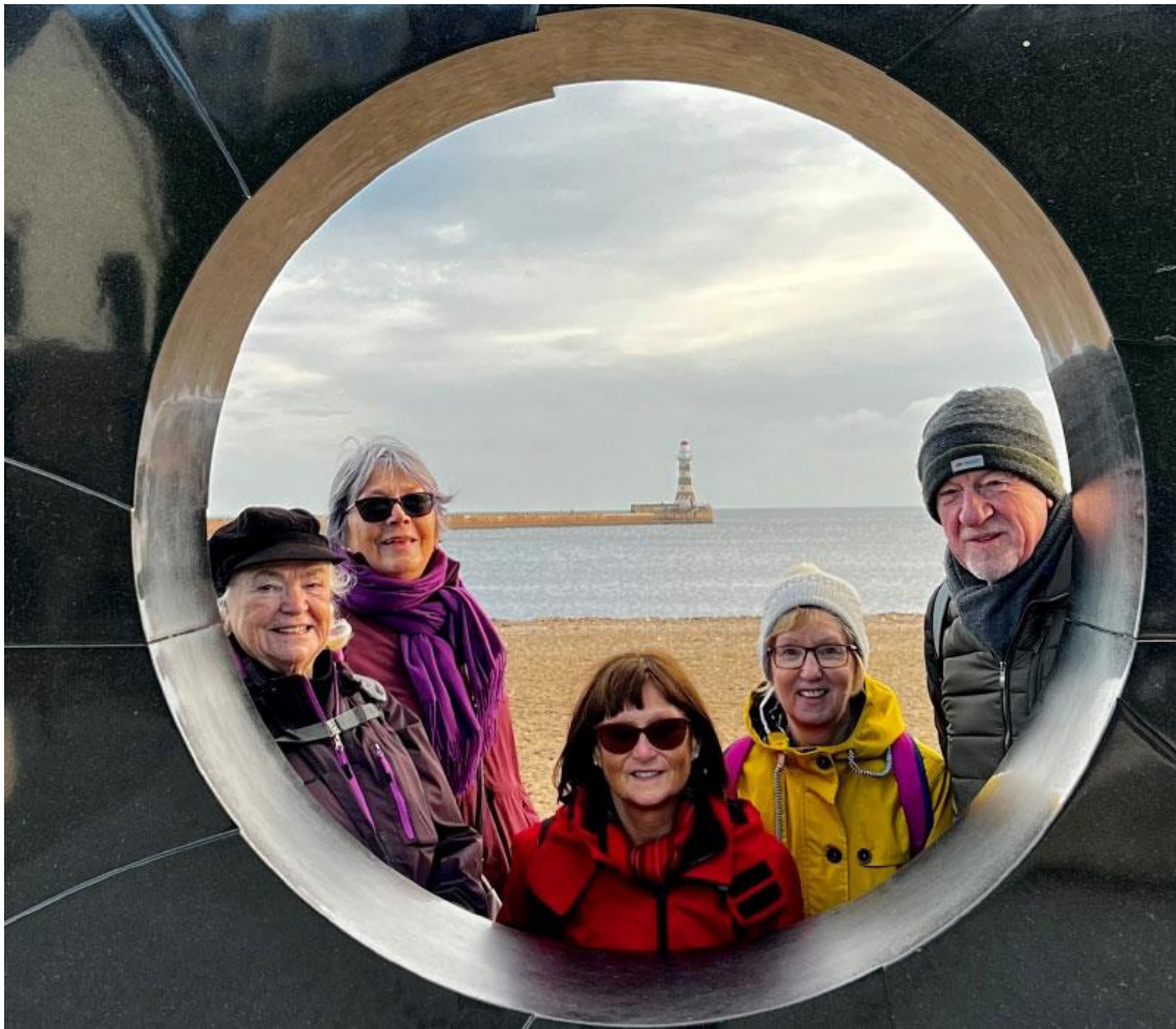
Cestria u3a walkers photographed in Roker in Sunderland

Click here to open the newsletter in your browser.