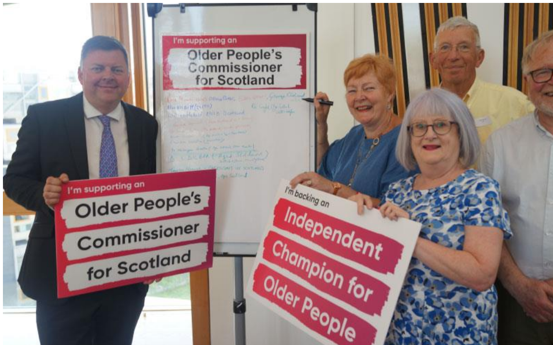
u3a members with Labour MSP Colin Smyth

u3a is developing the movement's voice to make a social impact. Read about ongoing projects on our Impact page .