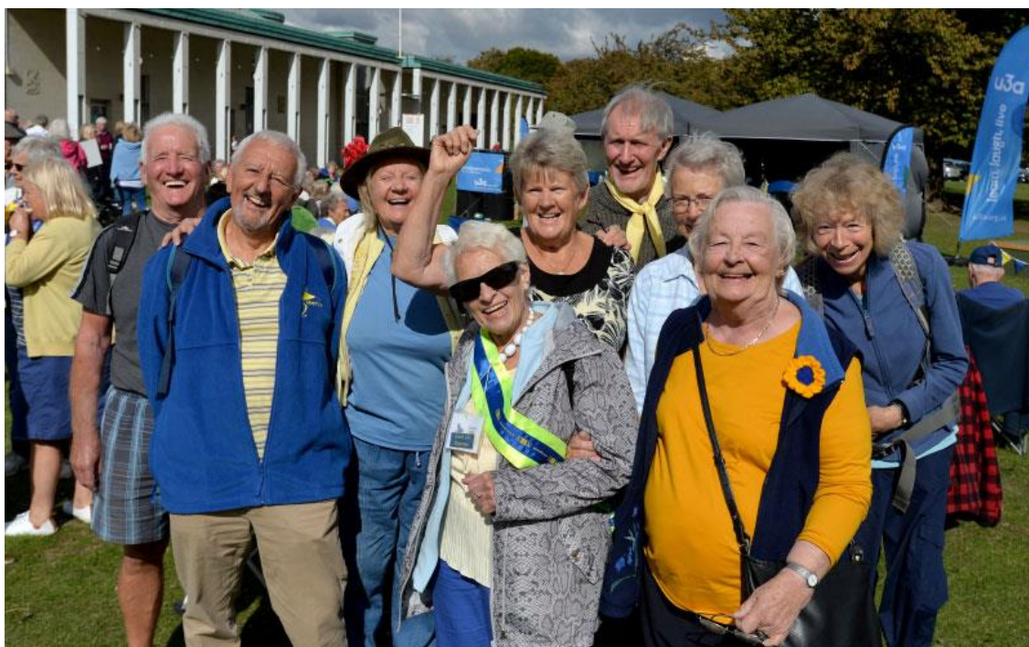
The u3a Nottinghamshire Network celebrating u3a week in 2022