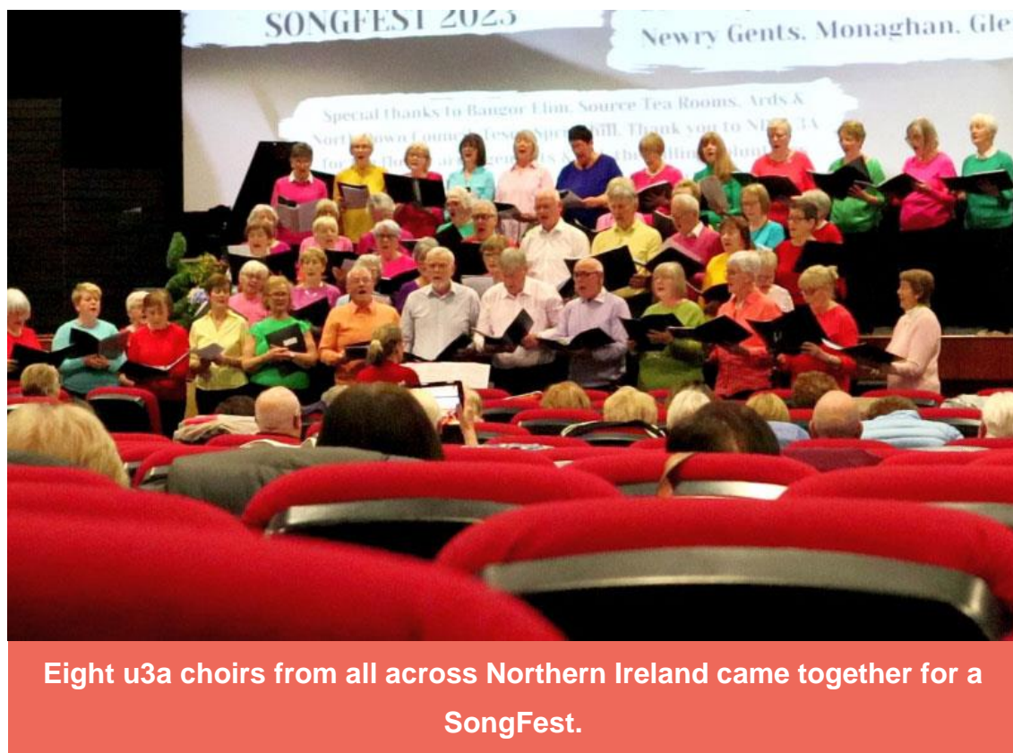
Eight u3a choirs from all across Northern Ireland came together for a SongFest.