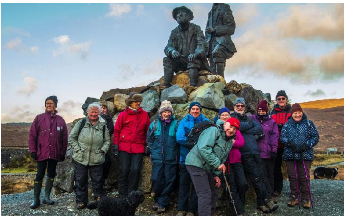
The Isle of Skye u3a Step-it-up walking group at Sligachan, against the backdrop of the Cuillin Mountains.

Click here to open the newsletter in your browser.