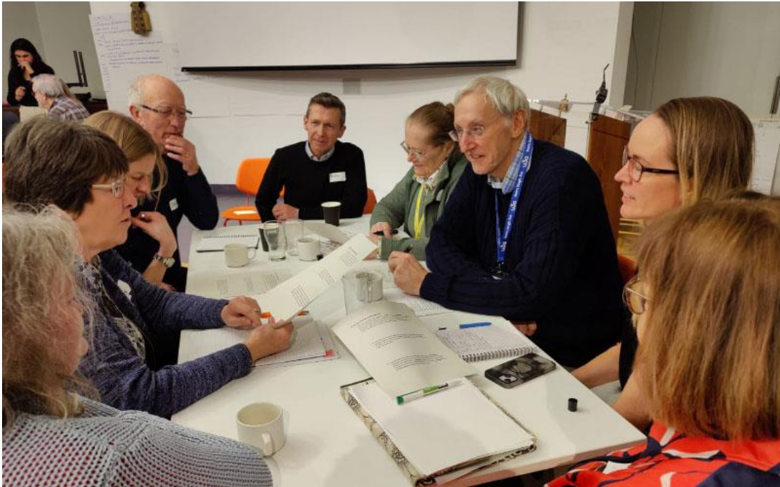
The Board of Trustees and members of u3a office sharing ideas with each other at a strategy day.