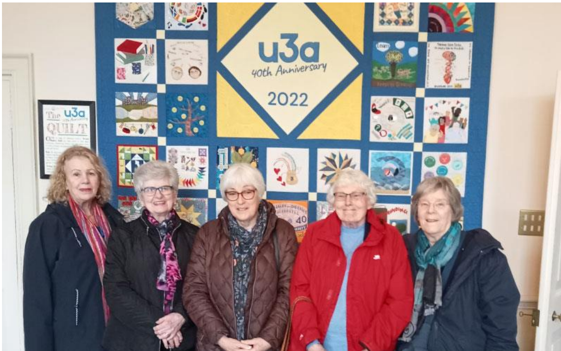
A group of u3a members including Trust volunteers and previous u3a Trustees visited the u3a 40th Anniversary Quilt at Witney Blanket Hall.