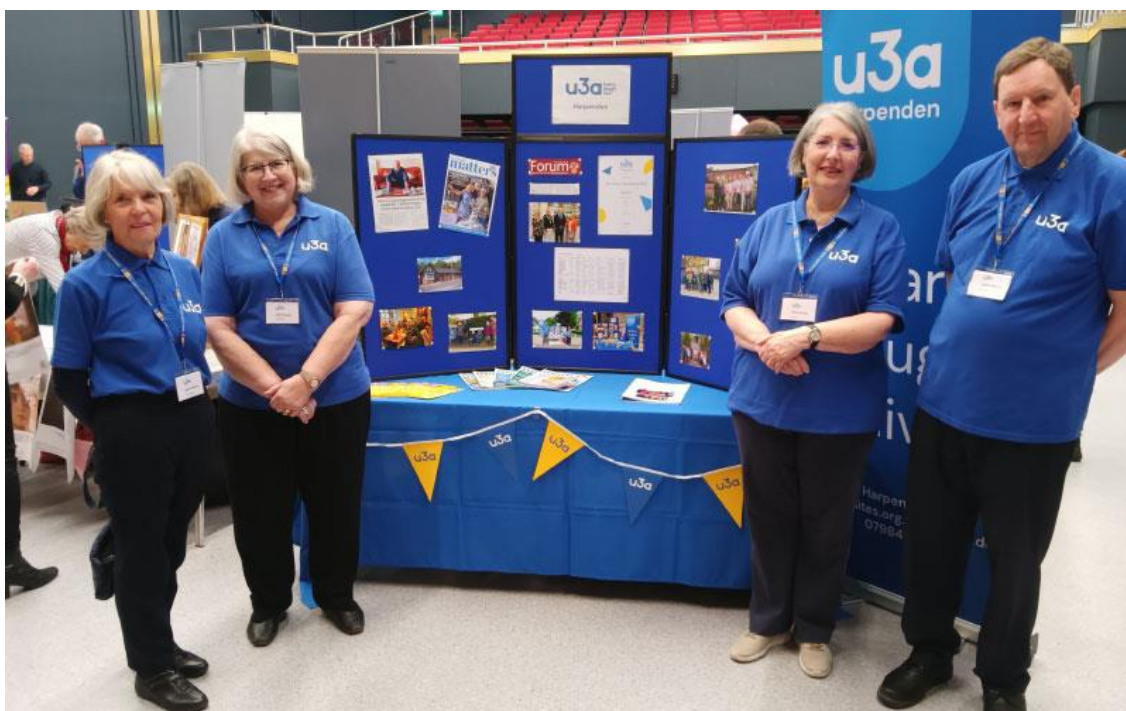
Harpenden u3a showcasing the benefits of the u3a movement at Harpenden Seniors' Fair.

Click here to open the newsletter in your browser.