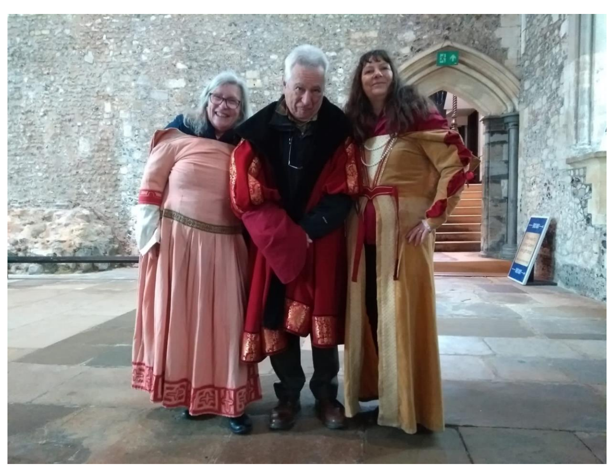
The Merry Wives of Winchester!