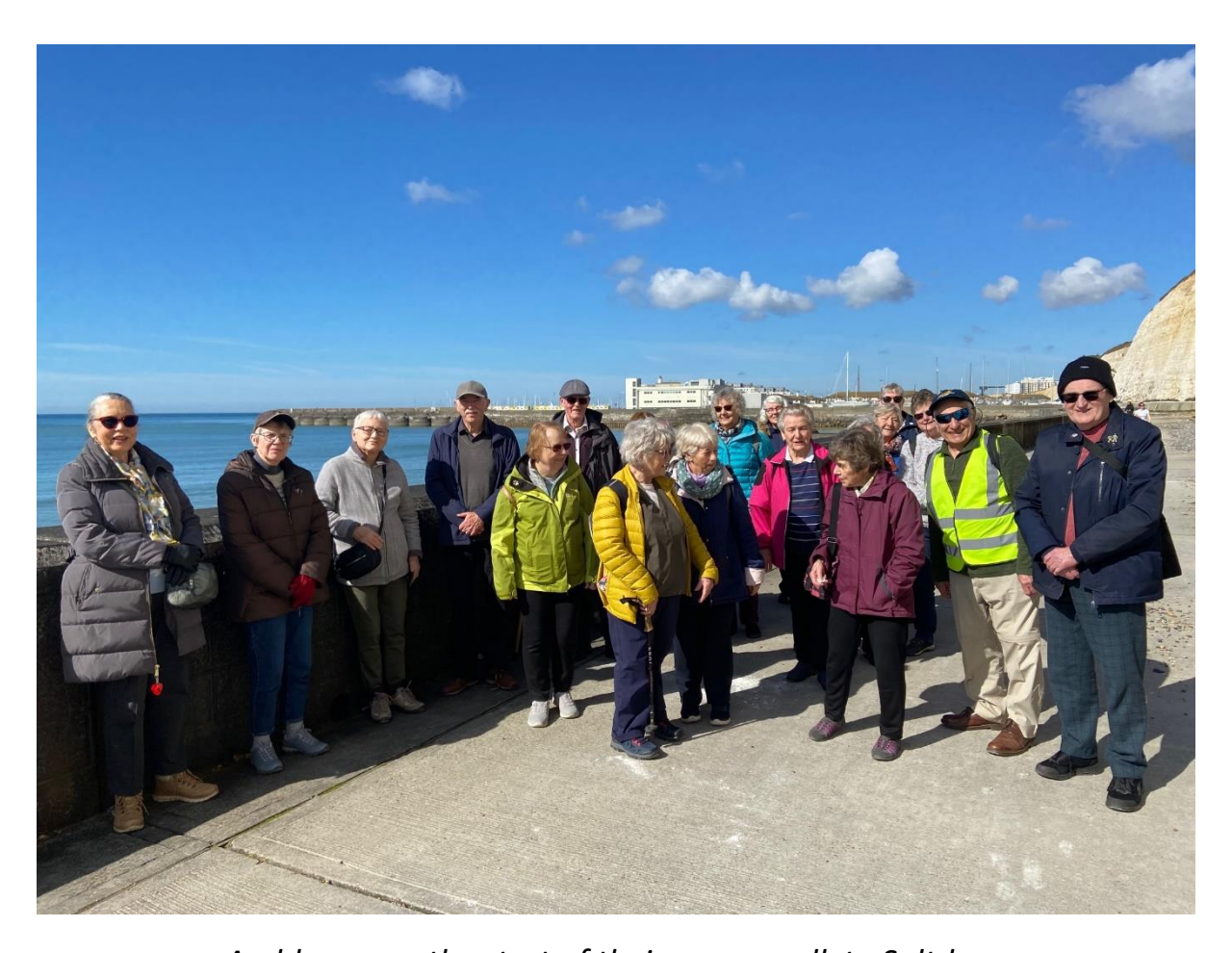
Amblers near the start of their sunny walk to Saltdean

On Good Friday Amblers took the train to Brighton then a bus to Roedean from where we walked nearly 3 miles to Saltdean, enjoying a carvery lunch at the Saltdean Tavern before catching the bus back to Brighton. As the photo shows, the weather could not have been better!