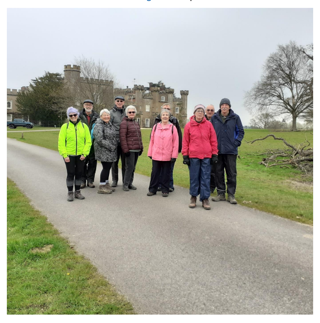
Walkers 1 in front of Knepp Castle

Walkers 1 enjoyed a walk around the Knepp Estate, which is a 3,500 acre estate south of Horsham. On their way round the estate, they passed a large number of deer as well as spotting a heron and a stork, before an excellent lunch at The Crown at Dial Post.