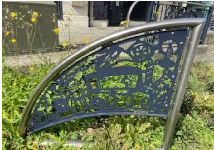
Where was I?