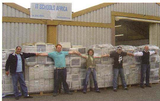
ITSA warehouse Cheltenham

Individuals, companies and schools donate computers to the programme, mostly bringing the computers to the ITSA warehouse in Cheltenham which acts as a hub for all operations. The computers are then refurbished, a process which involves checking them, carrying out repairs, wiping the hard drives with professional software and entering the computer specifications into a database. The computers are then packed, ready for shipping.