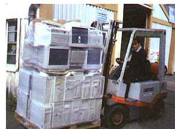
Computers ready for shipment