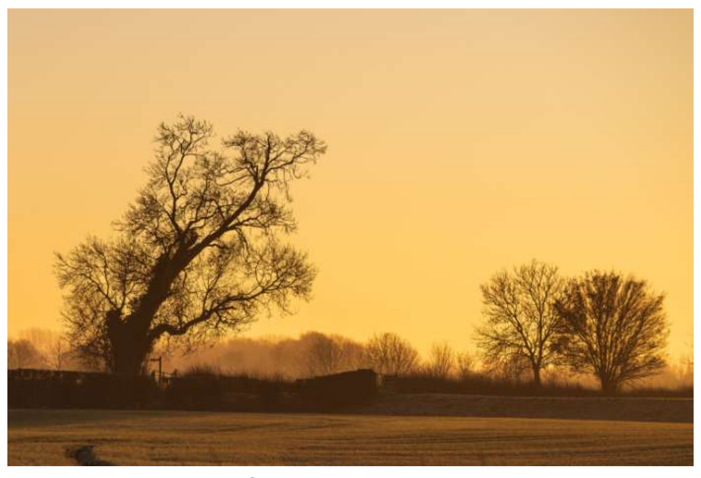
Golden Light by Paul Bass