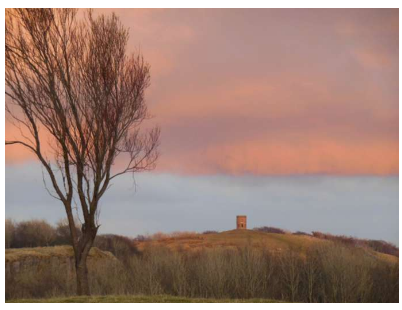
Folly near Buxton