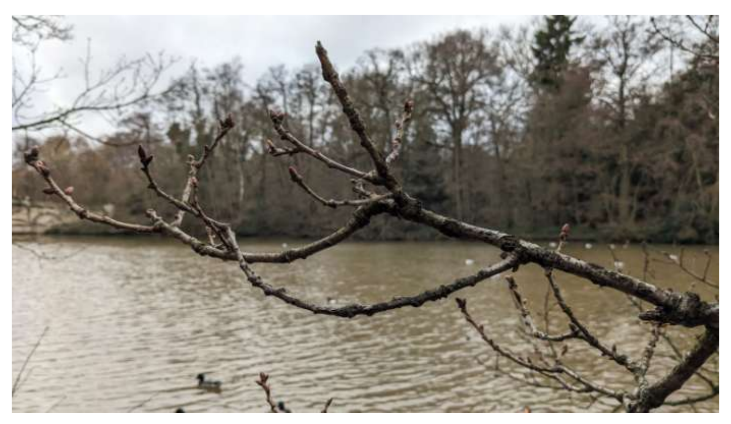
Getting ready for Spring