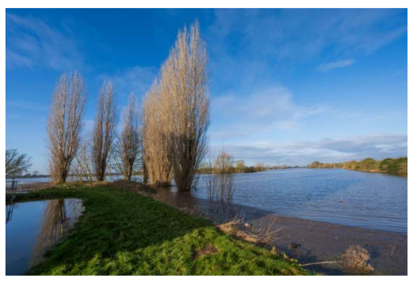
Poplar versus the Flood by Paul Bass