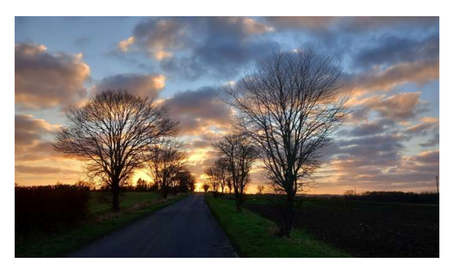
Scarle Road Sunset by Gill Bass