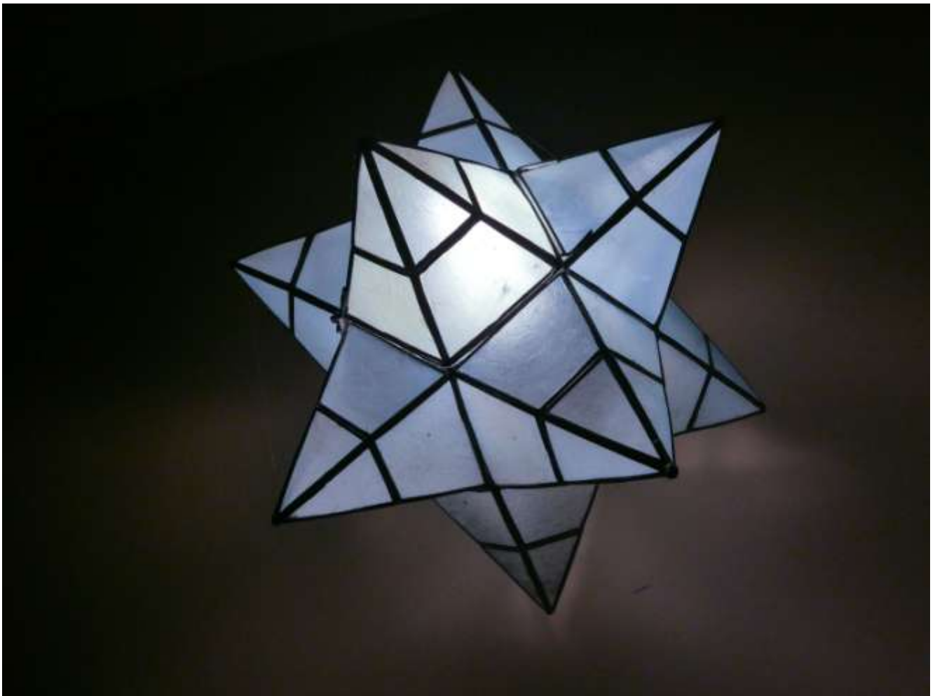
The Blue Light by Jenny Macpherson