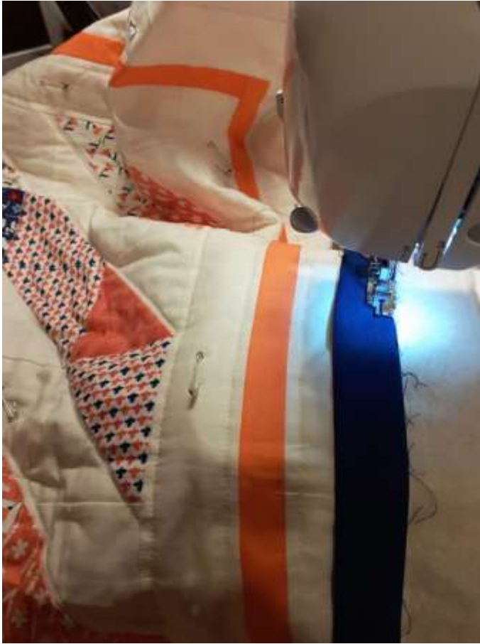
Nearly Finished by Gill Bass