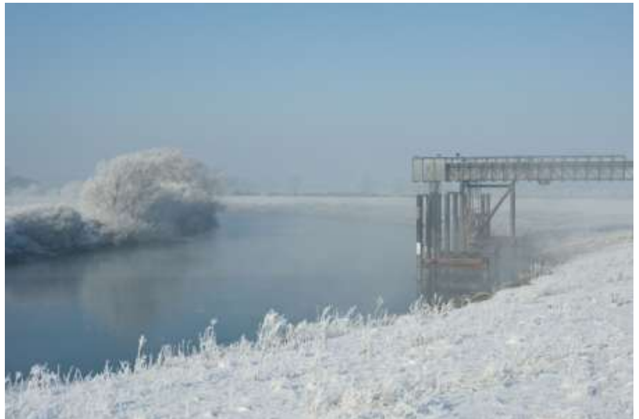
Trent Gantry February 2012