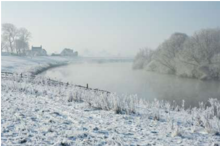
Trent Wharf Cottages February 2012