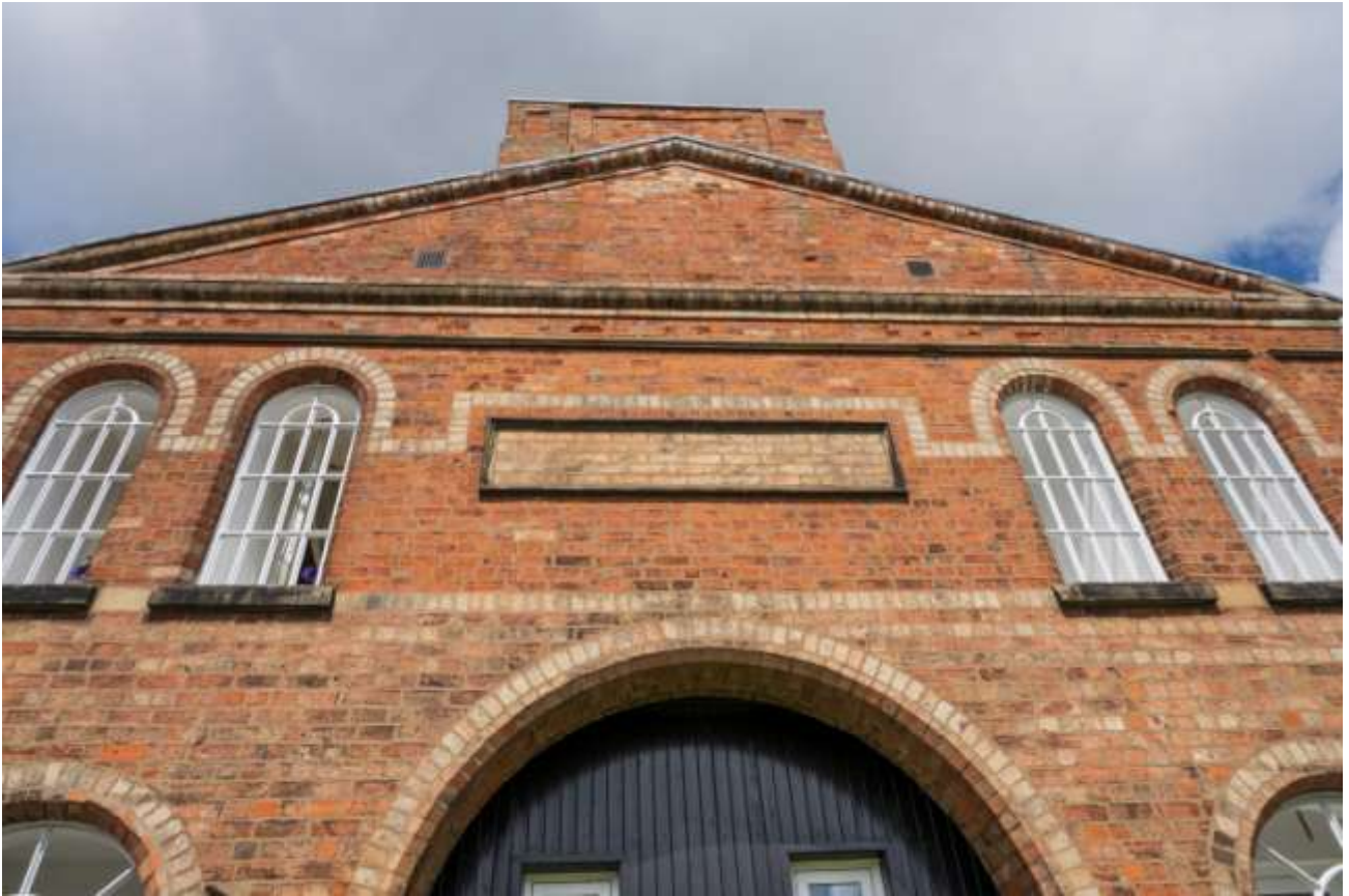
Looking Up by Paul Bass