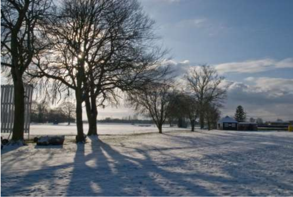
The Cricket Field January 2010