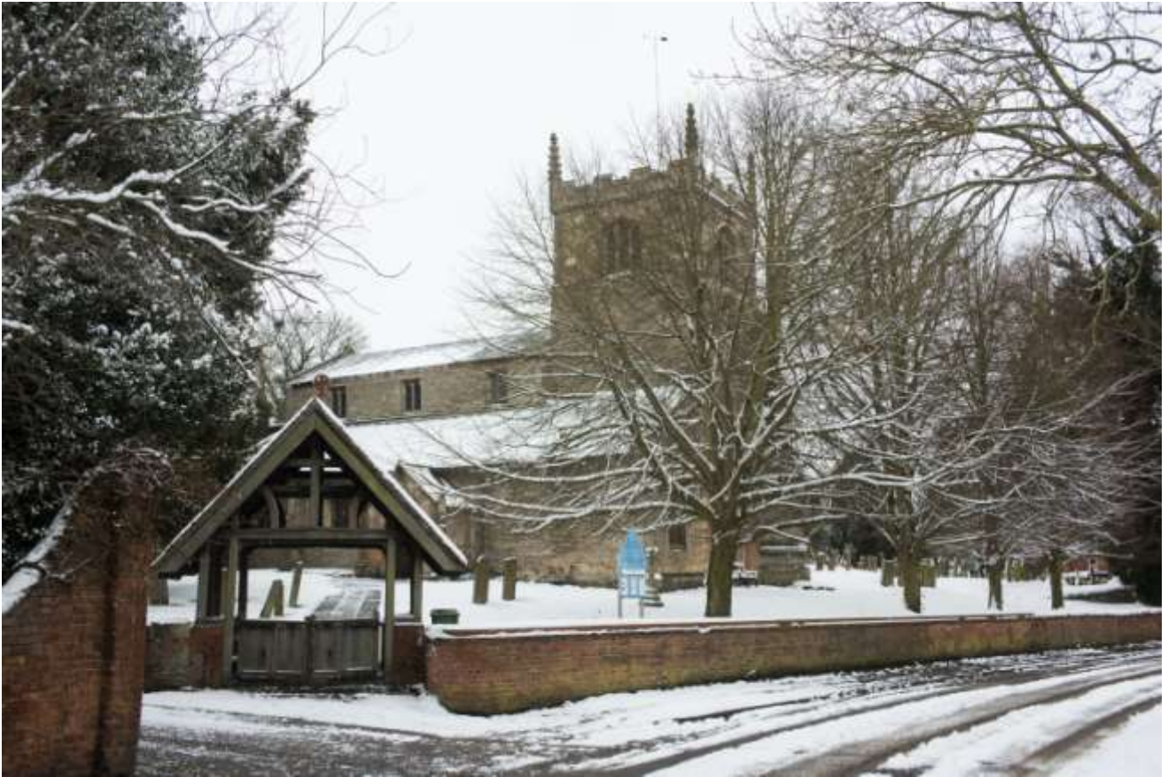
North Collingham Church March 2018