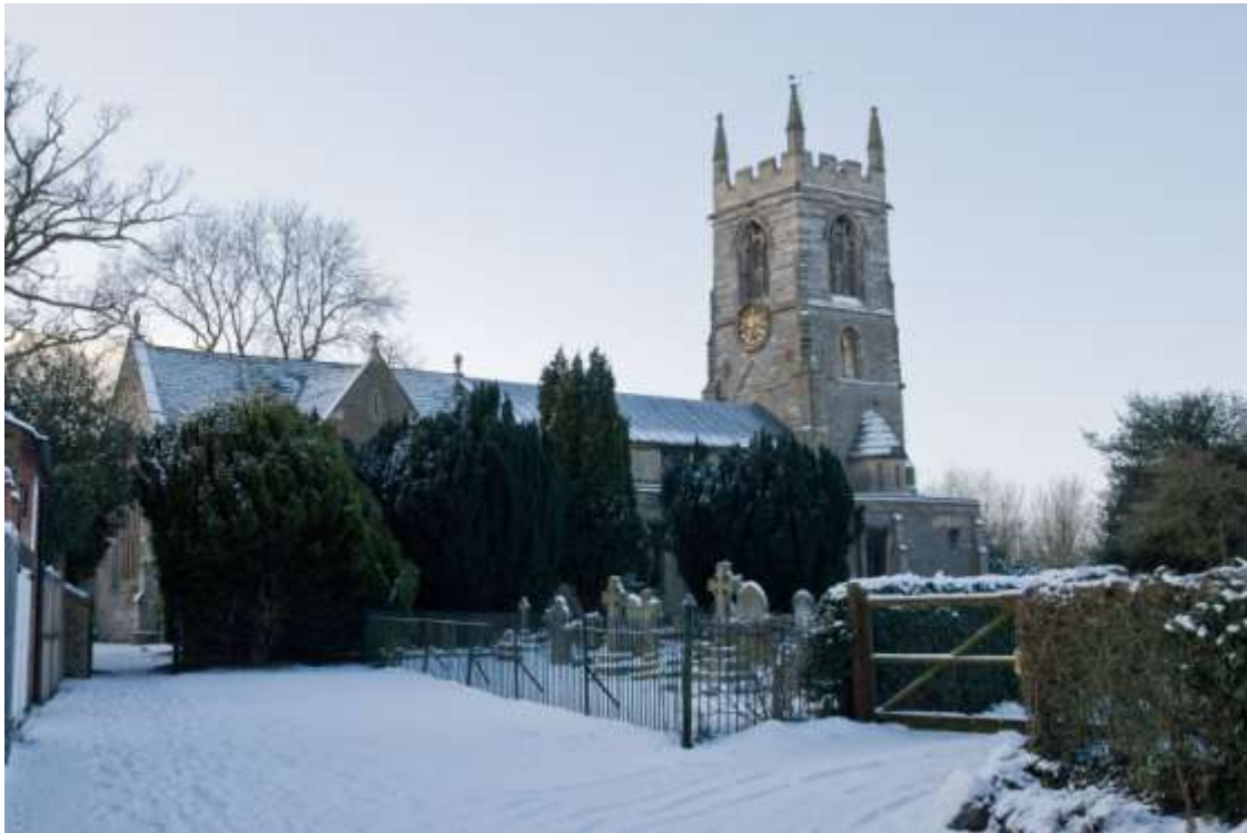
South Collingham Church January 2010