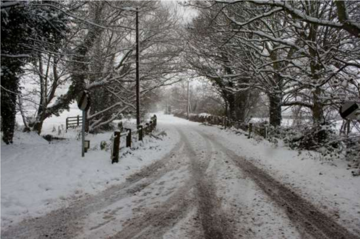
Carlton Ferry Lane December 2010