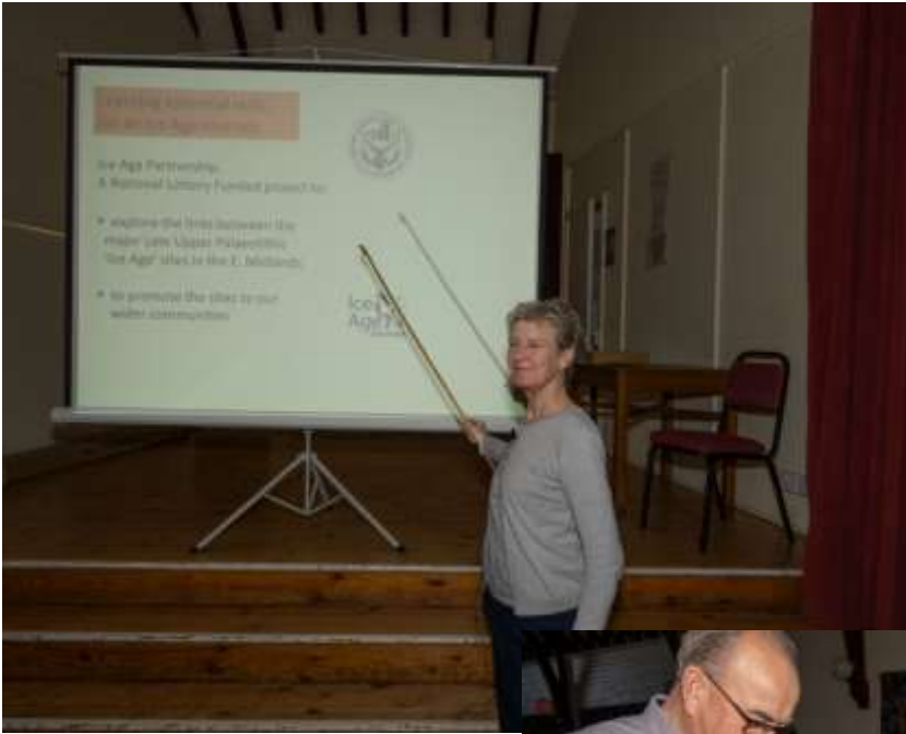
Images from the November meeting, the topic was Ice Age Journeys