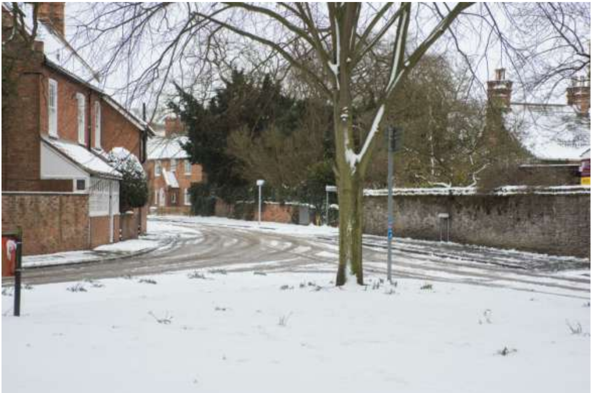
Stocks Hill March 2018