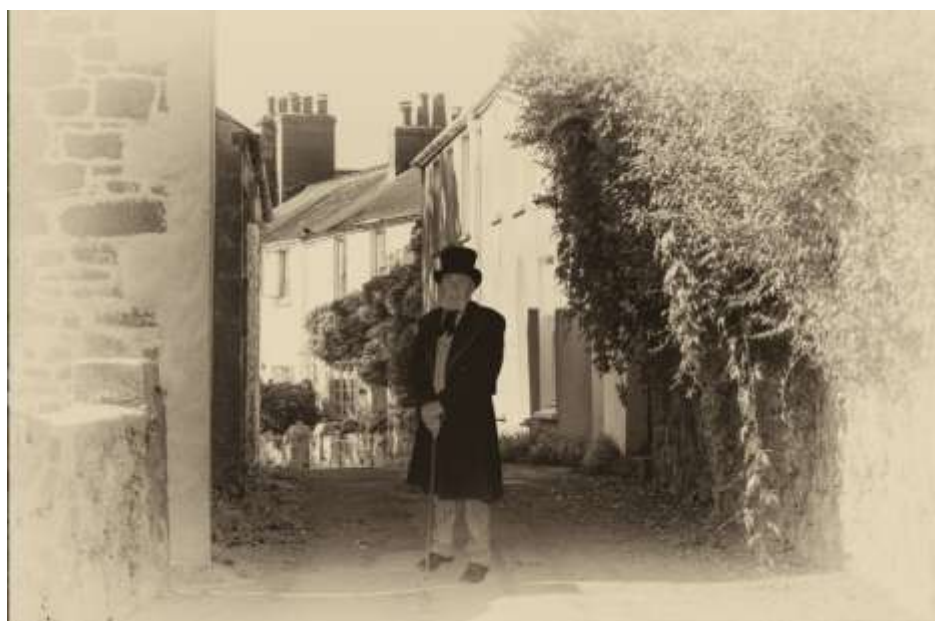
The Old Man