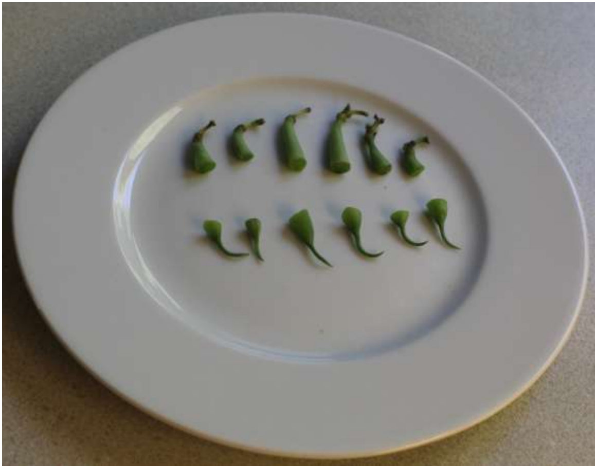
Bean parts by Jannet Wright