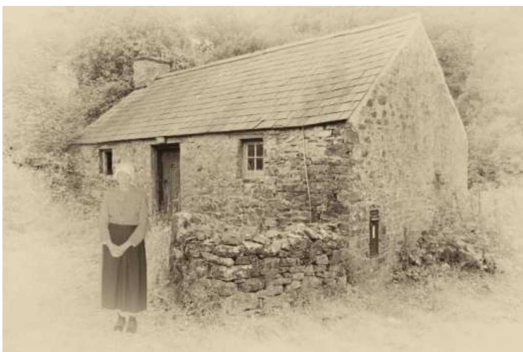
The Old Lady