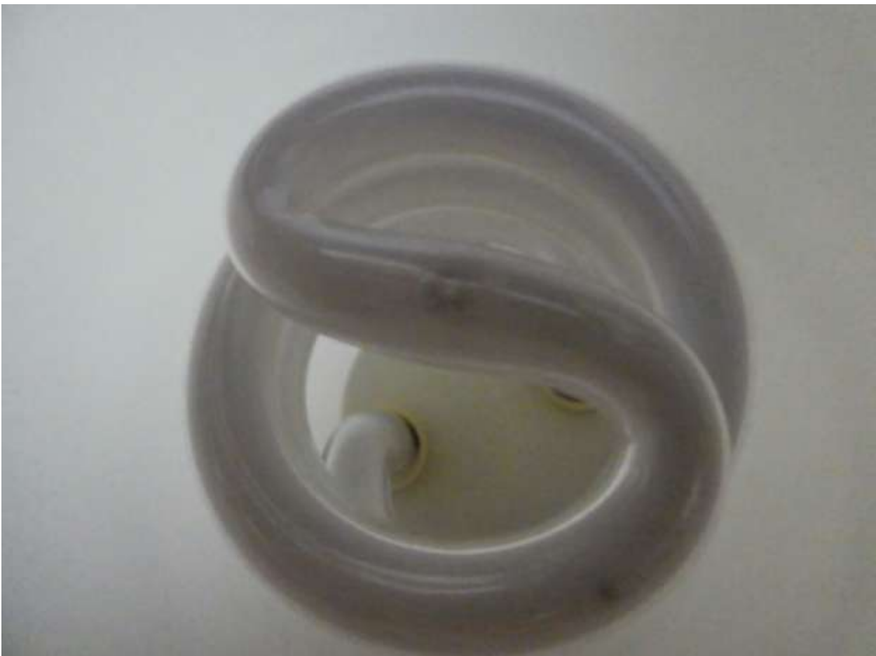
Fluorescent bulb tube by Jenny Macpherson