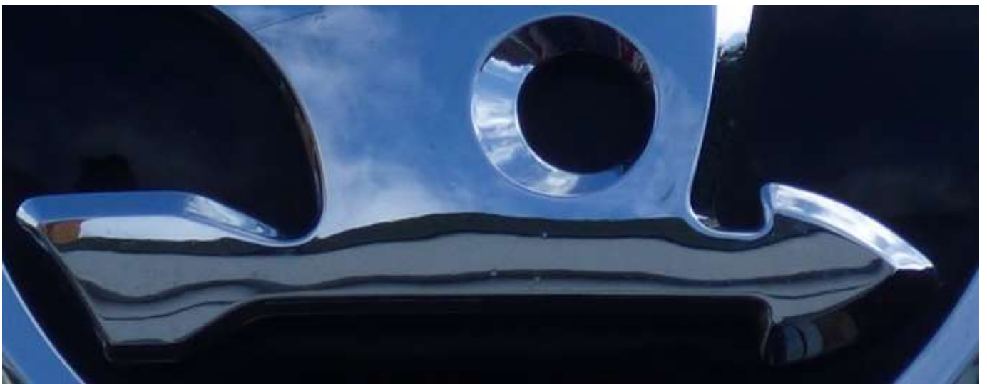
Skoda Badge