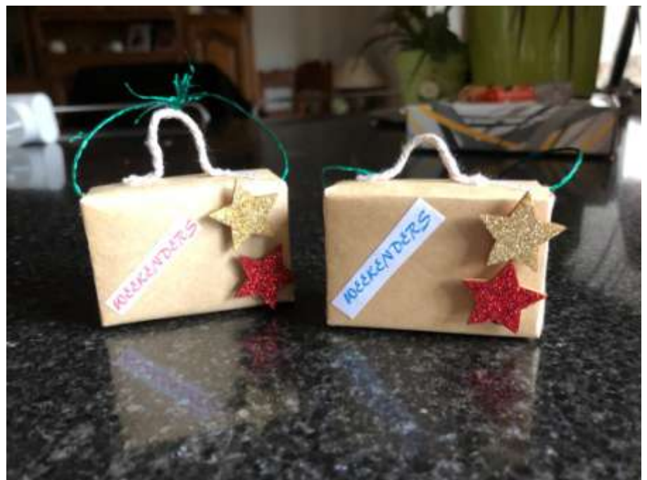
Our Ornaments for the tree in the Methodist church