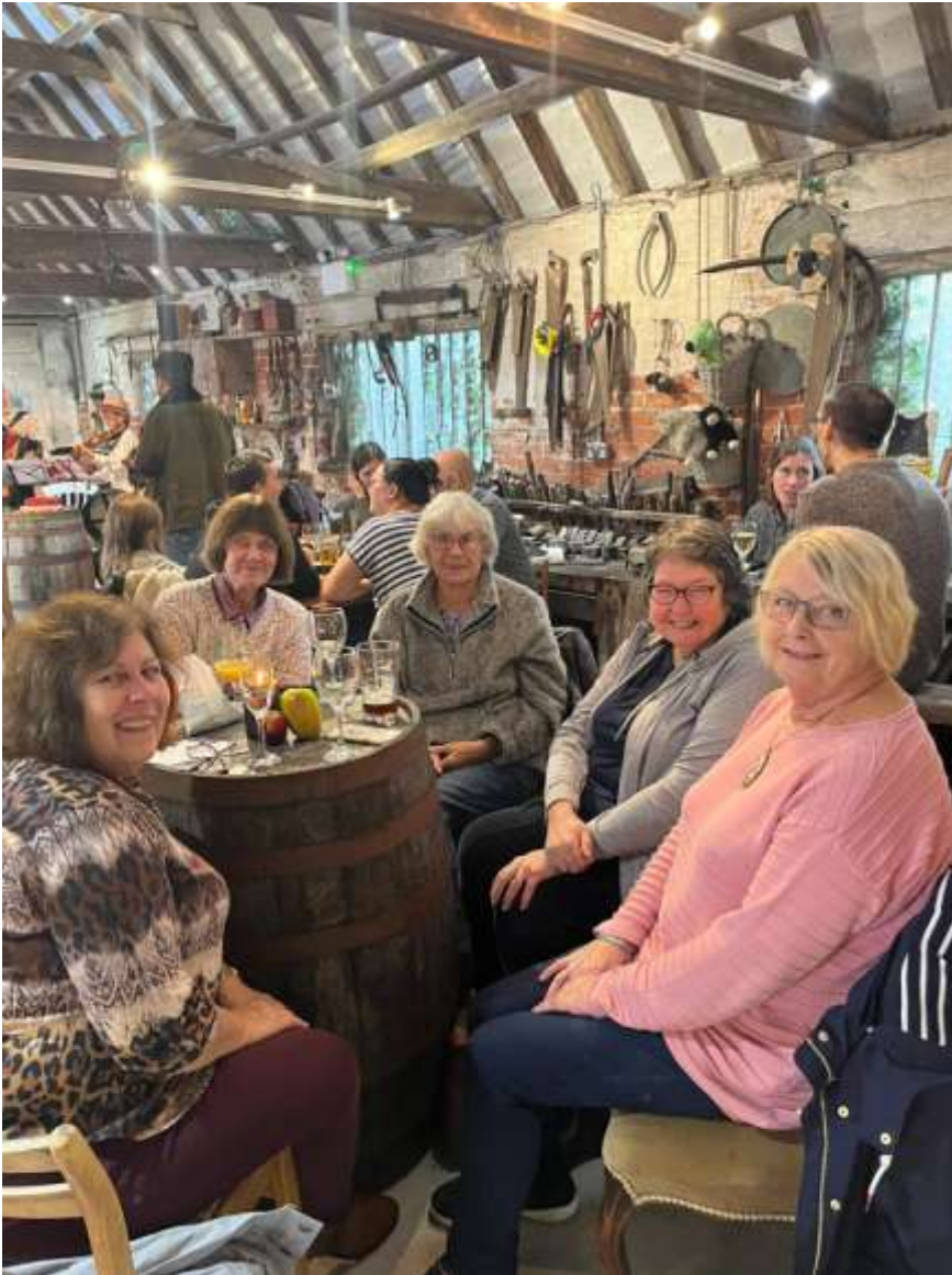
At the Cat Asylum