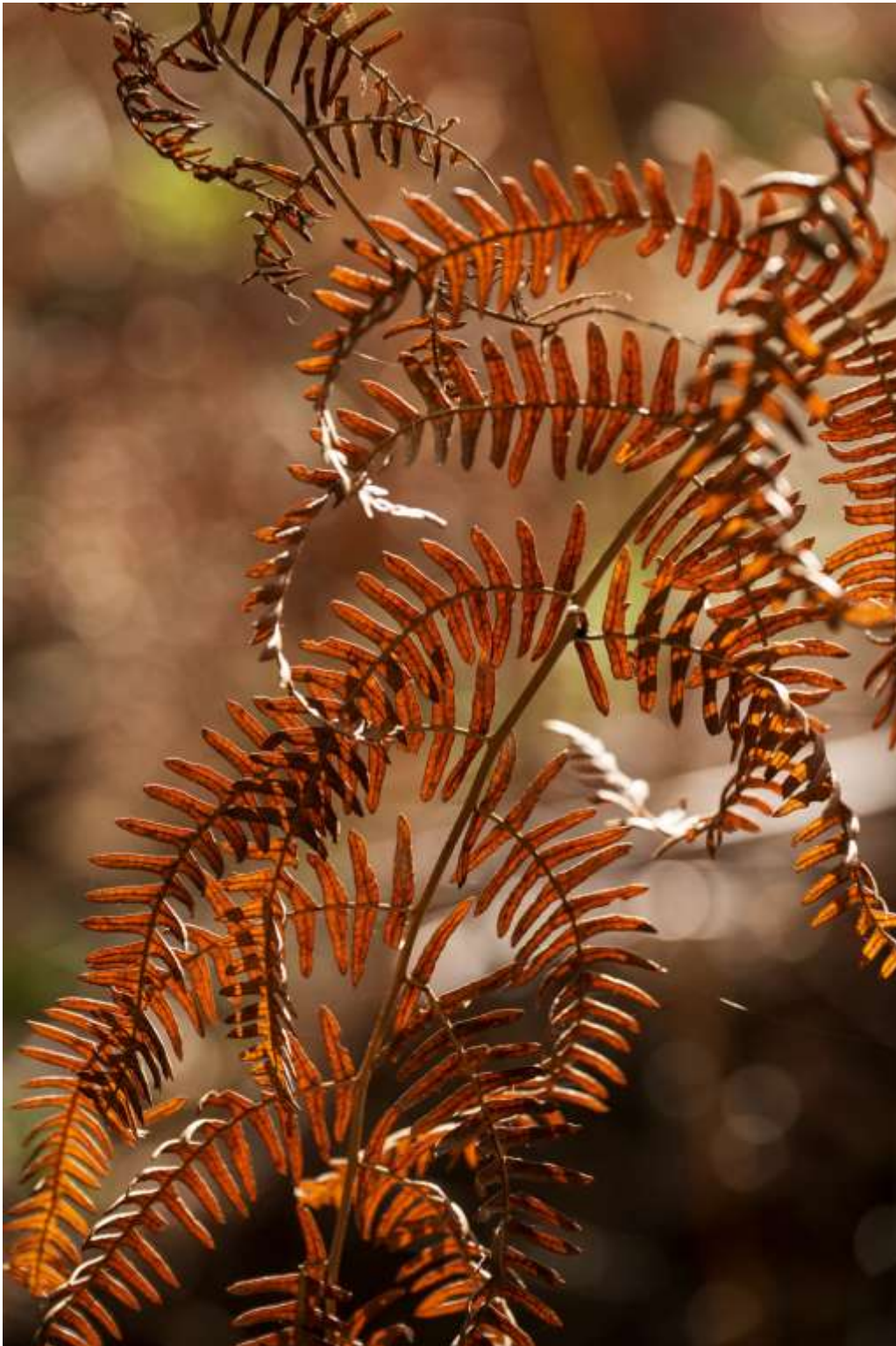
Bracken Detail by Paul Bass