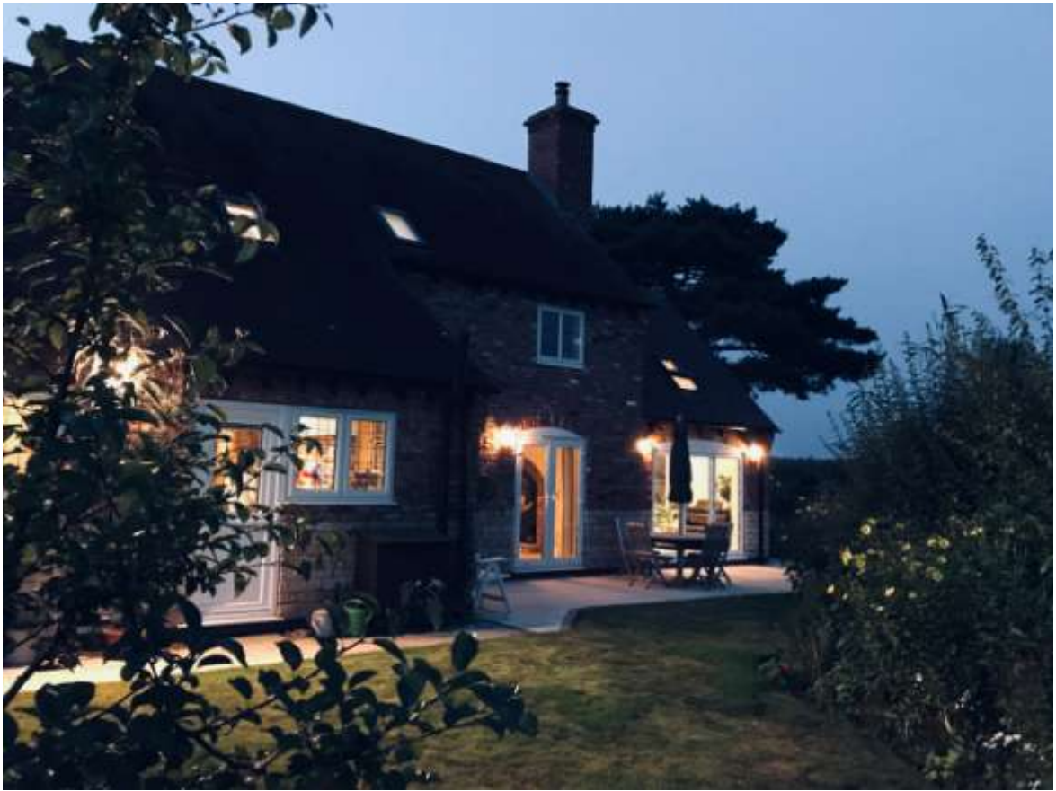
Day to Night by Phil Leckenby