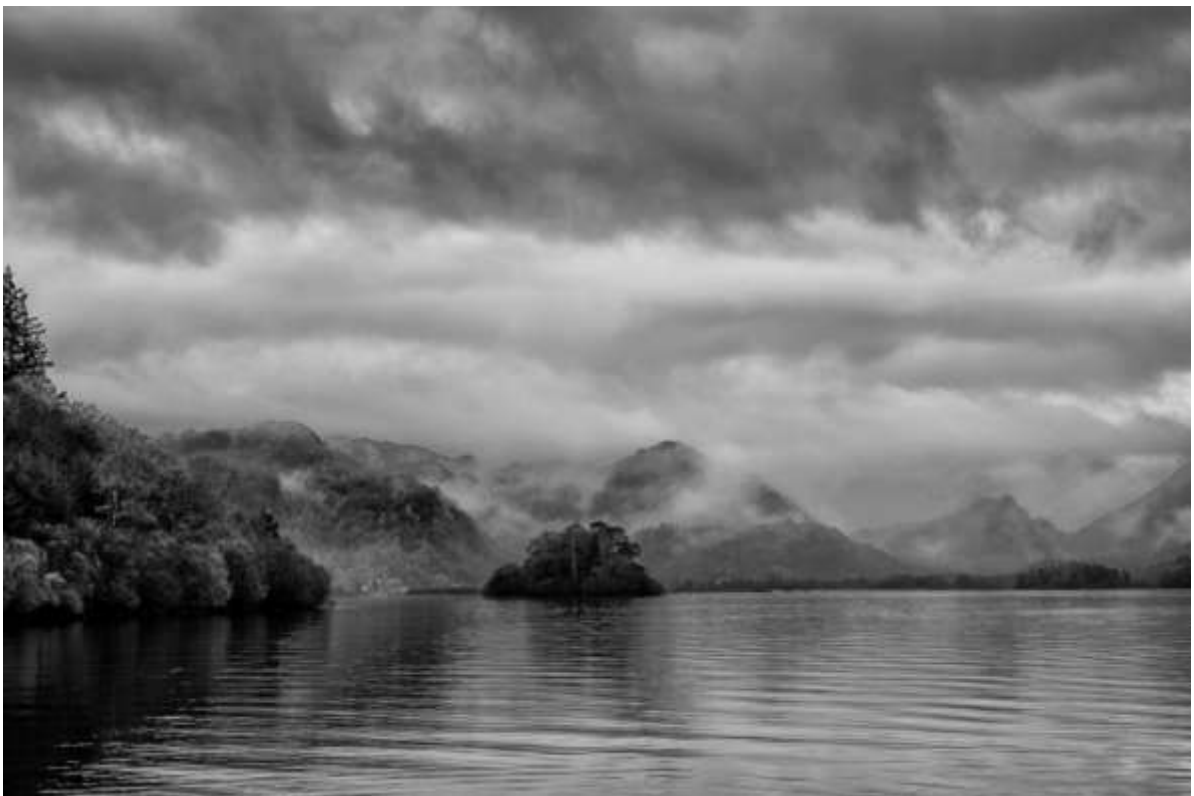
Derwent Water by Paul Bass