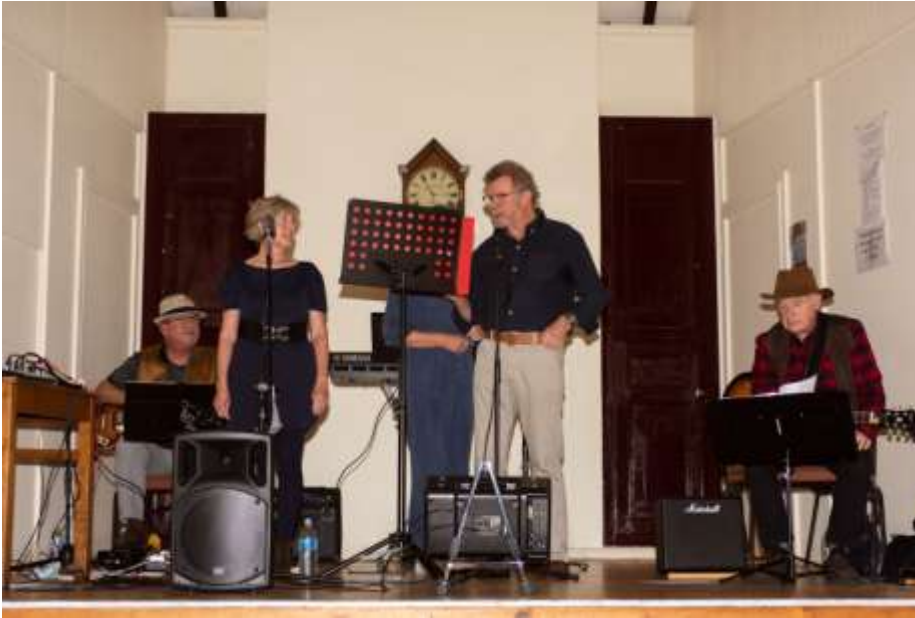
Music Makers at the AGM