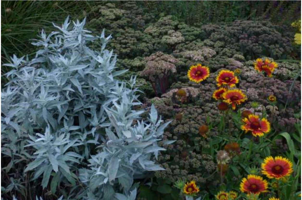
Garden Textures by Colin Smith