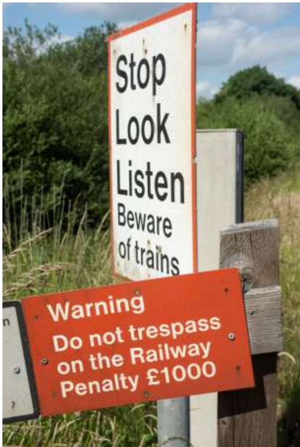
By Order by Paul Bass