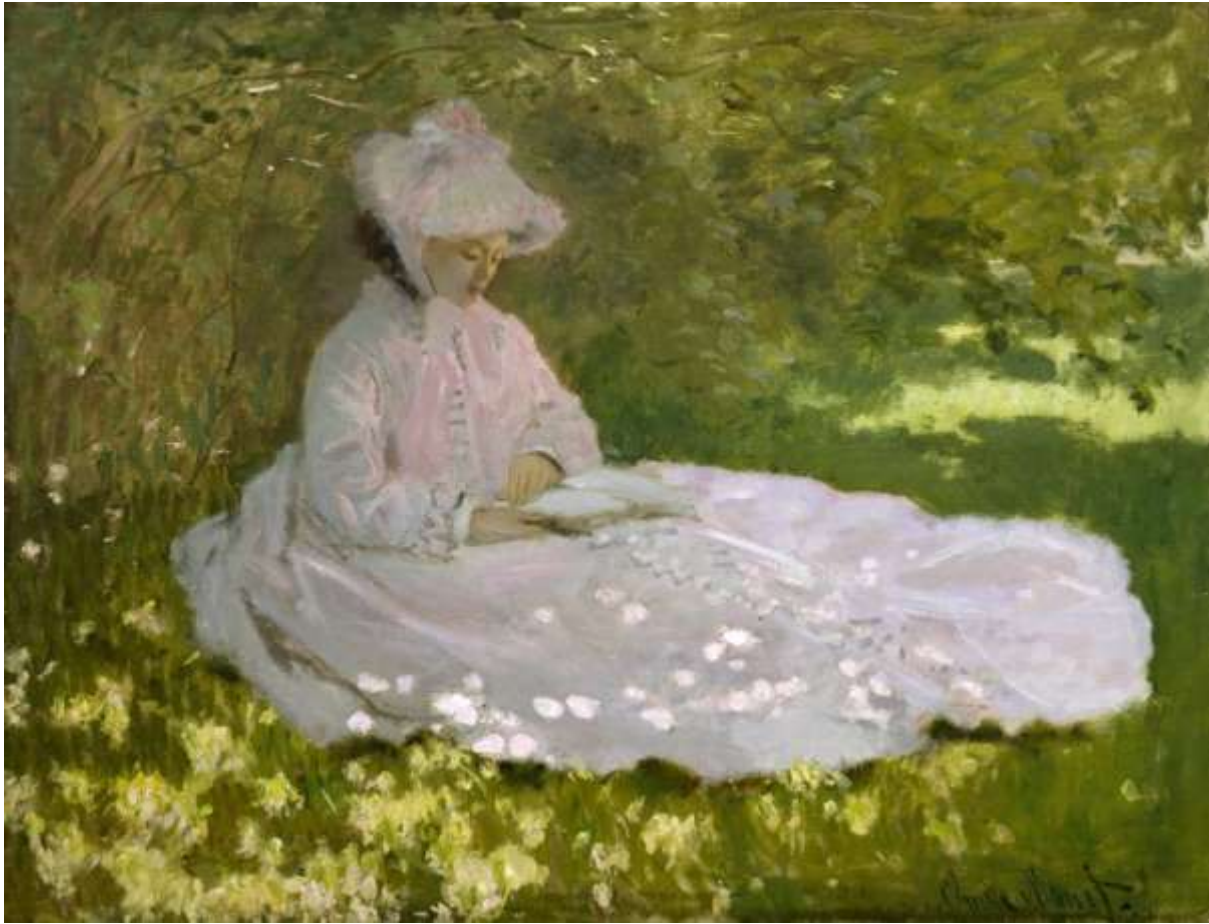
Springtime by Claude Monet