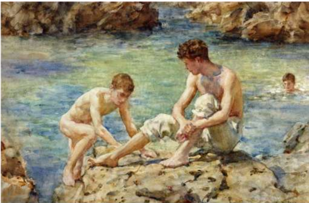
The bathing party by Henry Scott Tuke.