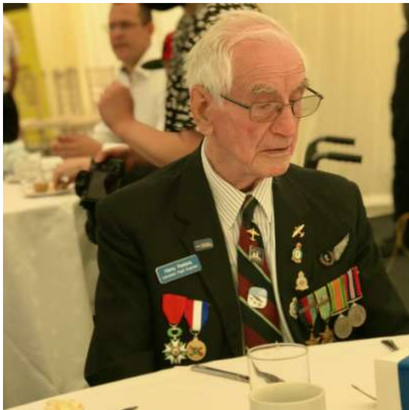
Bomber Command Veteran