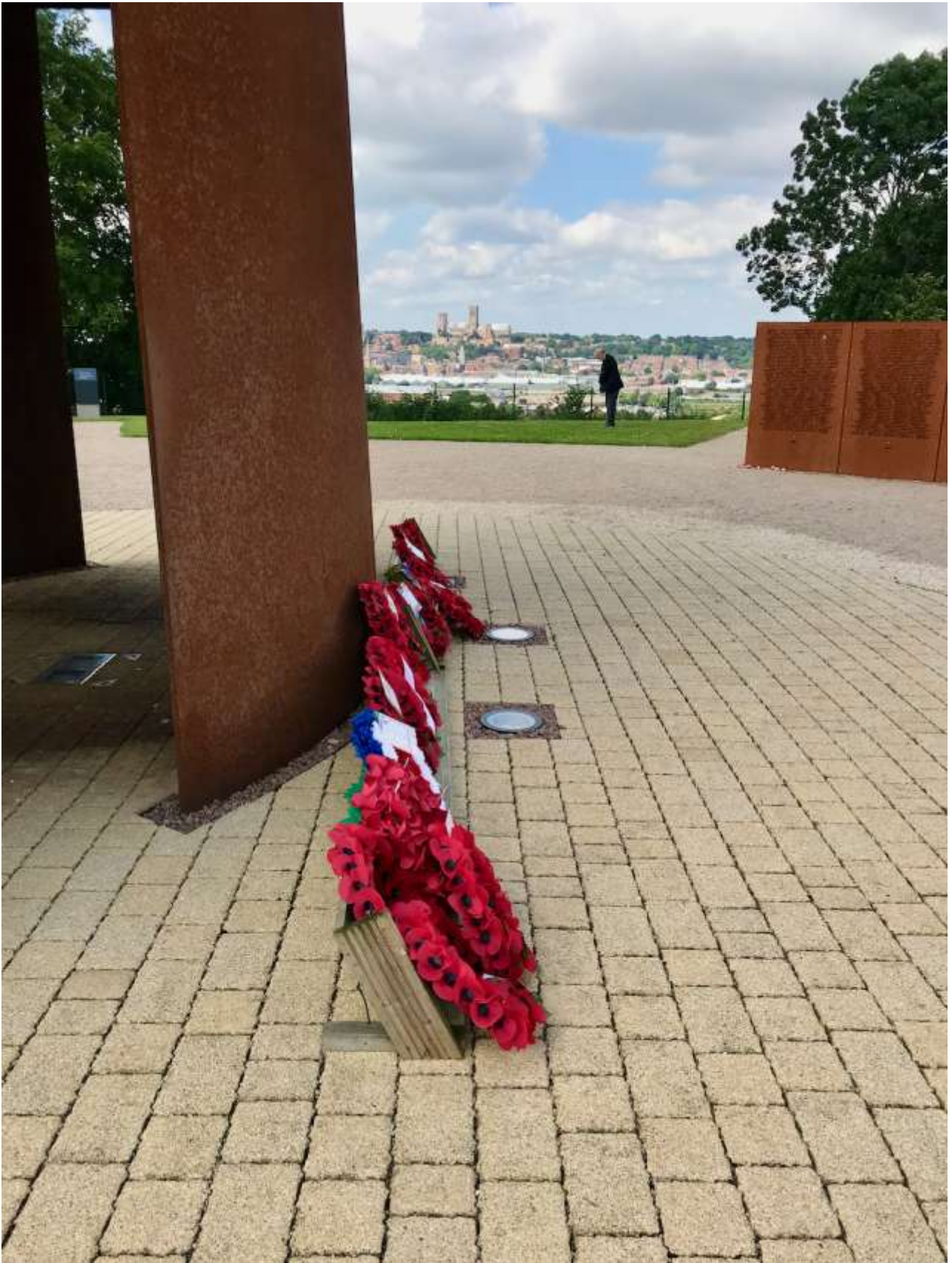
Not Forgotten by Phil Leckenby