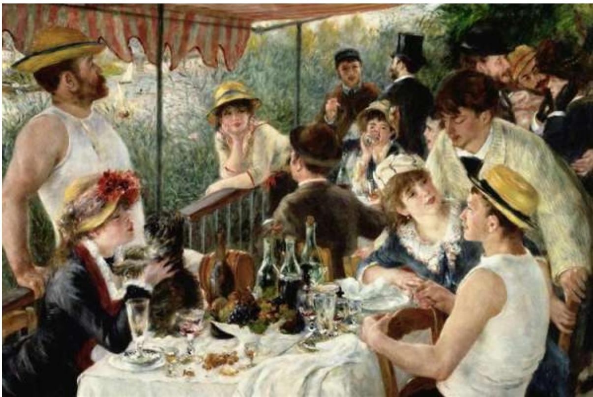
Luncheon of the boating party by Pierre-Auguste Renoir.