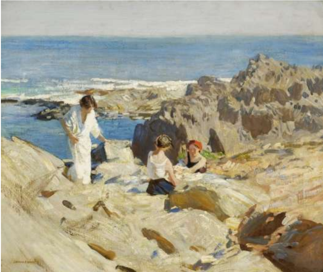
The bathing pool by Laura Knight

The other two summer pictures look more like how we might behave, even more appealing with the hot spell in July.