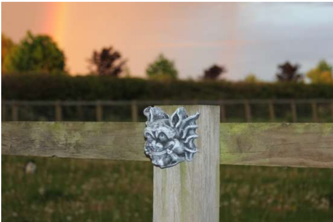
Gargoyle