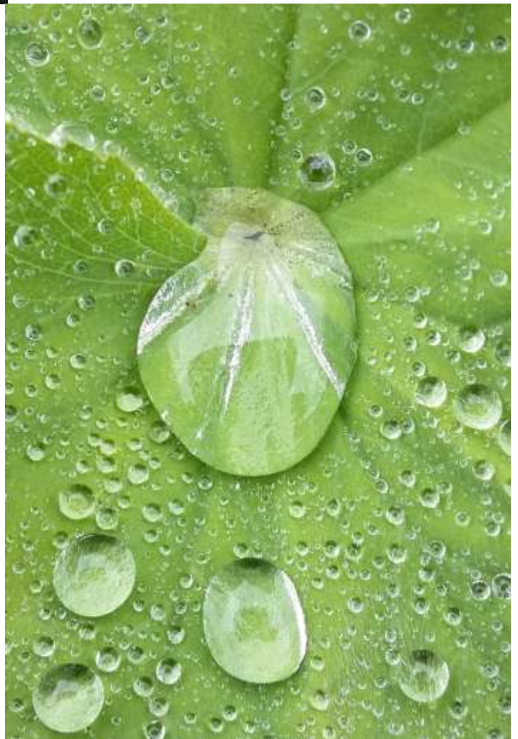
Water Droplets