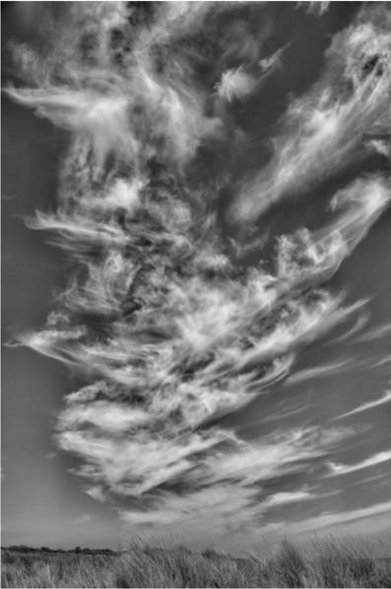
Cirrus Clouds by Paul Bass