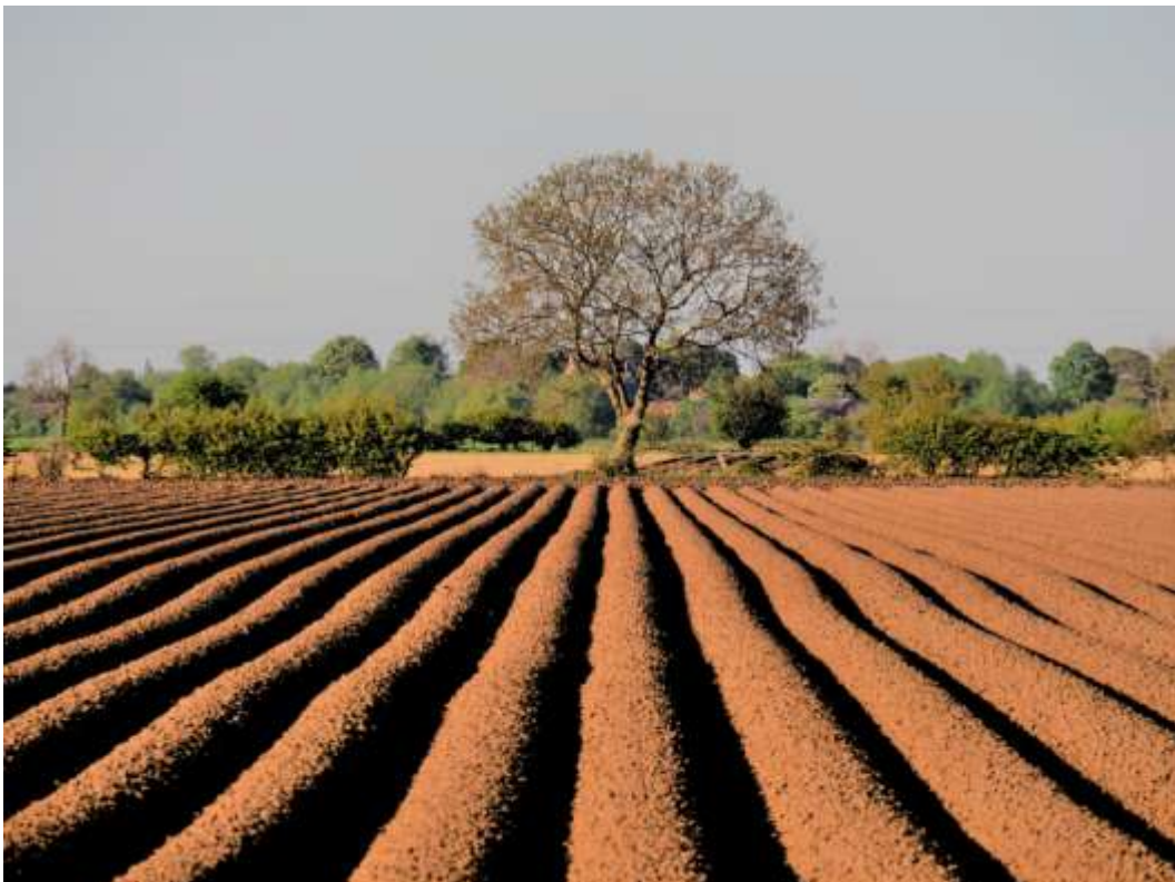
Furrowed Field by Les Murray