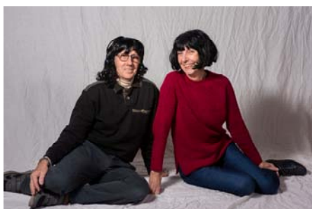
Sonny and Cher