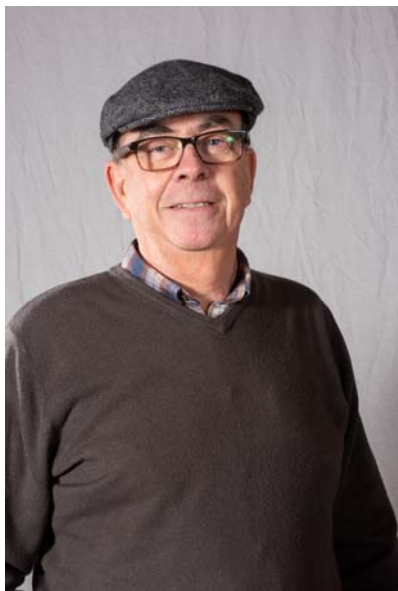
Cap it All

This month the group did not produce its usual themed images. Instead we had an introductory workshop on studio photography, which was great fun. Next month we revert to themed images which the subject will be "Connections".