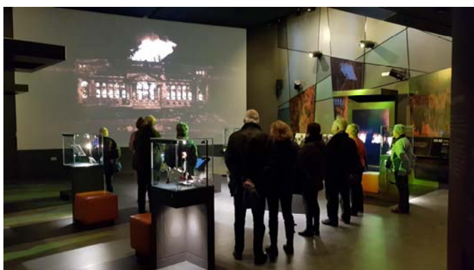
International Bomber Command Centre Museum

The group also focused on the 1939 Government Survey to reveal the occupations of adults all over England. This survey was an amazing achievement completed as on the advent of the war itself. It gave the government a complete record of the occupations of all adults in the UK, essential in helping them to plan how best to use everyone in the war effort. One of our group will analyse the results of this survey for both North and South Collingham and the results will be compared to the 1911 Census [for which we already have a report in Irregular 2].