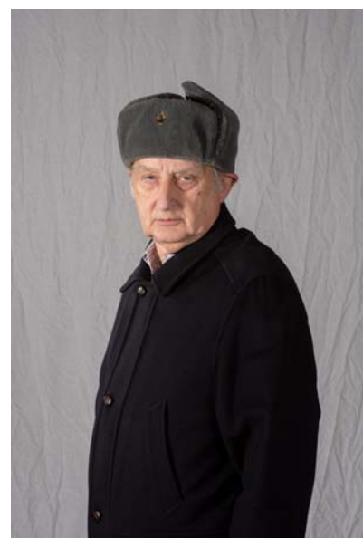
You Looking at me