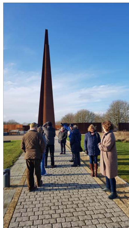
International Bomber Command Centre : The Spire

Irregular 2,3, and 4 editions are on sale in Gascoignes at £5 each. There are many articles published in these editions written by members of this group. Please support their work.