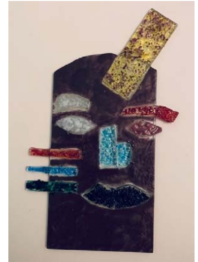
And this is Mag's abstract

The rest of us created a variety of different items from coasters, Christmas tree decorations, Flower hangings to landscapes.