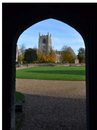
Tattershall Church