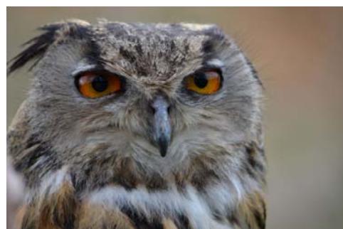
I am Watching You by Allan Allcock