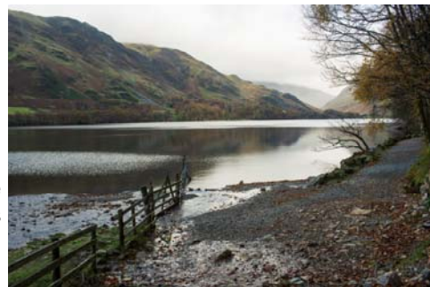
Buttermere by Paul Bass