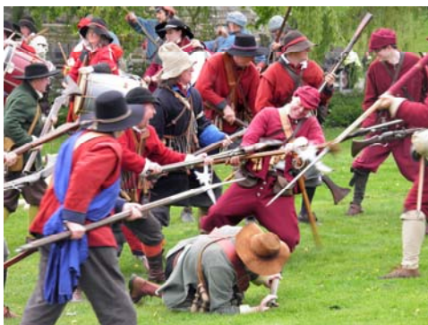
Civil War Battle by Les Murray