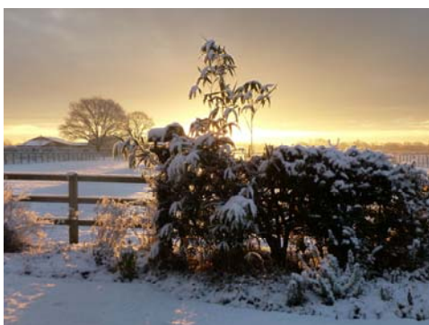
Morning Glory