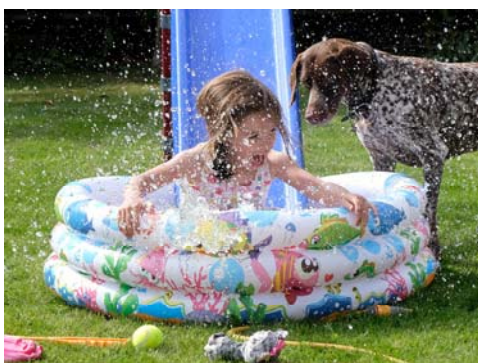
Having a splashing time