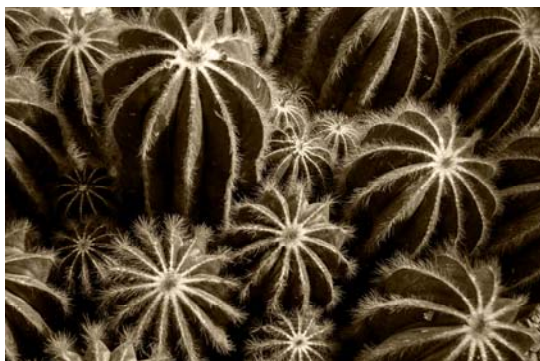
Cactus Bonanza by Gill Bass

The theme of Monochrome challenges the photography group to use form, texture and composition to make a good image, rather than to rely on colour.