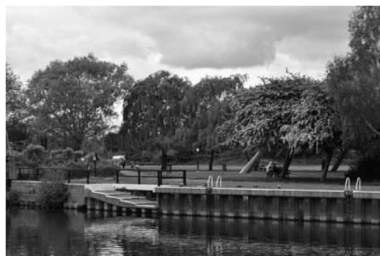
Riverside Park