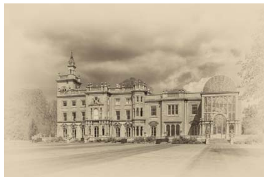
Flintham Hall