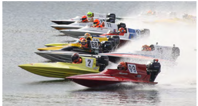
Power Boat Racers