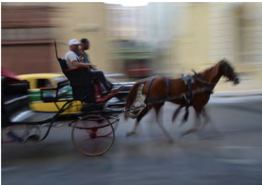
Horse Power by Allan Allcock