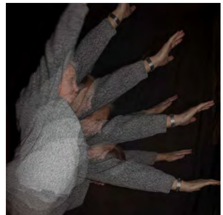
The Salutation by Paul Bass