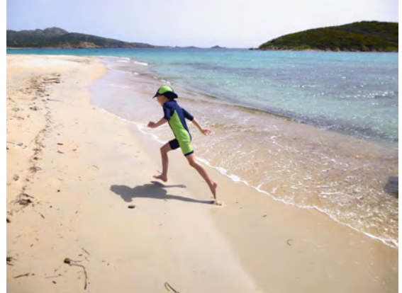
Fun on the Beach