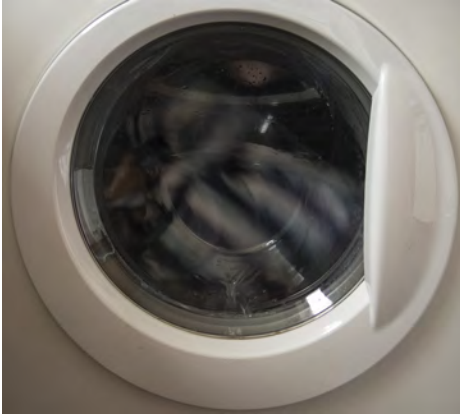
Final Spin by Gill Bass

The group had 2 themes for February: Motion and Selfie