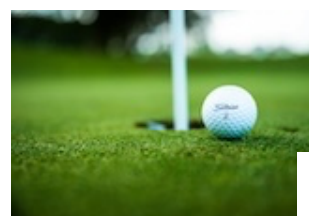
Golf for fun