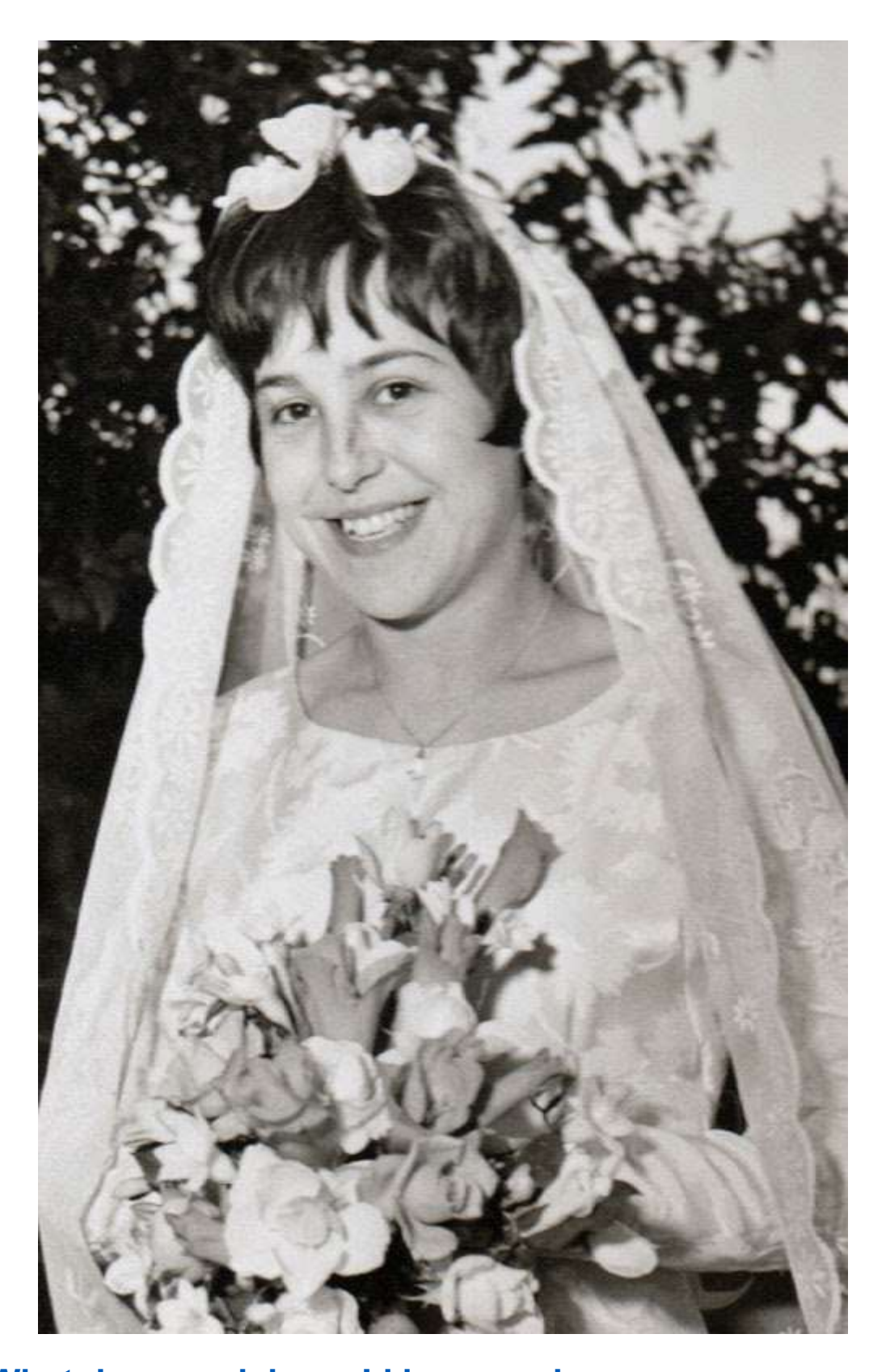
What do you wish you'd known when you were younger?

u3a members across the movement have been sharing their reflections in letters to their younger selves. The results are thought provoking and moving.