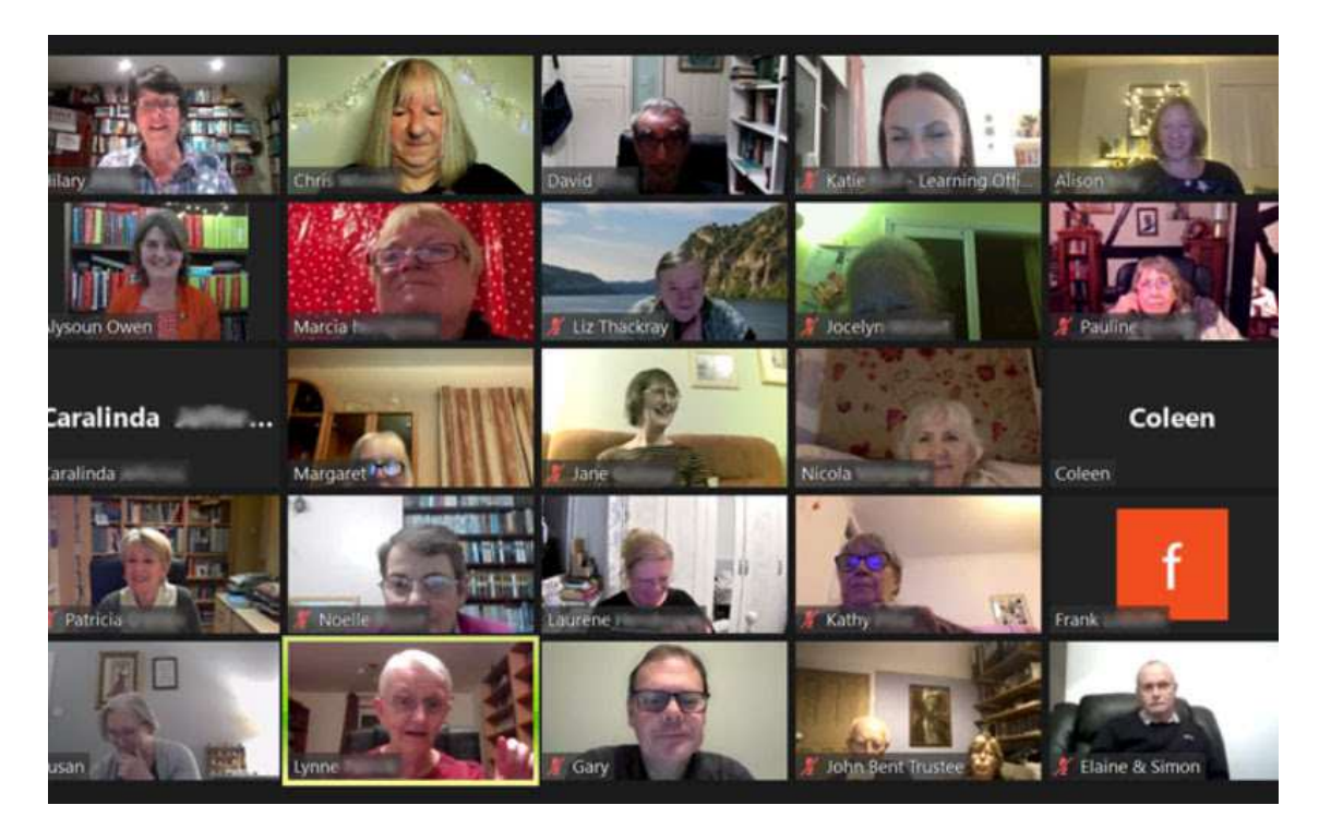
The STAR awards took place yesterday, where the winner of the 2023 Short Story competition was announced. See all the entries on <u>the</u> <u>learning pages.</u>