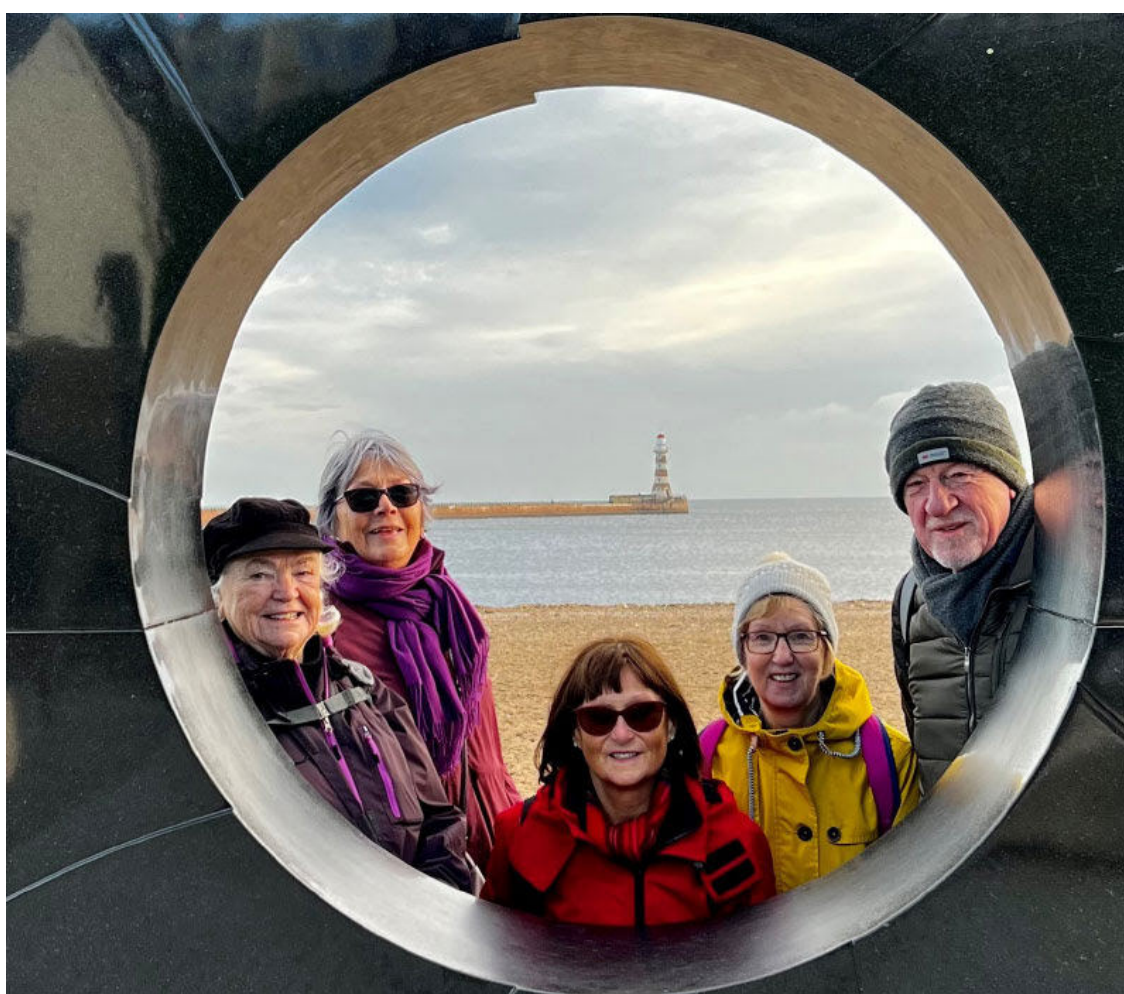
Cestria u3a walkers photographed in Roker in Sunderland

Click here to open the newsletter in your browser.