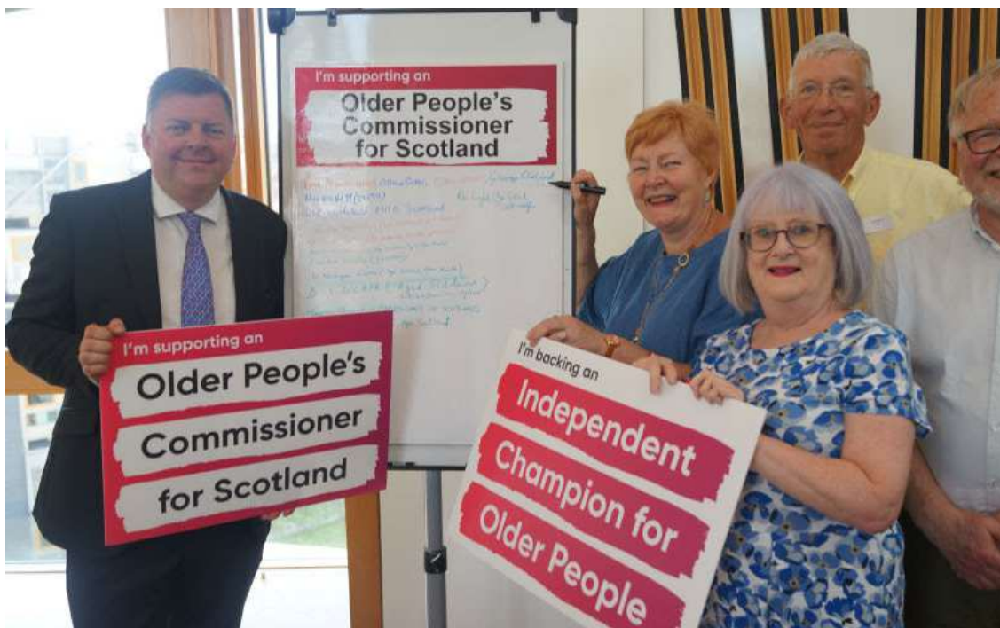
u3a members with Labour MSP Colin Smyth