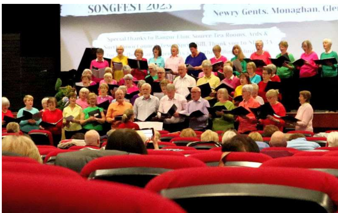
Eight u3a choirs from all across Northern Ireland came together for a SongFest.