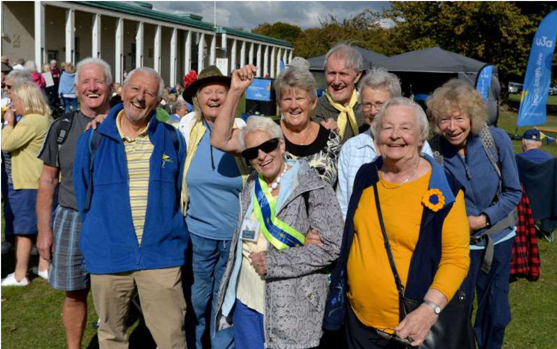
The u3a Nottinghamshire Network celebrating u3a week in 2022