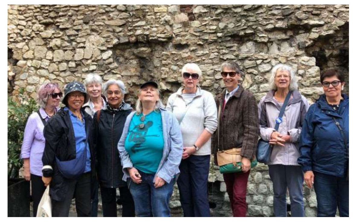
Tower Hamlets u3a celebrated Alfresco in Autumn in u3a week by exploring the Roman Walls in the City of London.