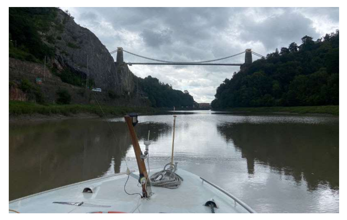
Recently almost 40 members of Thornbury u3a's YOYO group joined a boat trip along the Avon Gorge.