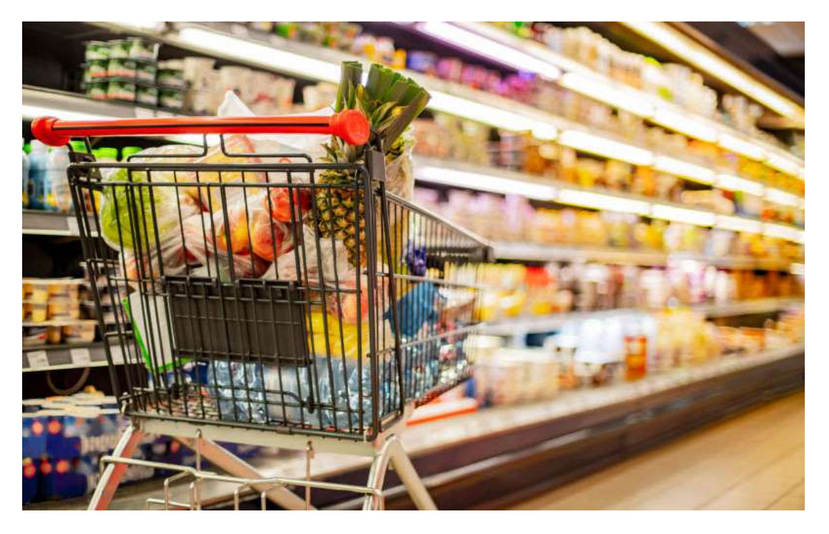
u3a Click and Save: claim an exclusive 4% discount

u3a Offers and Services is the section of the newsletter offering discounts to u3a members and friends.