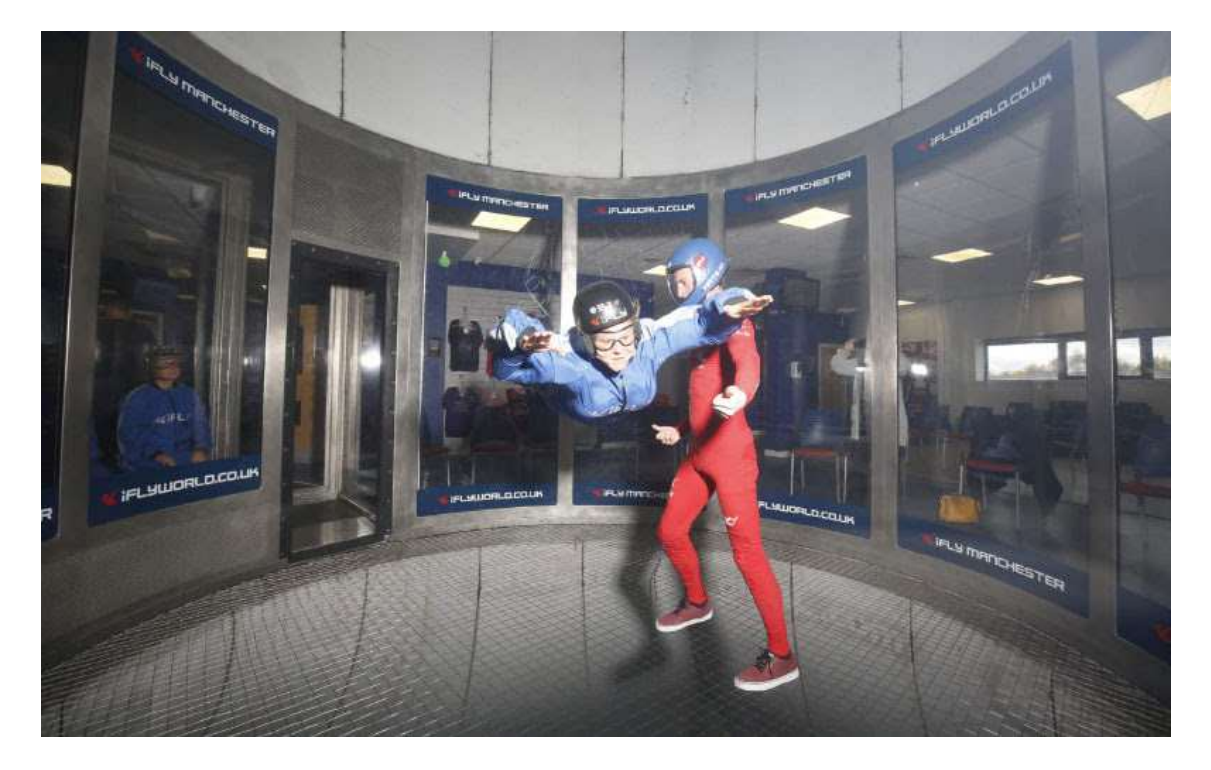
Give it a go group - podcast interview

If you have an idea for a new national activity such as a a shared project, a task or activity for members to get involved in, get in touch by emailing <a href="mailto:learning@u3a.org.uk">learning@u3a.org.uk</a>