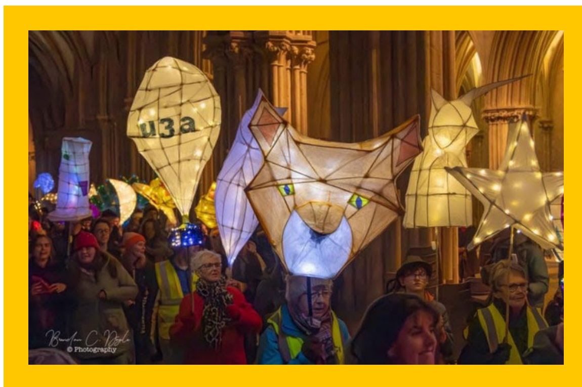
Wells u3a lighting up the night as part of the Wells Lantern Parade.

Click here to open the newsletter in your browser.