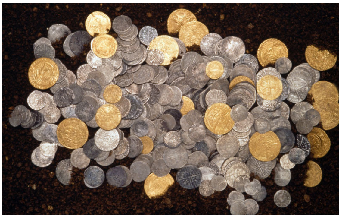
Roger's biggest find - the Reigate Hoard.