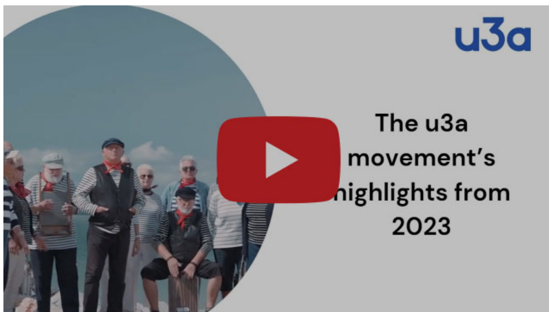
Our highlights of 2023

Thank you to everyone who took the time to email us to share your favourite radio stations. We will collate these and share some of your radio memories in the January newsletter.