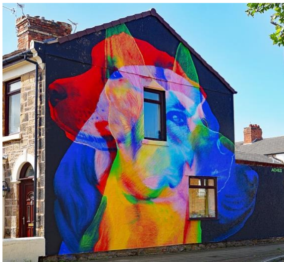
Guide Dogs - Alan Millard.jpg

In July, we had a day out at New Brighton where we looked at the street art.