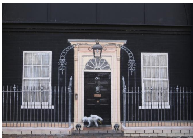
No 10 - Sue Foy.jpg

Elle Edwards was tragically shot on Christmas Eve while out with friends and family.