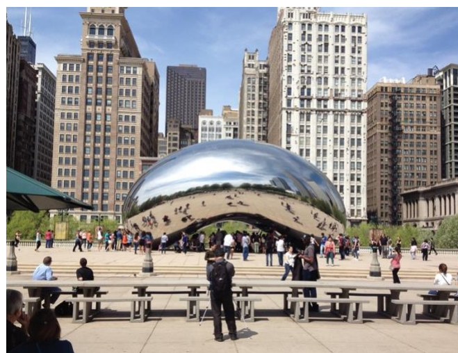
The Chicago Bean

to sit down and relax between activities. Luckily, there are many cities which meet these criteria so my choices are just idiosyncratic. I could give you a specific reason for putting each of these on my list, which in alphabetical order is Berlin, Boston, Chicago, Cordoba and Prague. You might be surprised at my omissions - London, Milan, New York, Paris and Venice, for example. I have enjoyed these, and been to the opera in all of them, but they don't quite live up to the "sit down and relax" ideal. I realise too that my list only includes cities in Europe and the USA, so I offer my apologies to the rest of the world.