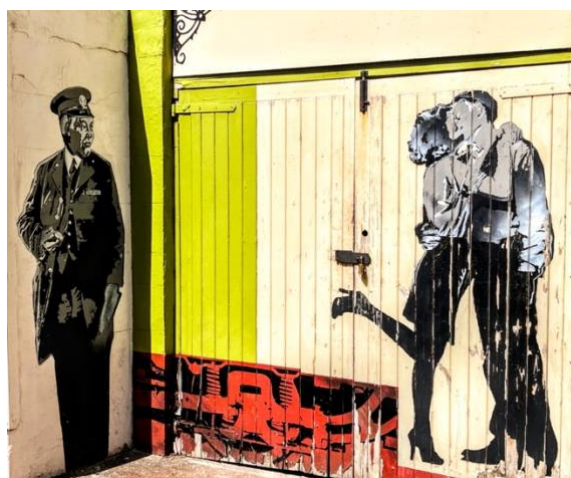
Behave - Glennys Hammond.jpg