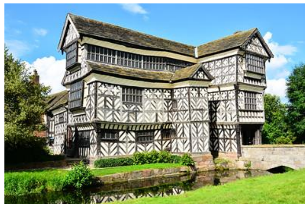
"Little Moreton Hall" M McBey CC BY 2.0.

The cost will be £32.00 or £20.00 for National Trust members.