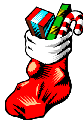
Christmas Stocking – Open Clipart

Phone Liz Flanagan to reserve your seat. 01244 341097 .