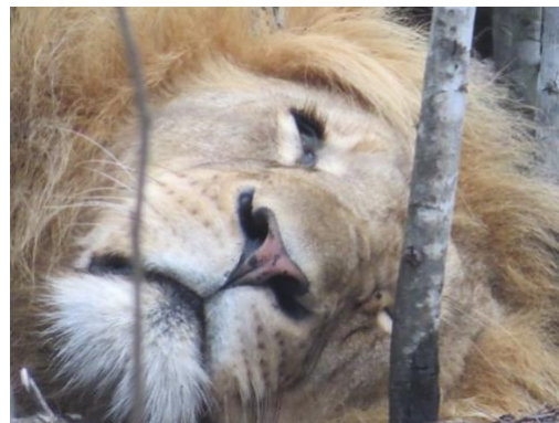
'Fat Cat'

In this talk he will explain the key drivers of pay decisions, the current state of the pay market, and how the UK stands on key "fairness" indicators.