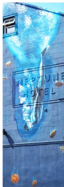
Diver - Jo Poppy.jpg