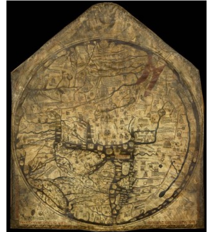
Hereford Mappa Mundi c1300.

We'll be looking at how maps can help us to understand the history of particular places at various times, taking into consideration who compiled them and for what reason. How far could they be relied on? How far were they accurate? This won't be so much a history of cartography as a look at the usefulness of maps as historical source material. We'll cover a very extensive period of time, from ancient Greek and Roman maps, through to modern developments such as aerial photography, Lidar and GPS - and everything in between!