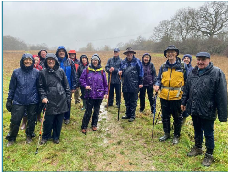
Nothing stops the Morning Walkers!

May I wish a Happy New Year to all those walkers who didn't make January's outing, which proved to be the wettest and muddiest walk we have ever been on. 15 of us ventured out and everyone stayed for lunch.