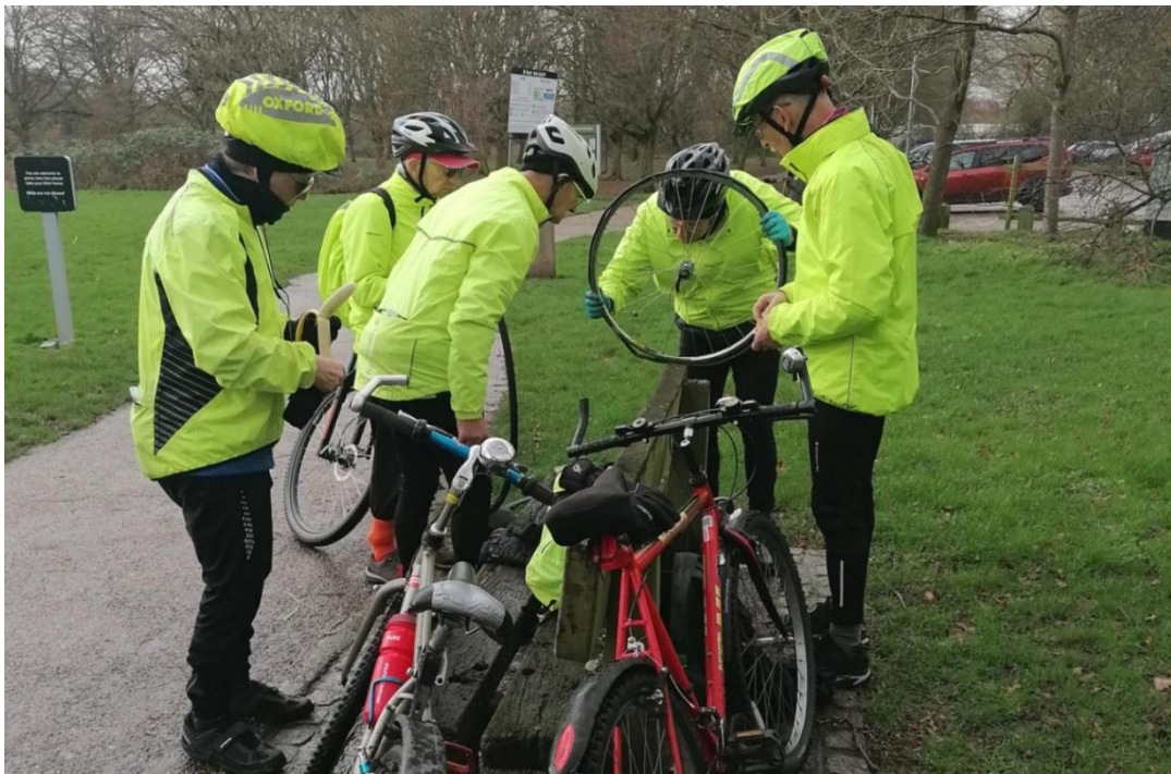
How many hi-vizes does it take.....?

We now turn out around 40 riders every Wednesday morning! The riders have a mix of electric and conventional bikes. At present there are six separate groups of various abilities meeting at various locations. Most groups aim to stay off-road on decent tracks within the Lea Valley, venturing further afield at times on quiet roads and cycle lanes. If interested please get in touch.