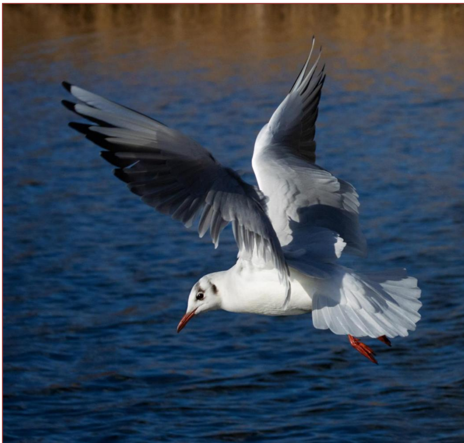
Black-Headed Gull in Flight