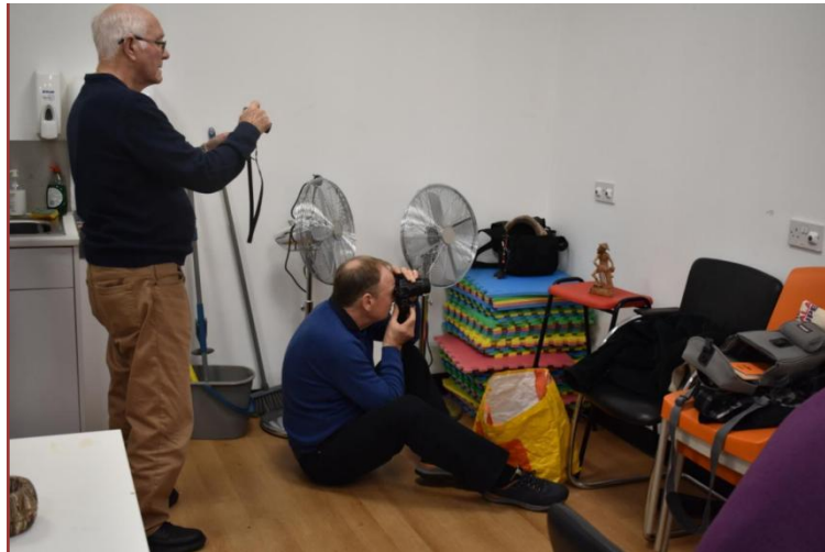
Still Life - and the model's not moving either

Our usual group meeting took place on Wednesday 14 th February where we practised table top photography. Our next meeting will take place on Wednesday 13 th March at 2:00pm at Brookfield Tesco Community Centre reviewing our images from the table top photography. Refreshments are provided courtesy of Tesco. Do come and see me at the main meeting if you are interested in joining our friendly group of amateur photographers.