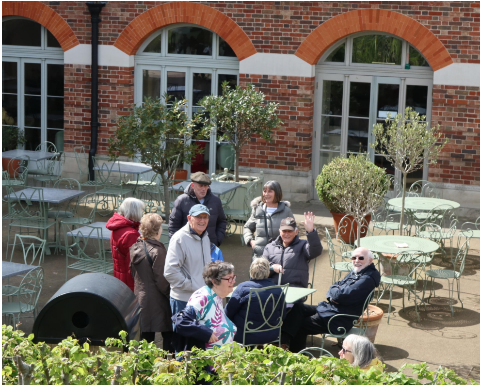
Exploring London Group 3 at Kensington Palace

Our next planning meeting is 1 st May – 11:15am at Cheshunt Free Church, High St. Cheshunt