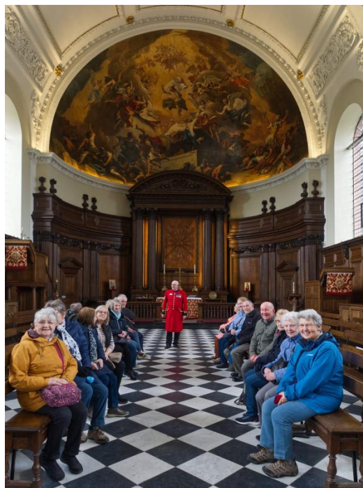
Exploring London Group 4 at the Royal Hospital, Chelsea

Cheshunt u3a Committee Election and AGM will take place at the Main Meeting held today