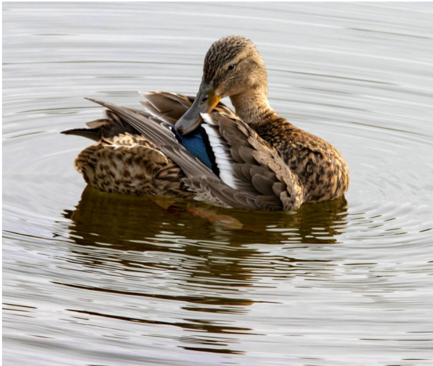
A girl works hard to look good....

The Bird watching group meets on the second Monday of the month, so the next meeting will be on 13 th May 2024 . We have visited the Bittern Hide in Lea Valley Park, and Rye Meads RSPB reserve and Amwell reserve. We are a relaxed and friendly group, meeting in the morning and spending a couple of hours visiting hides, and on a gentle stroll, spotting birds as we go.