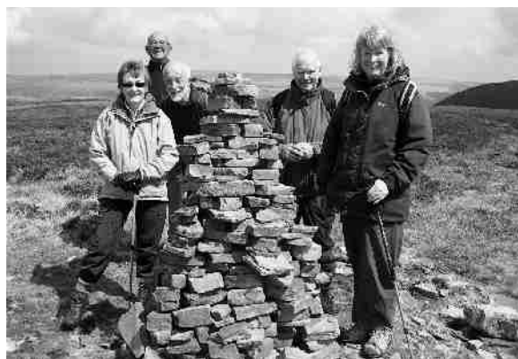
Over Bleaklow from Old Glossop in May