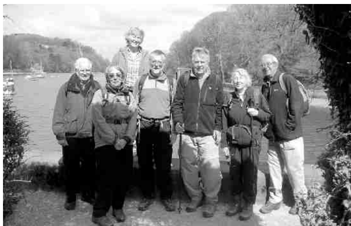
Sunshine for the walk round Rudyard Lake