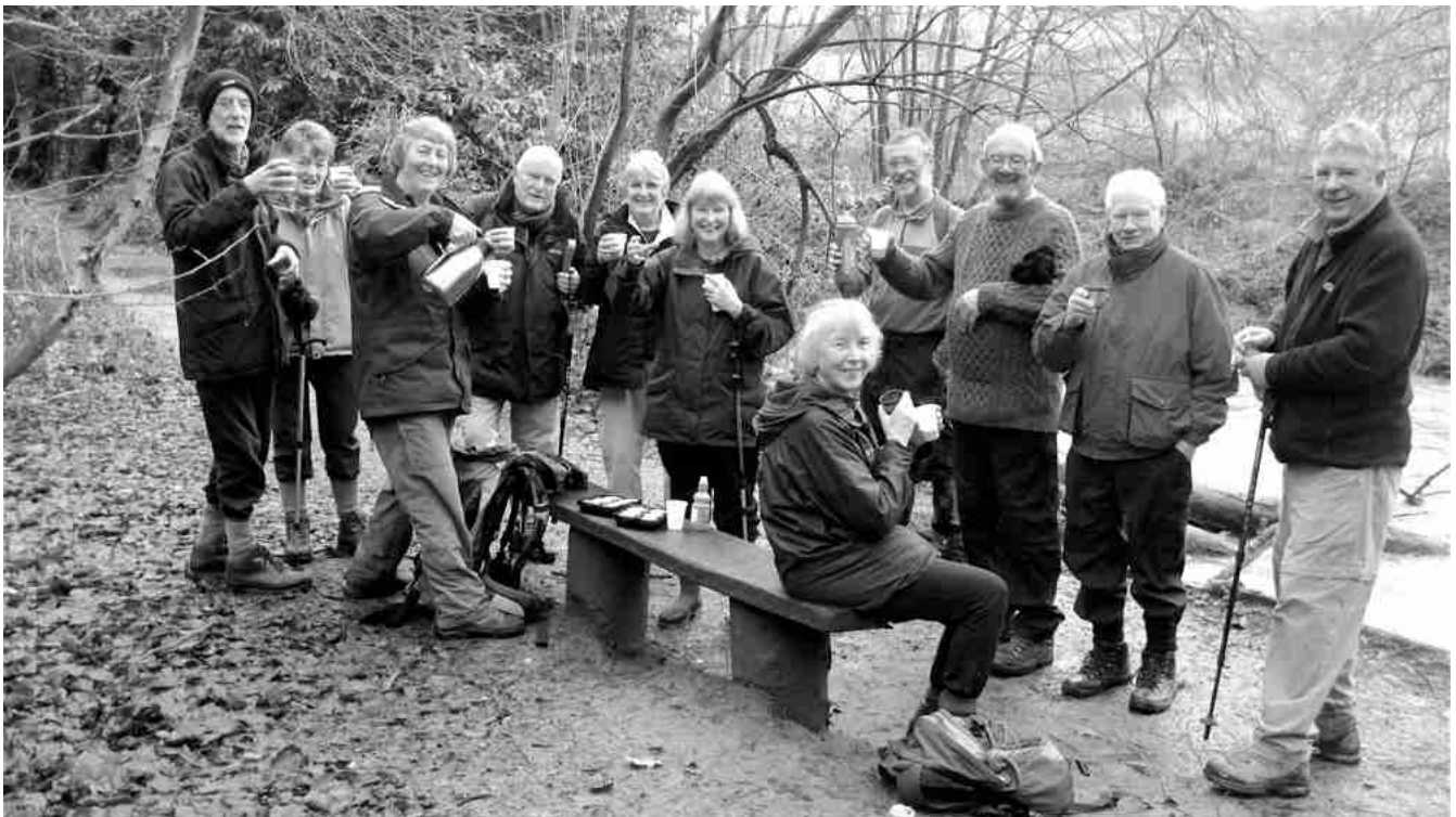
Members of the Long Walking Group enjoy mulled wine and mince pies for elevenses on the December walk along the Bollin Valley!