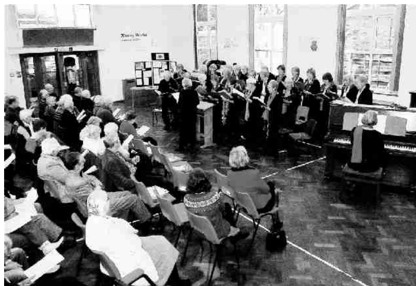
The choir entertains at the December Monthly Meeting