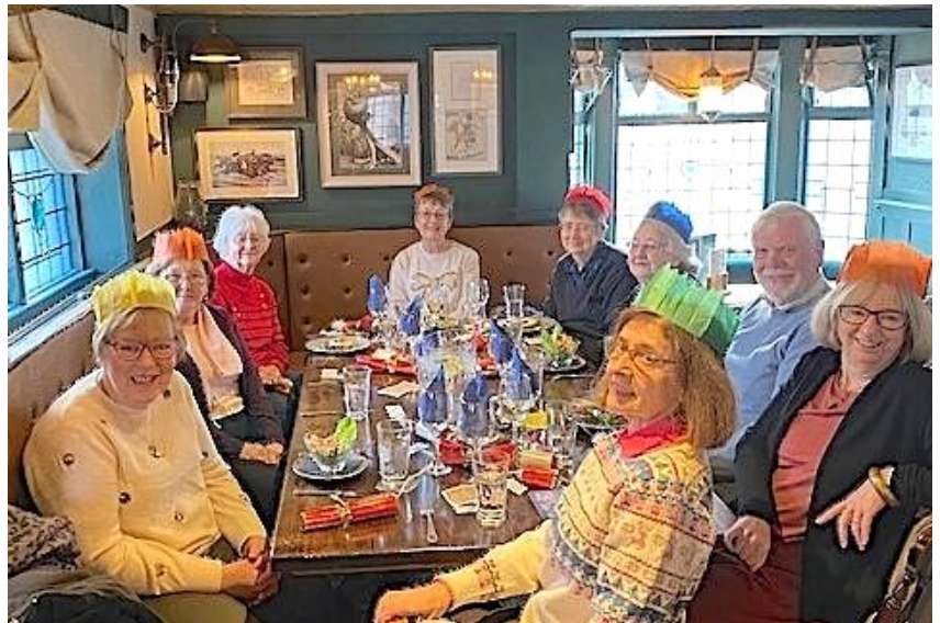
Our Christmas meal at the Horse and Farrier

Here are our latest reads with a star rating out of 5.