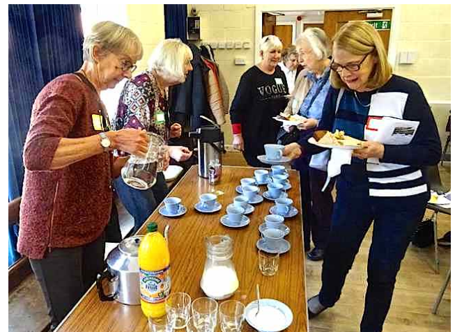
New Members' Meeting