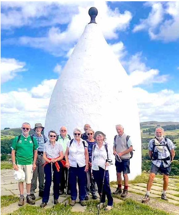
The Long Walks Group at the White Nancy ...

We have 26 varied activity and interest groups such as Walking, History, Spanish, Painting, Gardening, Bridge, Reading and Craft.