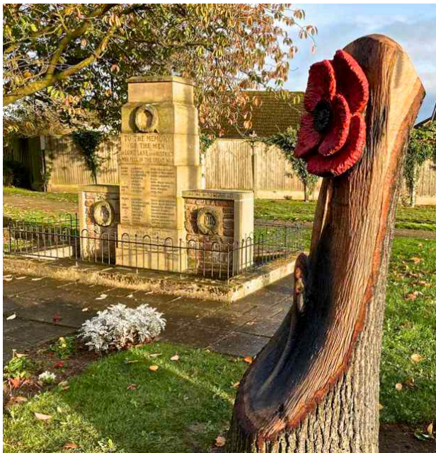
Memorial sculpture at Heald Green

I was sent more images than I had space to include in this edition. To fill this spare half-page, here are a few which didn't make the main pages.