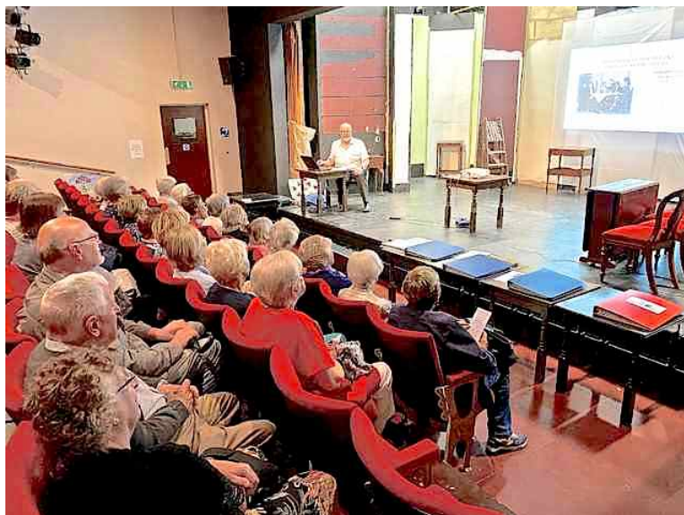
Our visit to the Heald Green Theatre