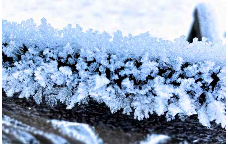
Ice crystals in the Big Freeze