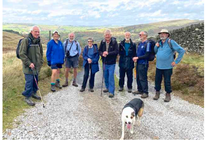
... with sunny intervals on the way down to Birch Vale