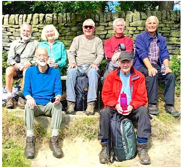
... and in the Longdendale valley

Enjoy activities, talks, outings, social events, fun and friendship, all for a membership of £12 per year.