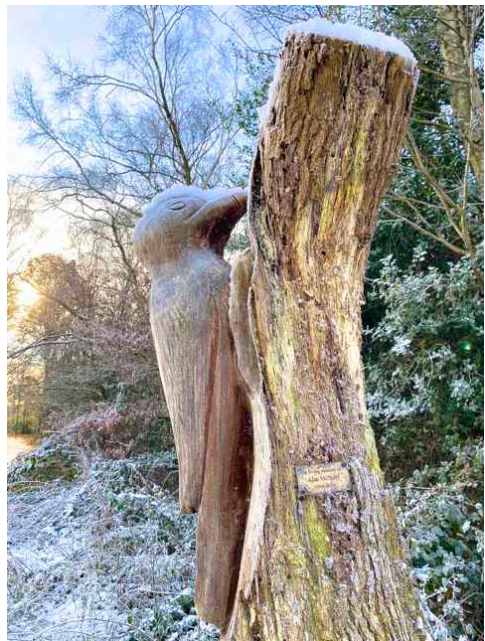
Wood sculpture near Black Lake