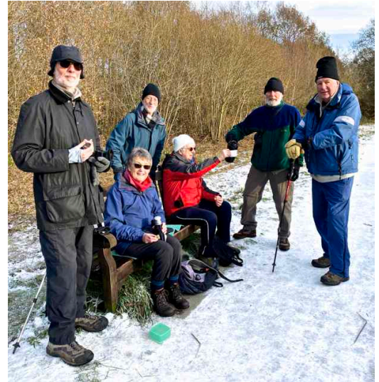
Mulled wine, stollen and mince pies at Black Lake