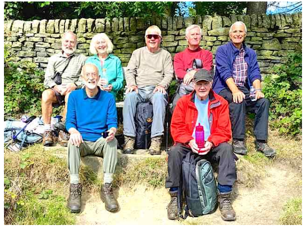
Sunny rest stop on the way back