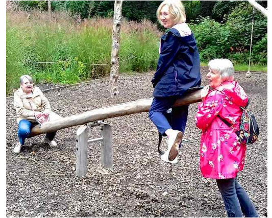
Pensioners? What pensioners? Fun on the adventure playground!

On behalf of the whole of Cheadle and Gatley u3a, the Treasurer would like to thank all member of the Explorers Group for their generous decision to donate £1 per member per meeting to general u3a funds.