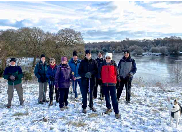
By the un-named lake near Saltersley Hall Farm