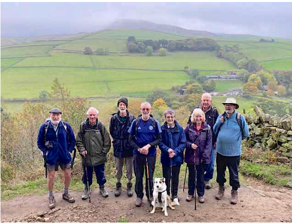
Cloudy over Kinder on the way up Mount Famine ...