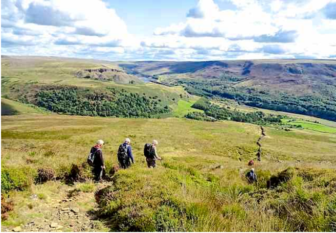
Heading from Lad's Leap down into Longdendale