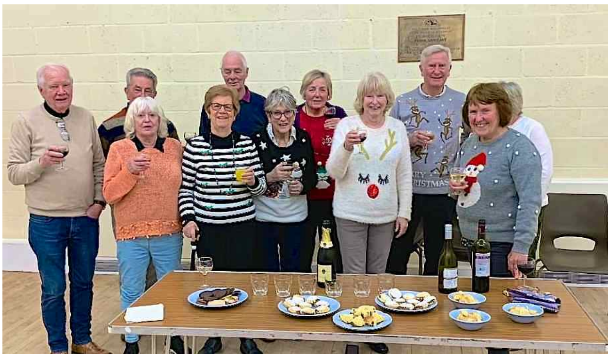
The Bridge Group Christmas party

If you would like to join us please give me a ring on the number above. Anyone who would like to come along for a visit to see what it is like just turn up on the day.