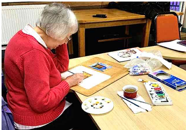
Working with concentration