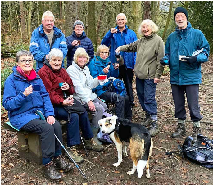
Long Walks Group having mulled wine and mince pies

We have 26 varied activity and interest groups such as Walking, History, Spanish, Painting, Gardening, Bridge, Reading and Craft