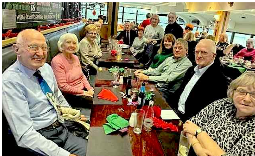
Christmas lunch at the Boathouse