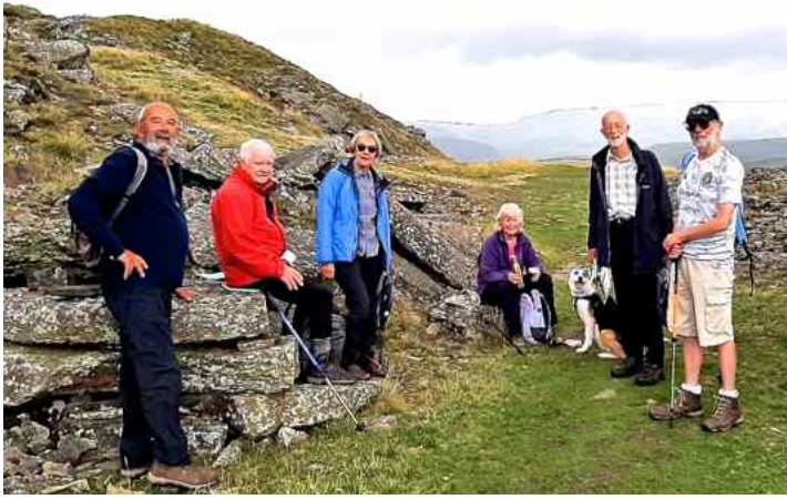
On the Chinley walk