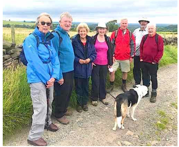
Heading for Lyme Park