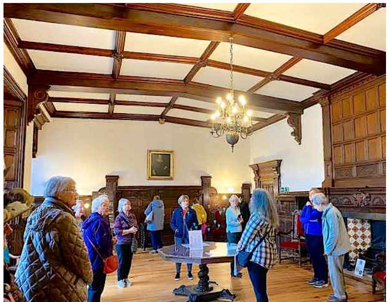
The Local History Group in Wythenshawe Hall

Cheadle and Gatley u3a is a Registered Charity, Number 1172853