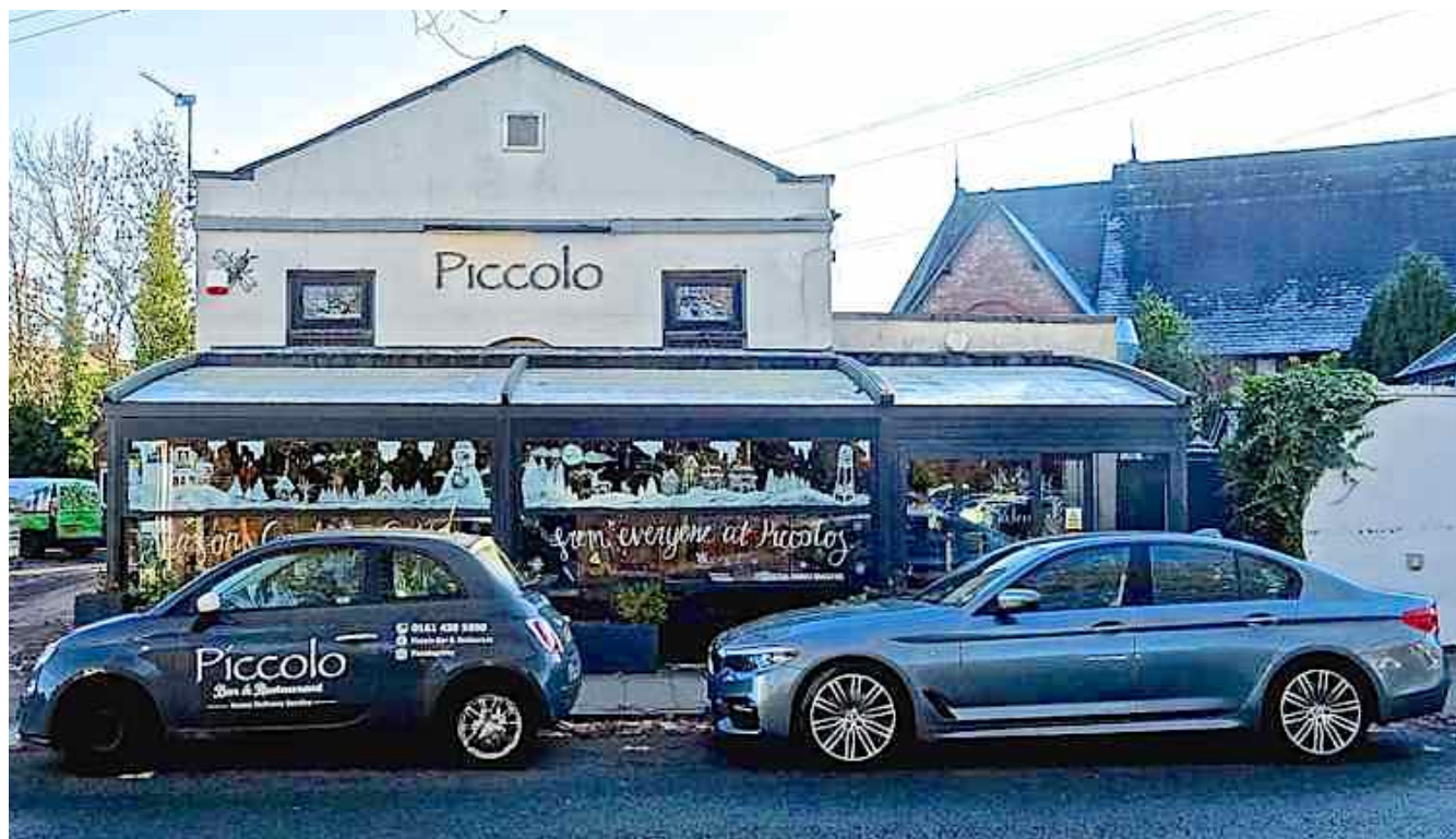
The Chapel in December 2023