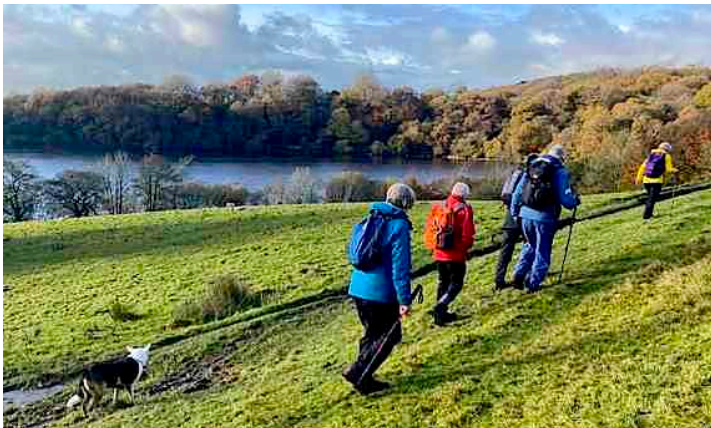
Above Anglezarke Reservoir