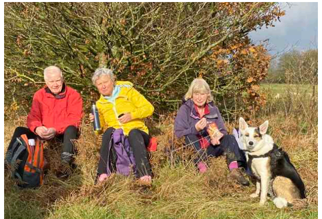
A sunny lunch spot in November