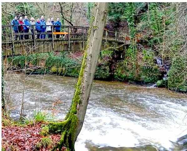
On Giant's Castle Bridge over the Bollin