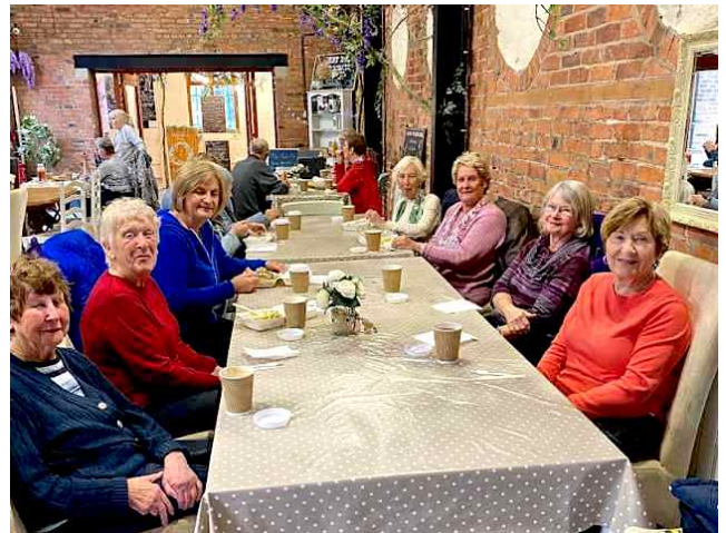
Some stayed for lunch in the Courtyard Café