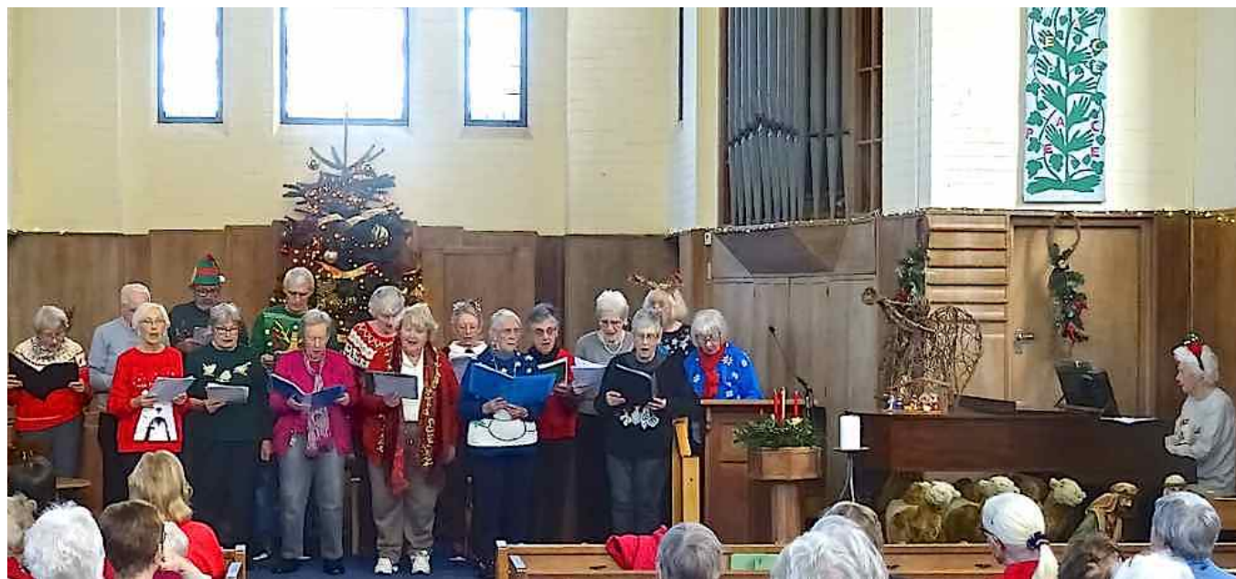
The Group sing for us at the Christmas meeting

New members are always welcome. Sessions are informal and the emphasis is very much on 'singing for pleasure'.