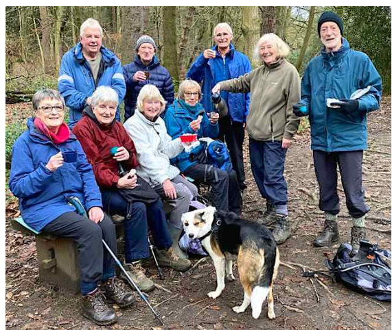
Mulled wine, stollen and mince pies for elevenses