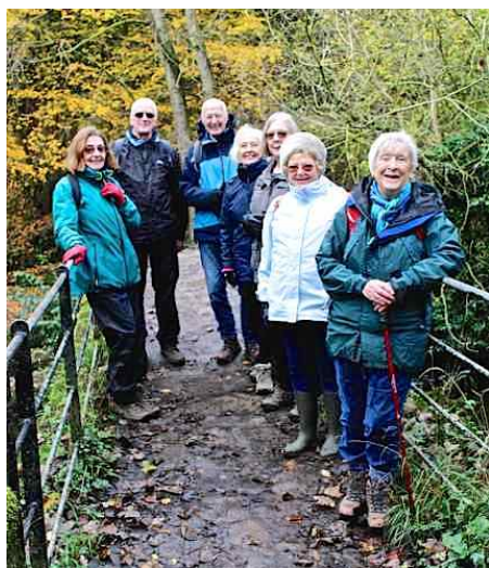
Autumn around Marple

The Short Walking Group undertake walks between 4 and 5 miles which are not generally hilly. We meet outside the URC on the second Thursday of the month at 10:00. There are usually plenty of members with cars so transport to the start of the walk is not a problem. We pick walks that are under 1 hour travelling time. The walks are led by different members each month and an e-mail is sent out beforehand with details of the walk.