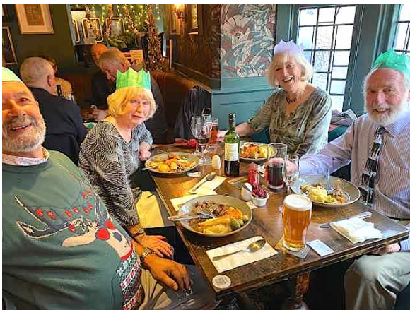
Lunch at the Horse and Farrier