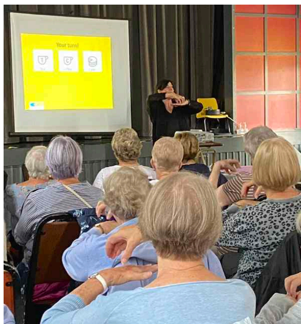
Learning the sign language Makaton

In July 2023 we learnt the special sign language used by people with Down's Syndrome during an inspirational presentation called The Upside of Down's Syndrome , and in September we took part in a mock trial at a Magistrates' Court.