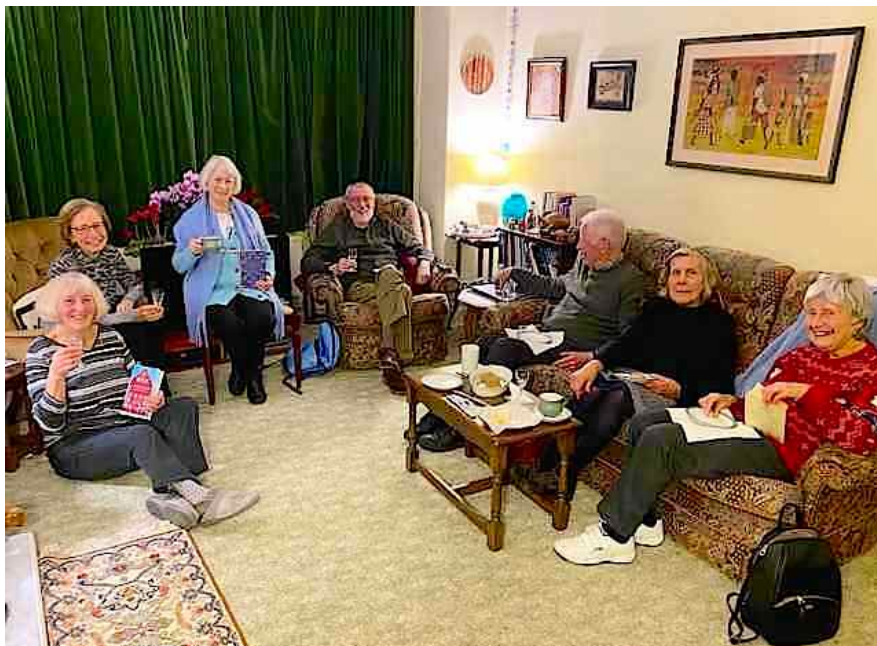
December meeting – festive refreshments after discussing books about Christmas

Our Group is a house group, meeting on the first Monday evening.