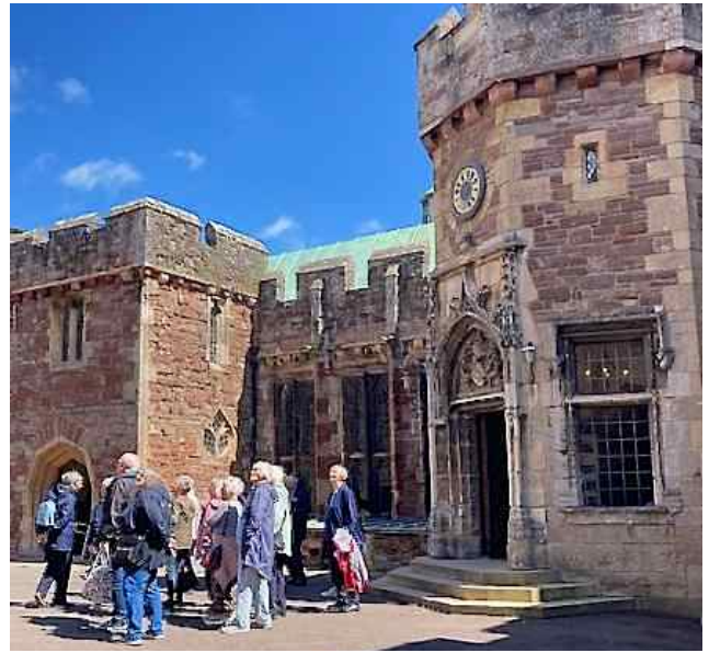
Explorers at Berkeley Castle

Enjoy activities, talks, outings, social events, fun and friendship, all for a membership of £12 per year