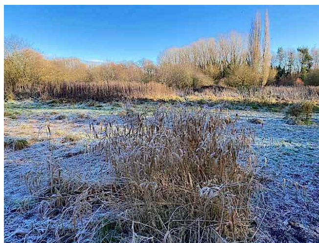
Gatley Carrs on a clear frosty morning