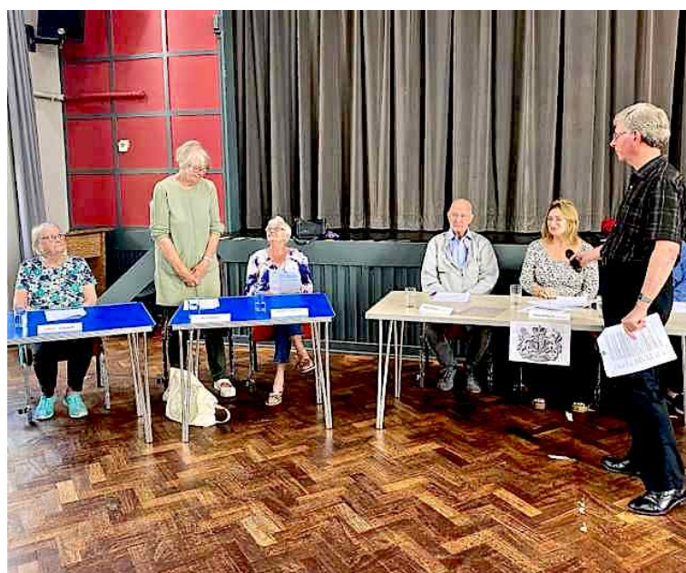
The mock trial