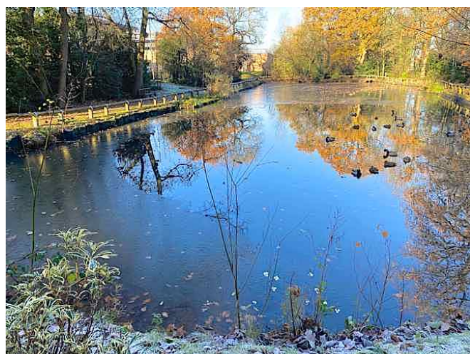
The pond at Cheadle Royal Business Park