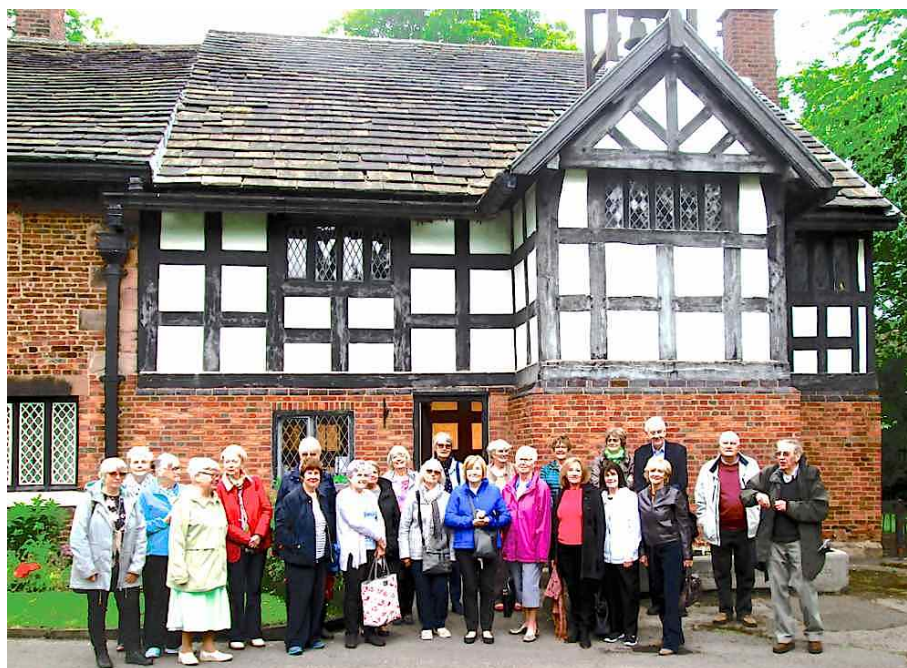
The Local History group at Clayton Hall.

In November we will probably have a Remembrance theme to our meeting and we do not meet in December but attend the Christmas social event.