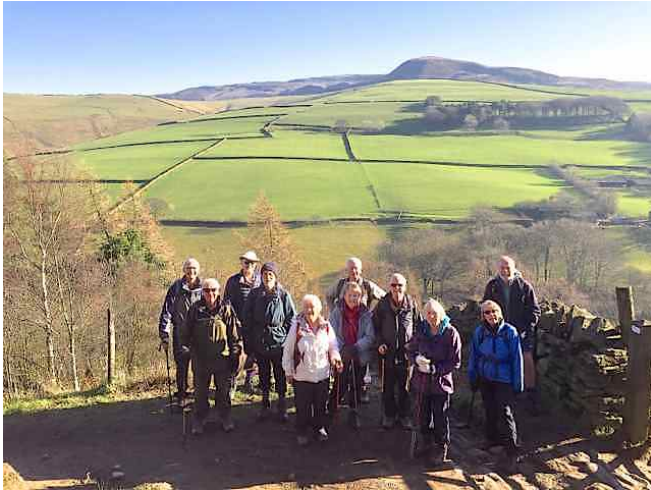
Heading up out of Hayfield with Kinder Low End above.