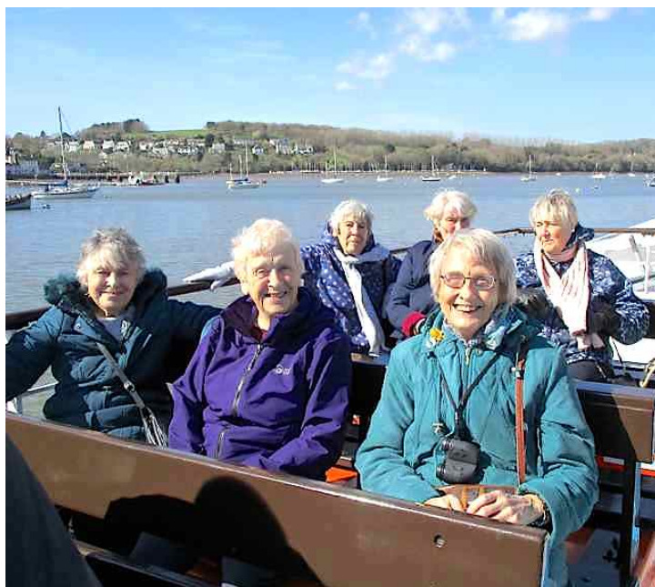
Cruise on the river Dart.