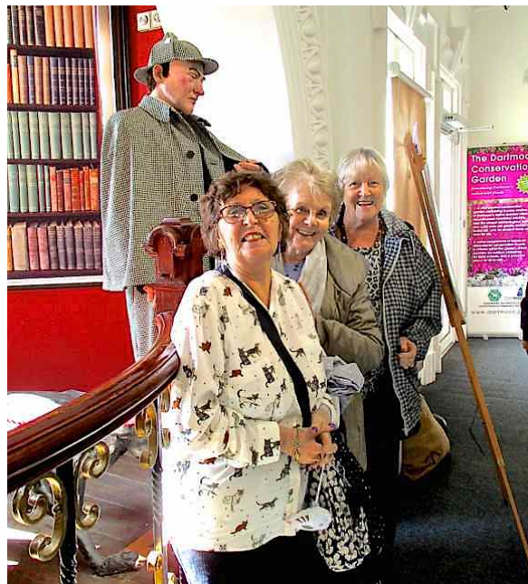
At the Visitor Centre at Princetown on Dartmoor.