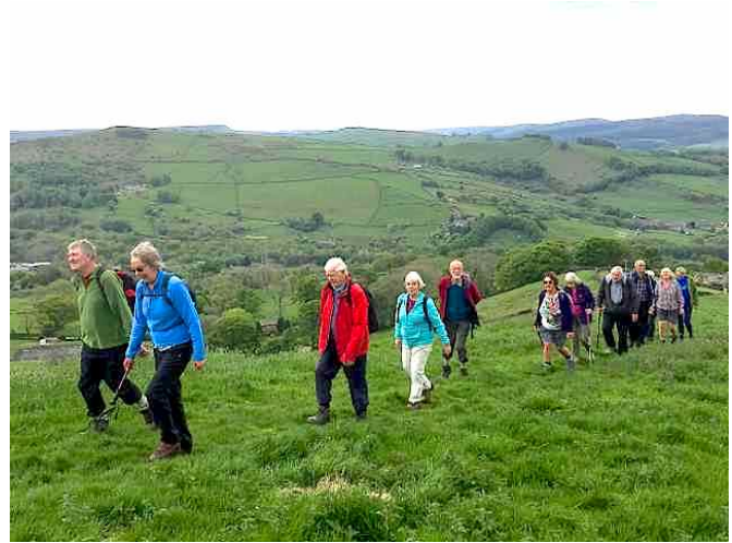
Heading up from Bugsworth towards Chinley Churn.