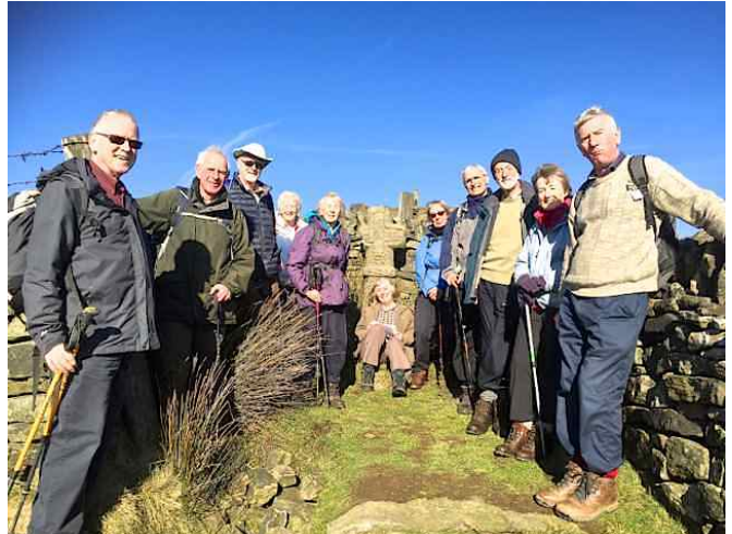
At Edale Cross.