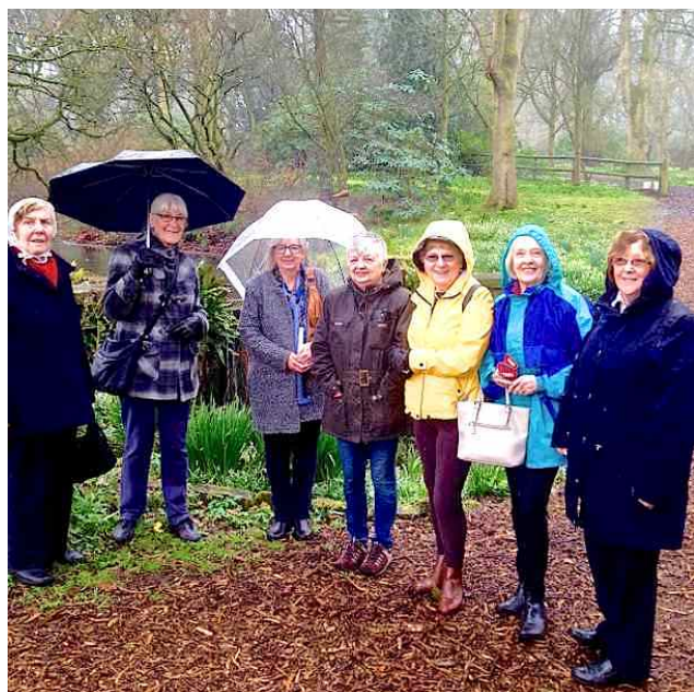
A damp day at Rode Hall.

May was a visit to Arley Hall to see the renowned herbaceous borders, the walled garden and nursery. In June the group are going to Bluebell Cottage Gardens and Nursery.