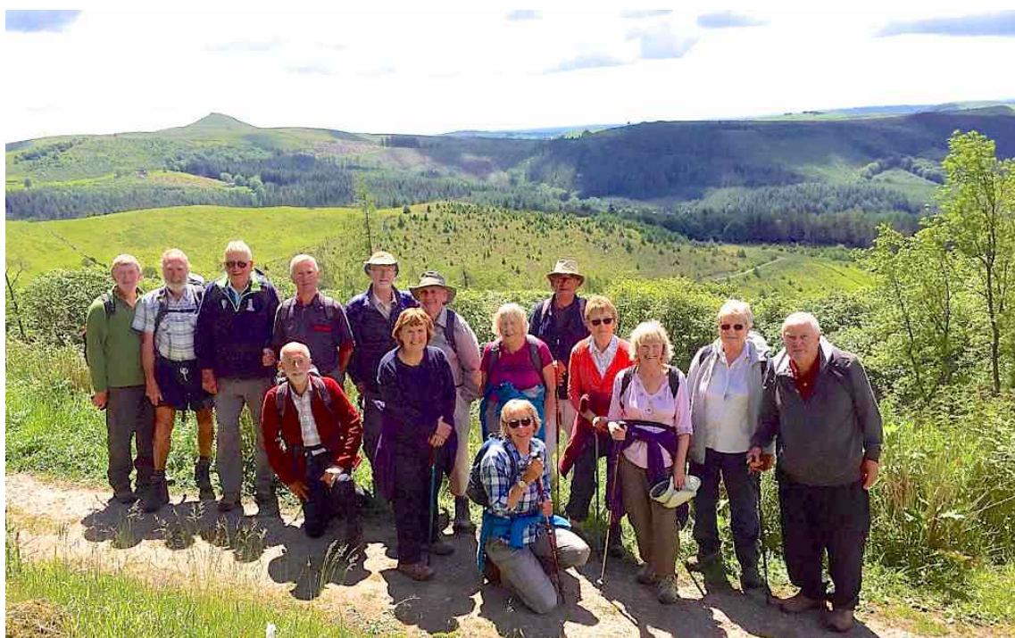
High in Macclesfield Forest, with Shutlingsloe on the skyline.