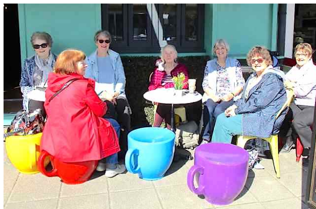
Coffees all round.

We continued our journey via Totnes to Dartmouth, which was sparkling in the sunshine on the estuary of the River Dart. The Naval College stands high up above the town and "Greenway", Agatha Christie's former home, can be seen on the banks too. This is now owned by the National Trust and is a popular place to visit.