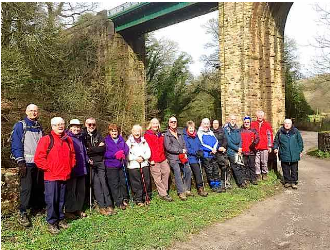
At the railway viaduct over the Goyt.