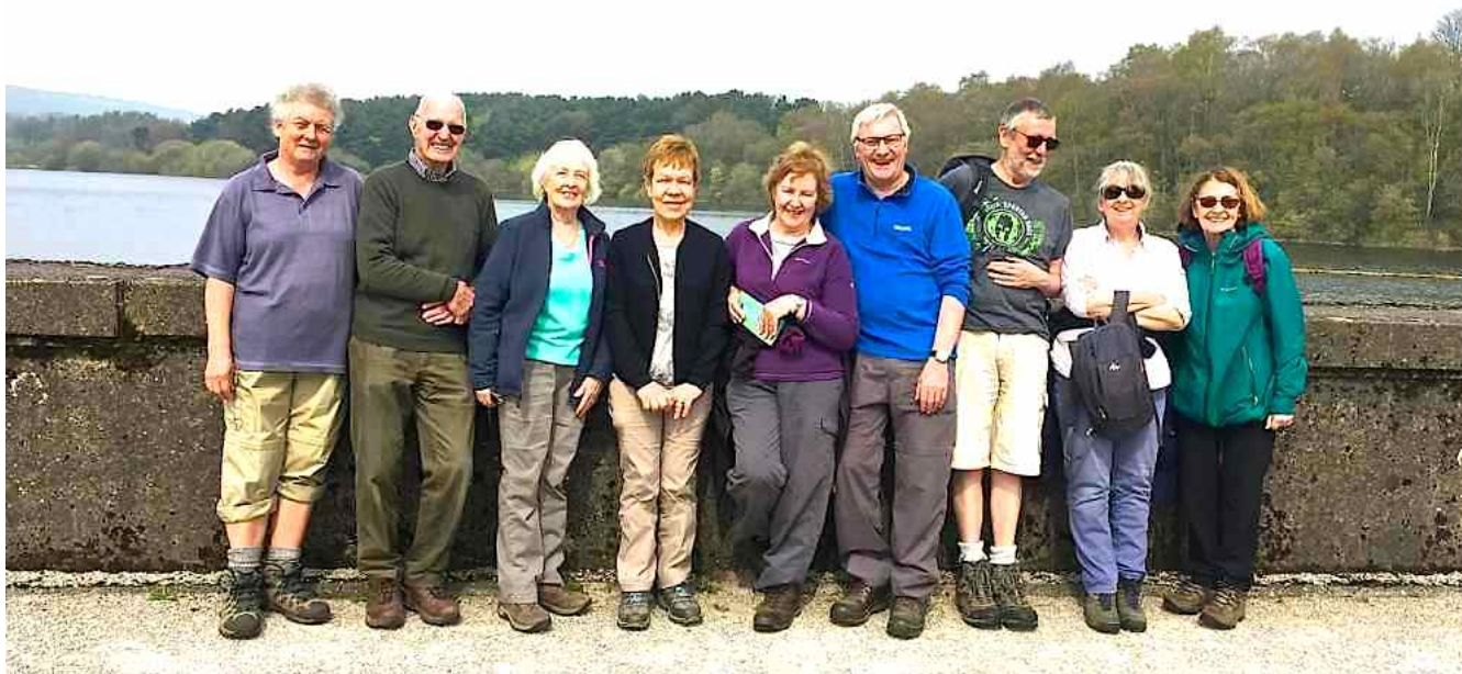
At Tittesworth Reservoir.