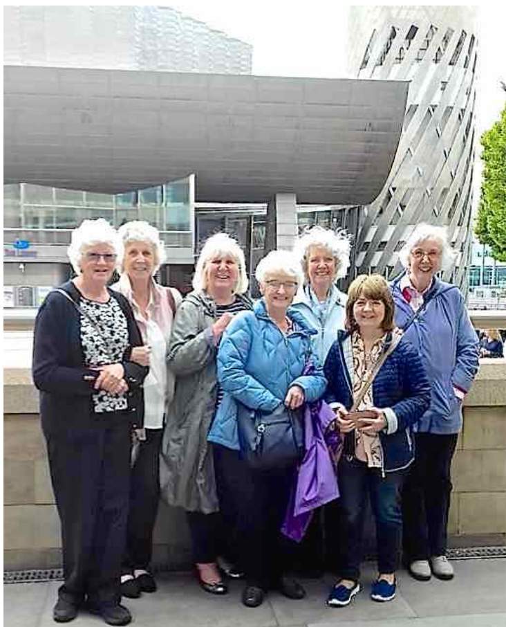
Some members of the Group on a visit to the Lowry.

Thanks to members of the Group for permission to reproduce their work.