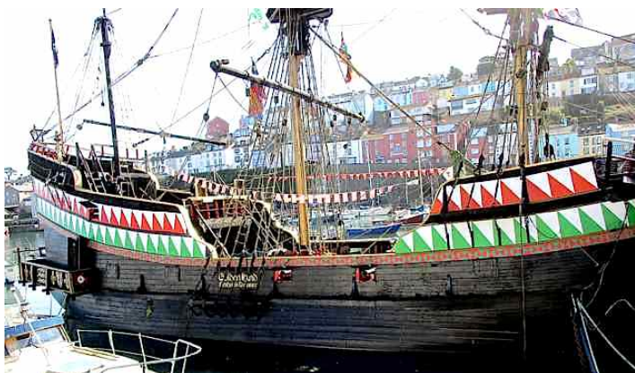
The Golden Hind.

Day Two - Dartmouth via Brixham. We set off in glorious sunshine once again, bound for Brixham, our first stop. A museum ship, which is a replica of the first ship to circumnavigate the globe, the Golden Hind, captained by Sir Francis Drake, is moored in the harbour. It has various points of interest on board with interactive features for amusement and education. As Sir Francis wasn't at home, we called into a coffee shop on the opposite side of the road, which served large cups of coffee either to drink out of or to sit upon!