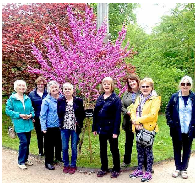
In the Spring Garden at Dunham Massey.

Still to come this year are visits to Norton Priory Museum, Cholmondeley Castle Gardens and to members' houses for a plant cutting and swap session and a Christmas craft and decoration session.