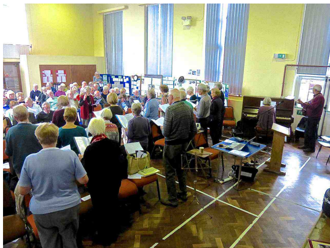
The choir led the audience in songs which reflected aspects of Manchester's heritage.