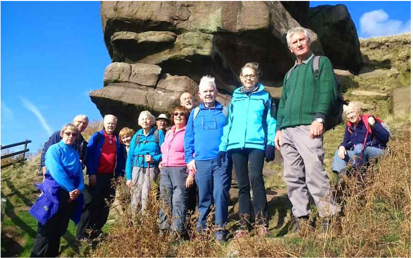
En route to Ludd's Church