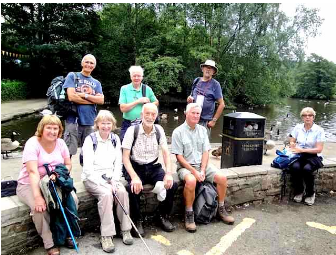
In the Etherow valley