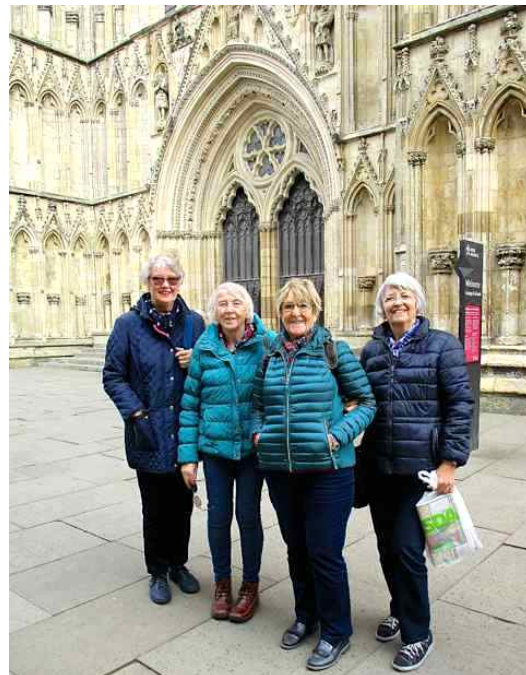
York Minster cAD 637, ASDA Bag 2018

On a Sunday the glorious Minster is closed in the morning for a service attended by various dignitaries but some of the dignitaries in our own group managed to look around later.