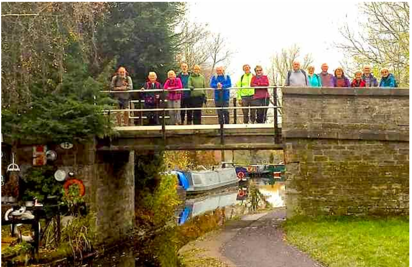
Crossing the canal en route to Lyme Park