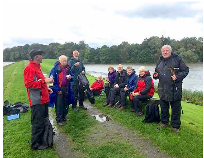
At Worthington Lakes