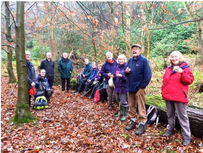
In the Bollin valley