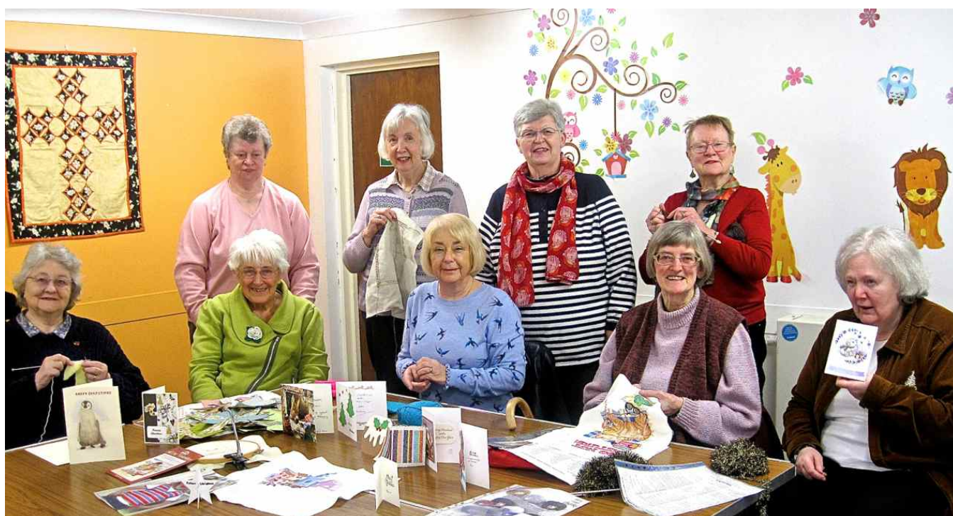
The Craft and Sewing Group