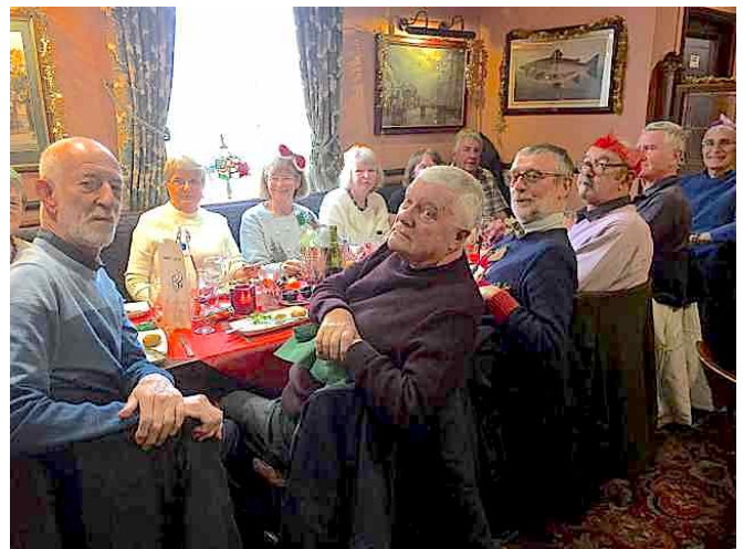
At the Red Lion