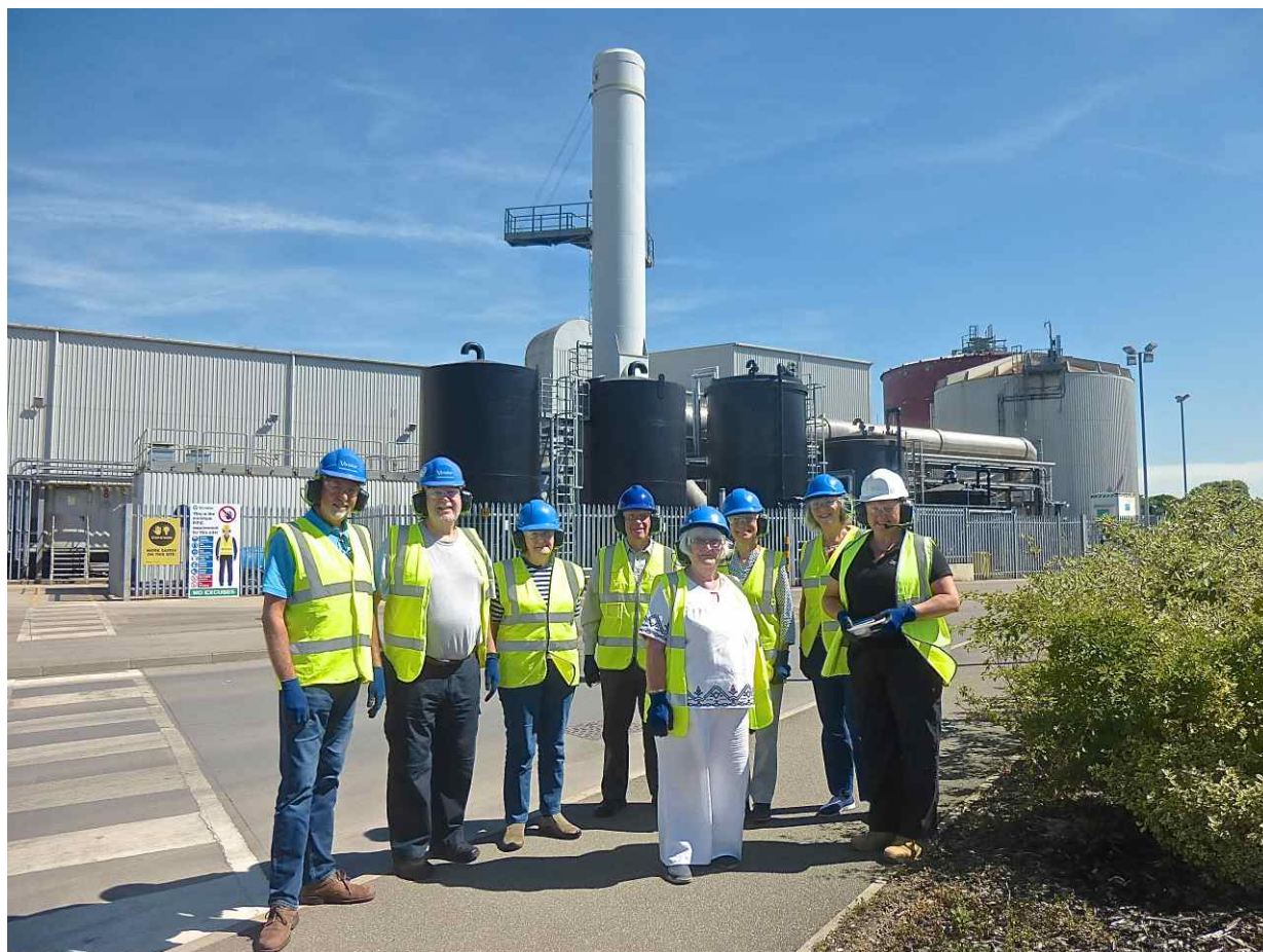
Some of the Environment Group visiting Sharston Materials Recovery Facility for a talk and a tour