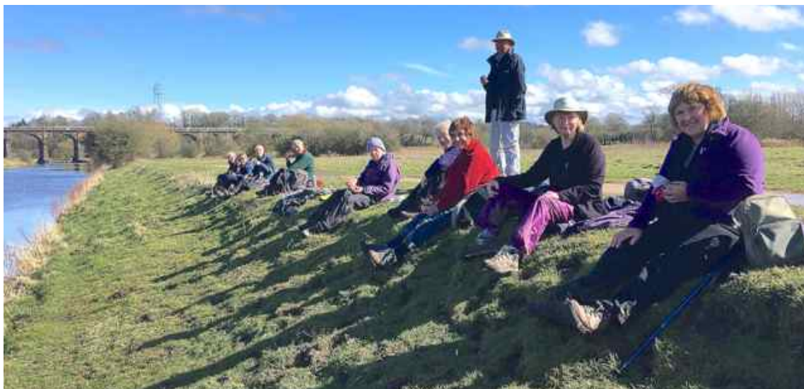
A drizzly morning turned into fine afternoon for lunch by the river Weaver