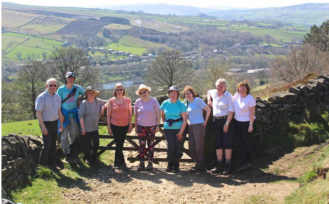
A view over Birch Vale from the route to Lantern Pike

For the remaining part of the year we have 6 more walks including The Roaches, Shutlingsloe and Rainow. We meet on the third Thursday of the month outside the URC at 10 a.m. and if anyone wishes to join us you can contact me as above.