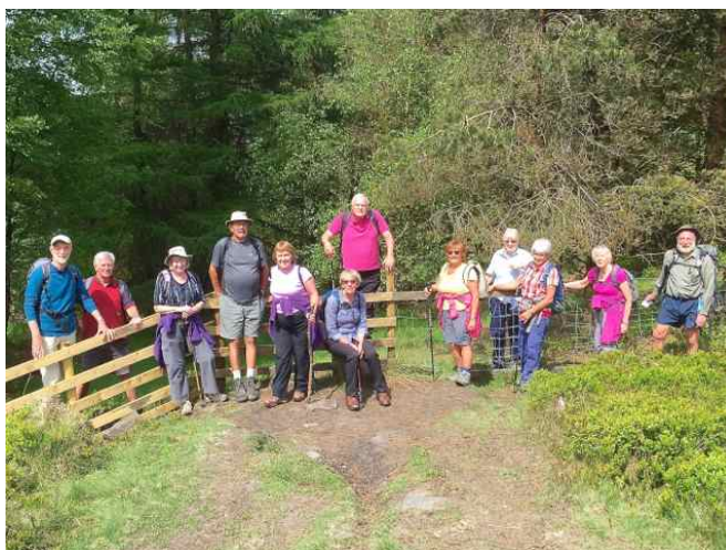
Emerging from the bluebell woods above Chorley