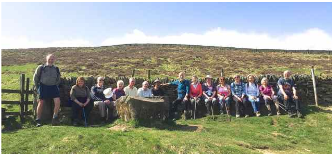
A convenient seat for the old folk on Abney Moor

Car sharing from Gatley Hill House is the normal arrangement. If you would like to join us for fresh air and exercise in marvellous countryside with convivial company, then register your email to receive monthly details of the forthcoming walks, and feel free to come on as many or as few as you wish.