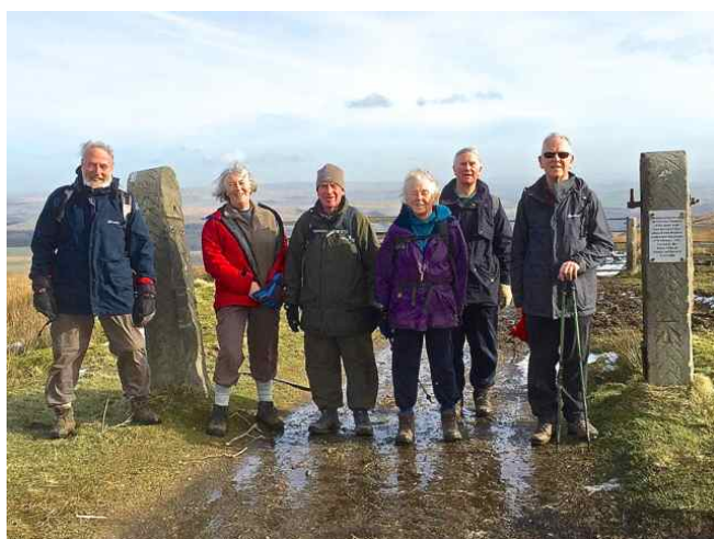
Well wrapped up on Winter Hill in February