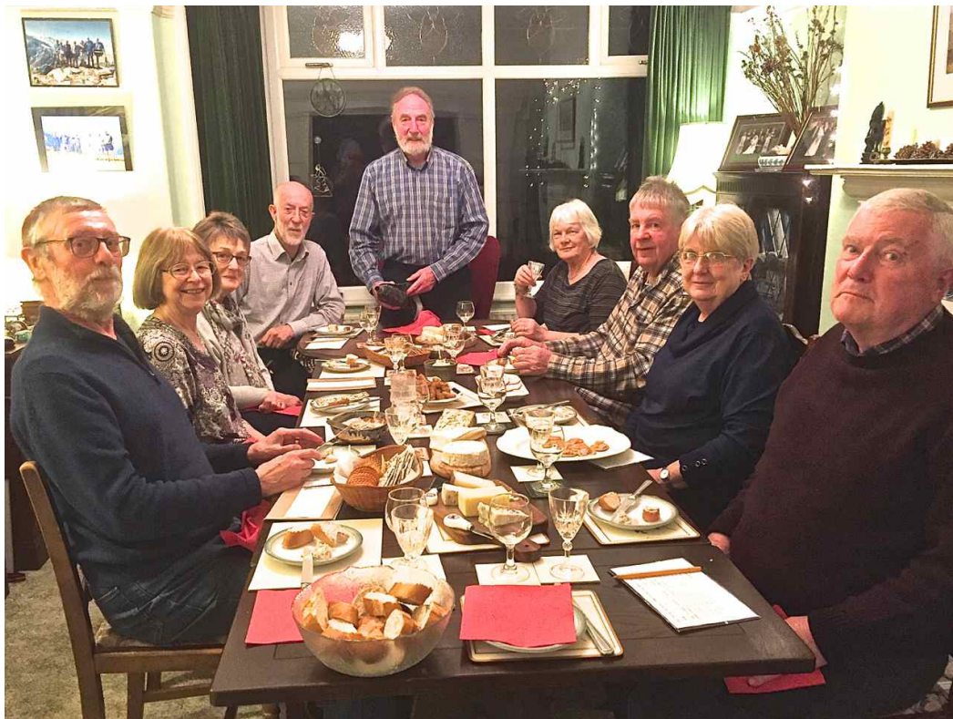
Sampling wines for our annual 'Round the World' wine quiz

The raison d'être for the group is to enjoy evenings of lively conversation in a convivial atmosphere when we can share and add to our knowledge and appreciation of various wines.