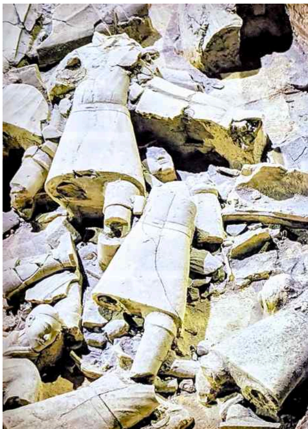
Discovery of the First Emperor's Terracotta Army

Members can go on their own journey, go on a suggested journey from the growing list we have compiled in our Folder of Suggestions, join us on organised journeys or journey with us with a chance to explore on arrival. Together we try to plan an outing each month, and your suggestions are really appreciated. The 'Explorers' part of our title refers to our coach trips, a recent one of which was a visit to Liverpool to see the Terracotta Warriors.