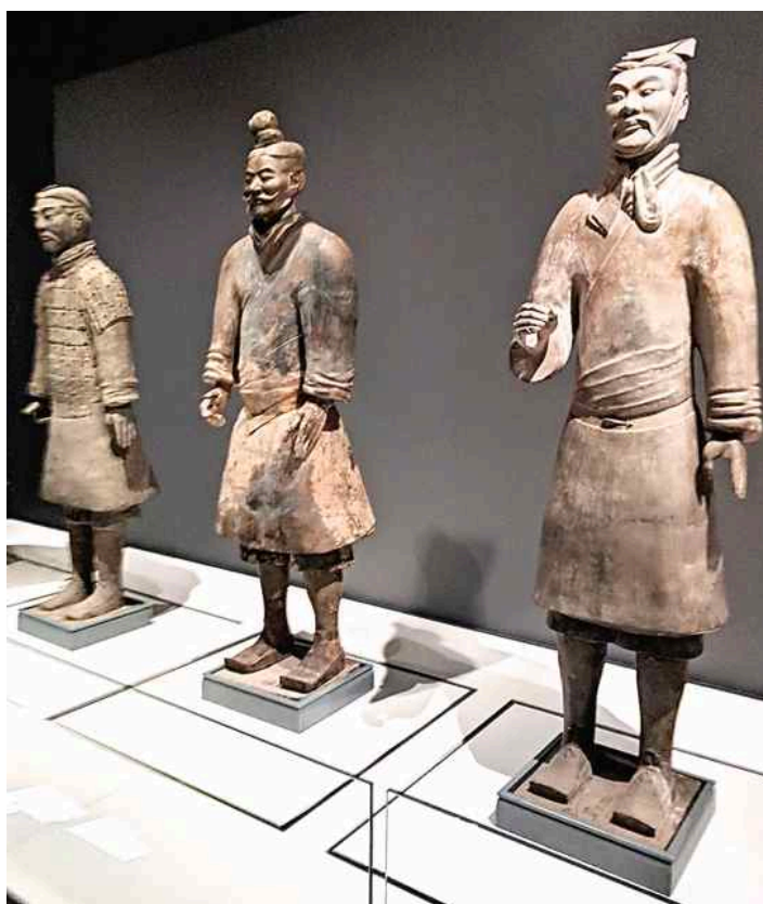
Three models of soldiers from the Terracotta Army

If you are interested put your name down on the list by the notice board at the U3A Monthly meeting, or at our meeting at Bill's.