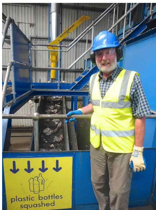
..... so keep your fingers well away!

Our programme will also consider the wider implications of marine pollution by micro-plastics and micro-fibres, and in the future extend to other environmental challenges such as causes of climate change and safety in the built-environment.