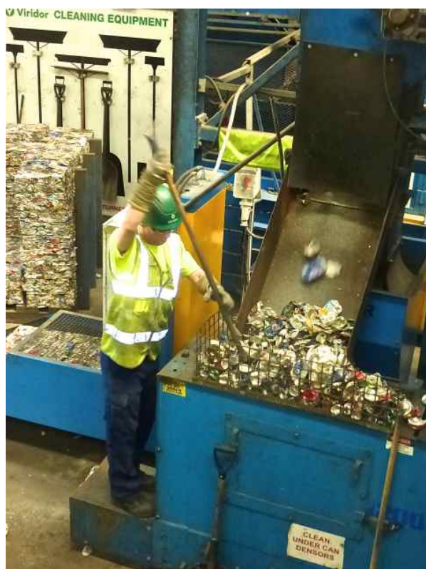
Aluminium cans being compressed into large 'bricks' for transport and re-processing

The contents of our black bins is sent for incineration to generate electrical energy in a plant with a high technology system which reduces the pollution in the smoke to virtually zero.