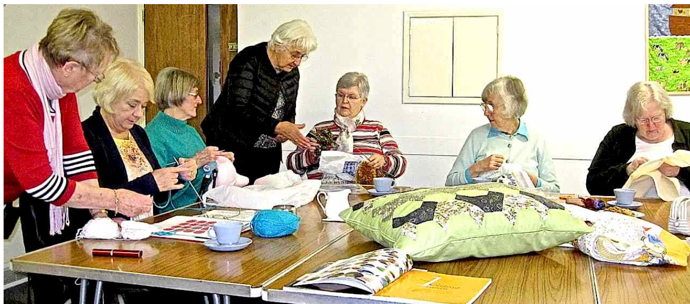
The Group busily working on their projects at the November meeting

This is a small but enthusiastic group of people who have interests in sewing, knitting, card making and general fabric and paper craft. It's a really friendly group of like-minded people. We bring along our own ongoing projects and share skills and experience with the rest of the group. It's very informal with no set programme of events but with lots of friendly chatter and exchange of ideas over refreshments.