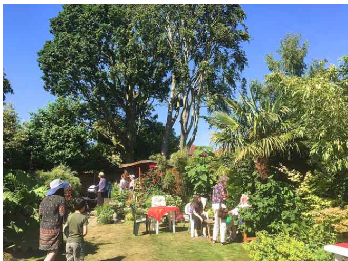
Refreshments in Batsheva's garden

Her work can be seen at The Williamson Art Gallery and Museum from 8 July to 9 September 2018 in the Textile 21 exhibition 'On the Edge of.....' www.textile21.co.uk