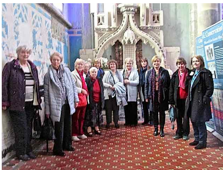
At Gorton Monastery

For an open meeting in May on 'Childhood recollections of visits to Blackpool' we were joined by members of the Creative Writing and Bus Pass Explorers groups. We had some excellent contributions from members in both prose and poetry, including the history of 19 th century tourists in Blackpool, weekly cost £1/18s/4d, but up to 9 men to a room in lodgings!