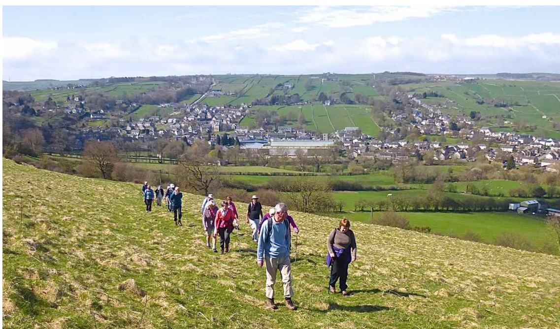
Heading up out of the village of Bradwell