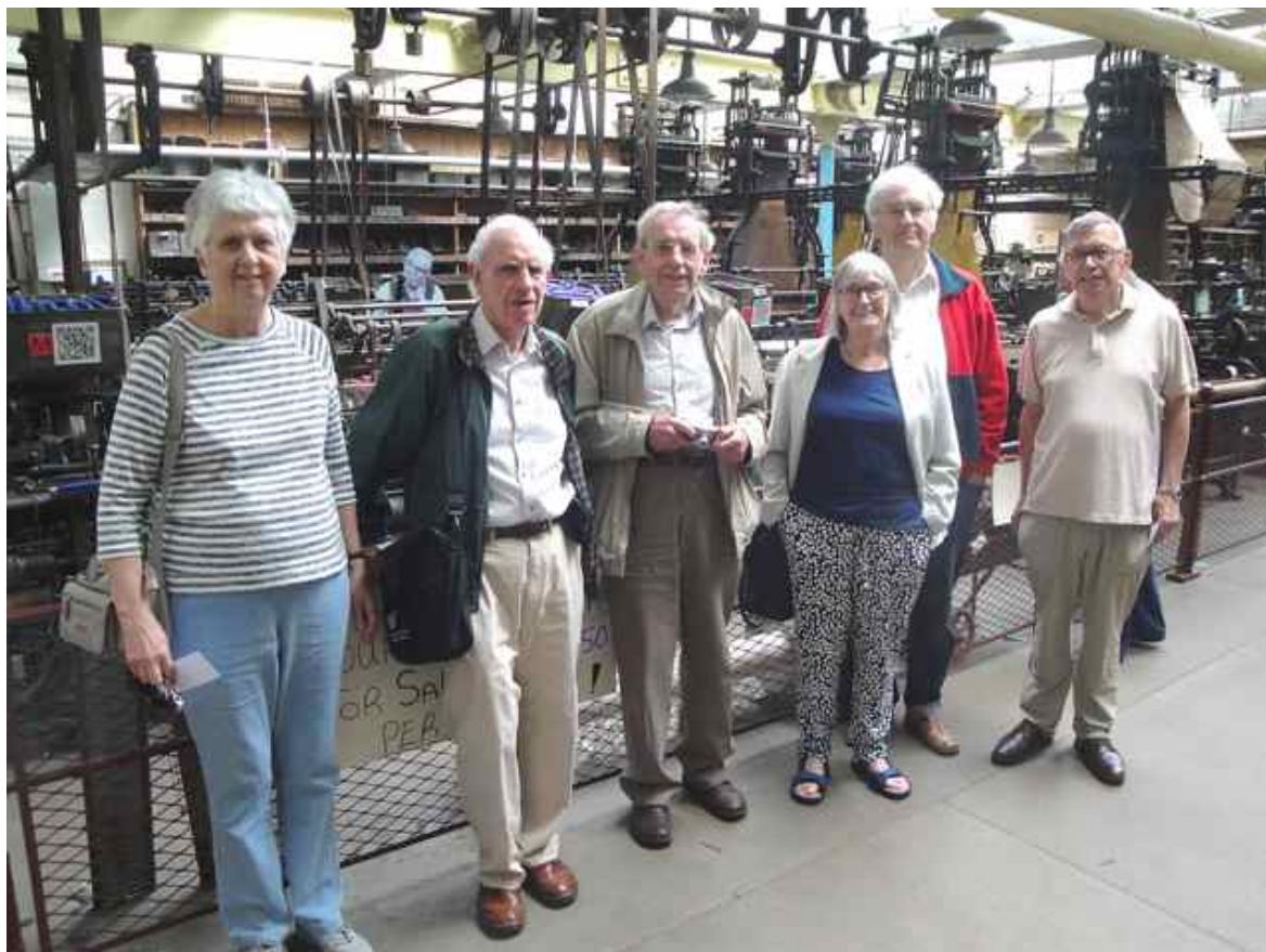
Masson Mill working demo for the Archaeology Group