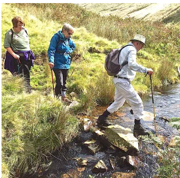
Crossing the Sett stream above Hayfield ...

Car sharing from Gatley Hill House is the normal arrangement. If you would like to join us for fresh air and exercise in marvellous countryside with convivial company, then register your email to receive monthly details of the forthcoming walks, and feel free to come on as many or as few as you wish.