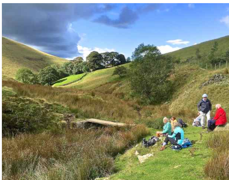
... with a fine lunch spot on the banks