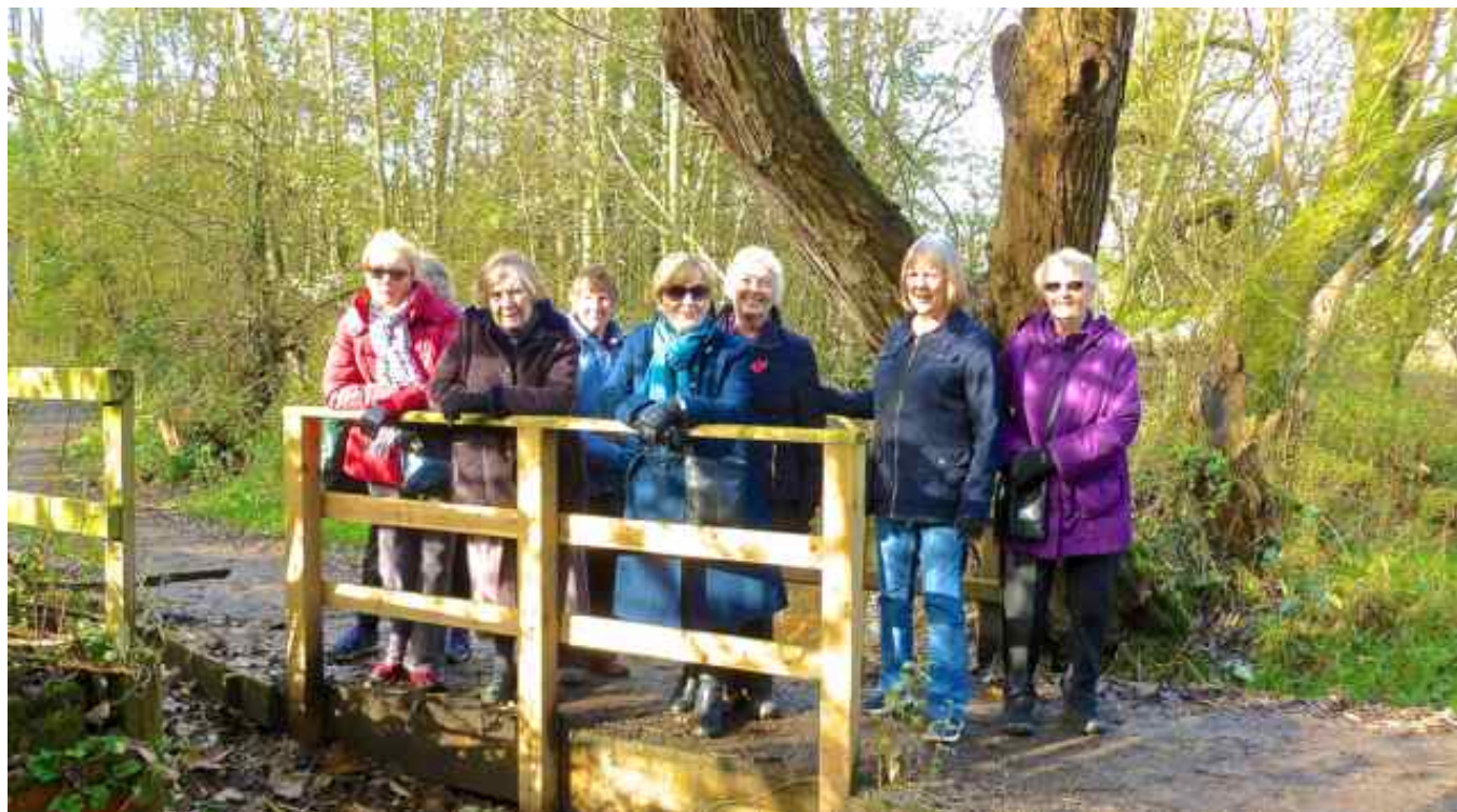
Strollers on an autumn day at Fletcher Moss

The Strollers walking group is suitable for people looking for a walk of no more than an hour. Often we walk in nearby parks such as Bramhall, Bruntwood, Fletcher Moss or Wythenshawe. When it is practical we use public transport and we always finish with a cup of coffee and a chat. New members are welcome.