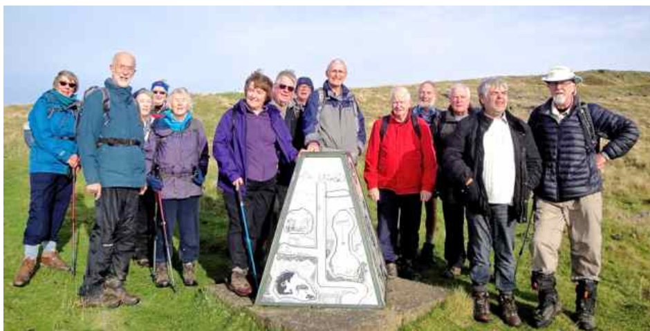
On Bakestonedale Moor at a capping stone for an old mine shaft which depicts local industries