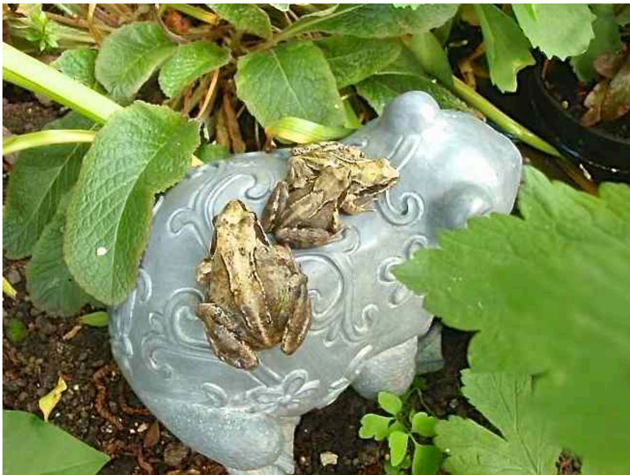
Life and death on Marrick Avenue