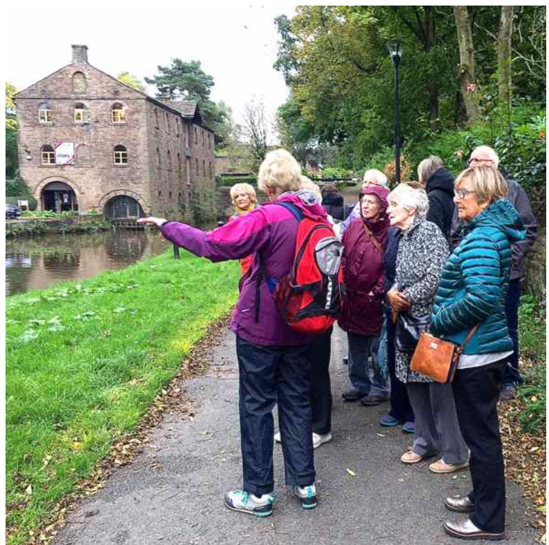
Learning about the history of the Peak Forest and Macclesfield canals