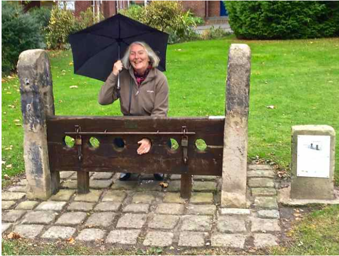
I must get one of these for my garden! - Editor