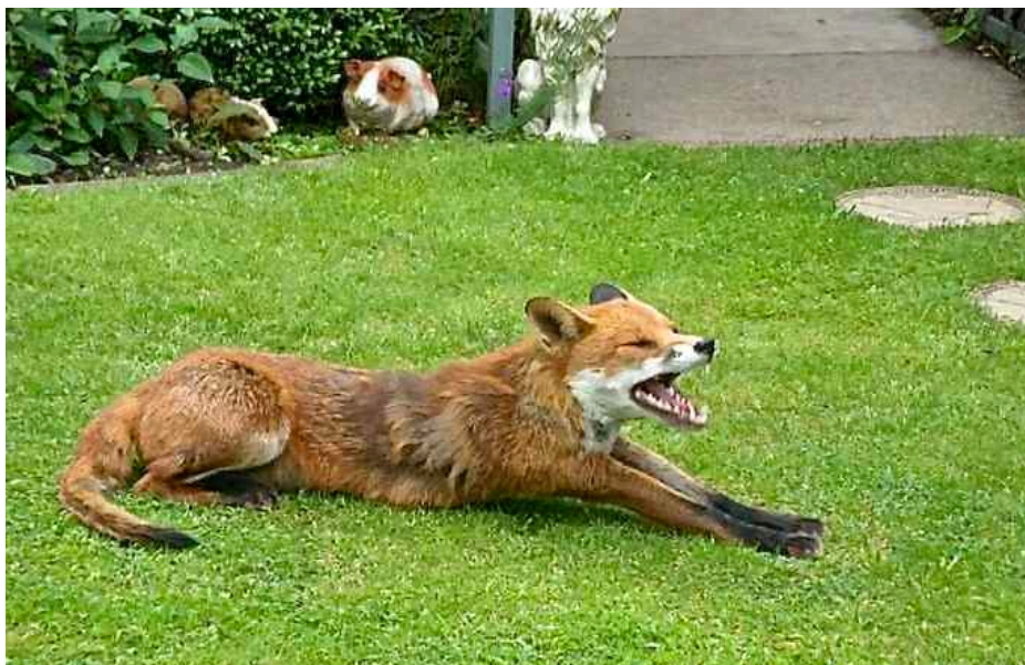
Guinea pigs beware!