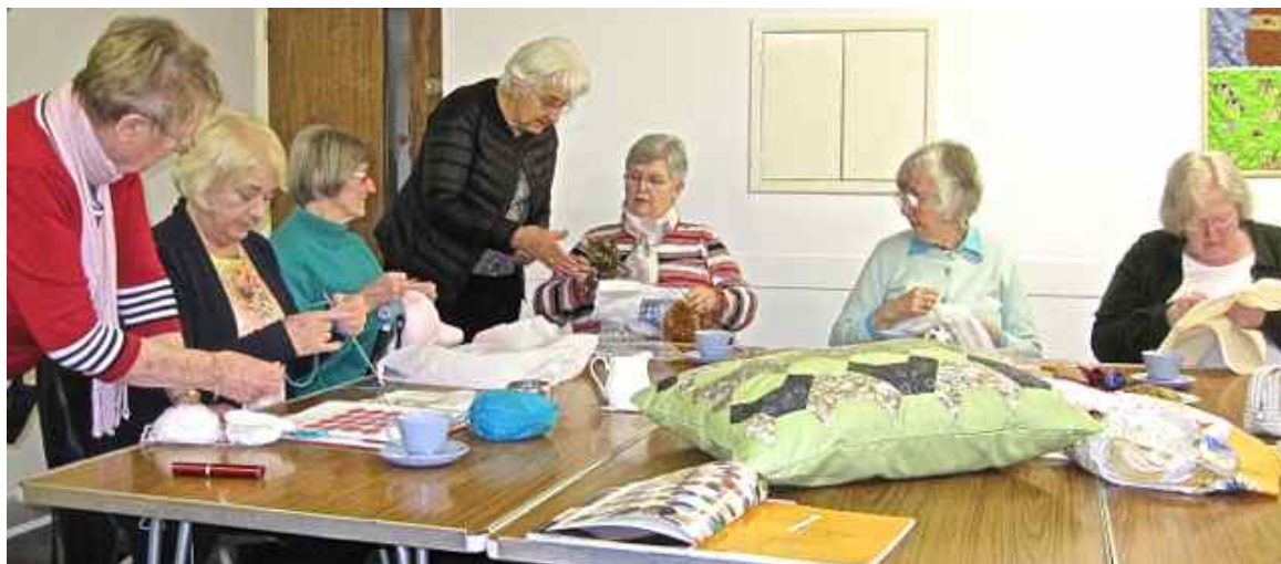
The Group busily working on their projects at the November meeting

This is a small but enthusiastic group of people who have interests in sewing, knitting, card making and general fabric and paper craft. It's a really friendly group of like-minded people. We bring along our own ongoing projects and share skills and experience with the rest of the group. It's very informal with no set programme of events but with lots of friendly chatter and exchange of ideas over refreshments.