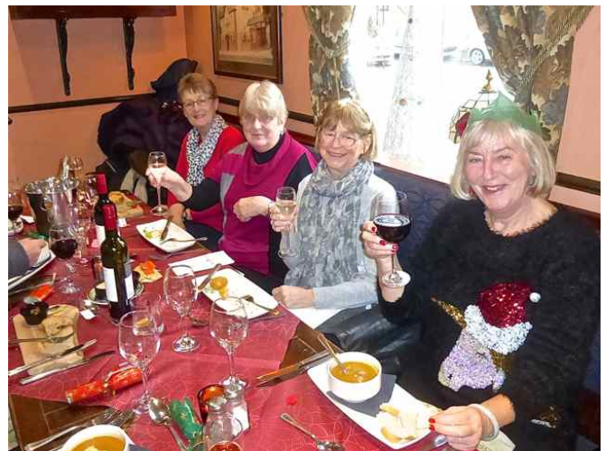
... followed by a festive lunch at the Red Lion Cheadle