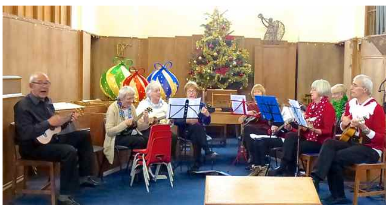
The Ukulele Group