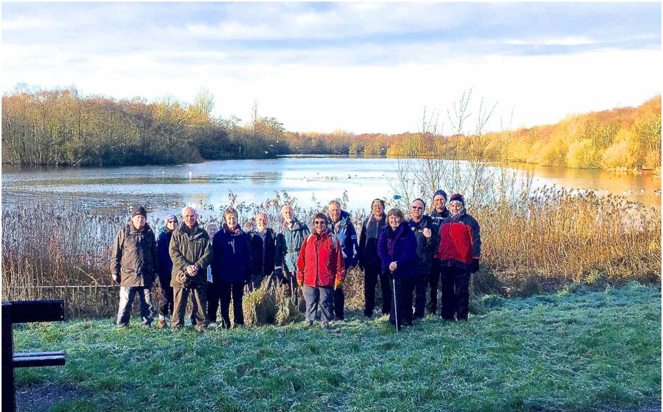
At Chorlton Water Park on our shorter December walk ...