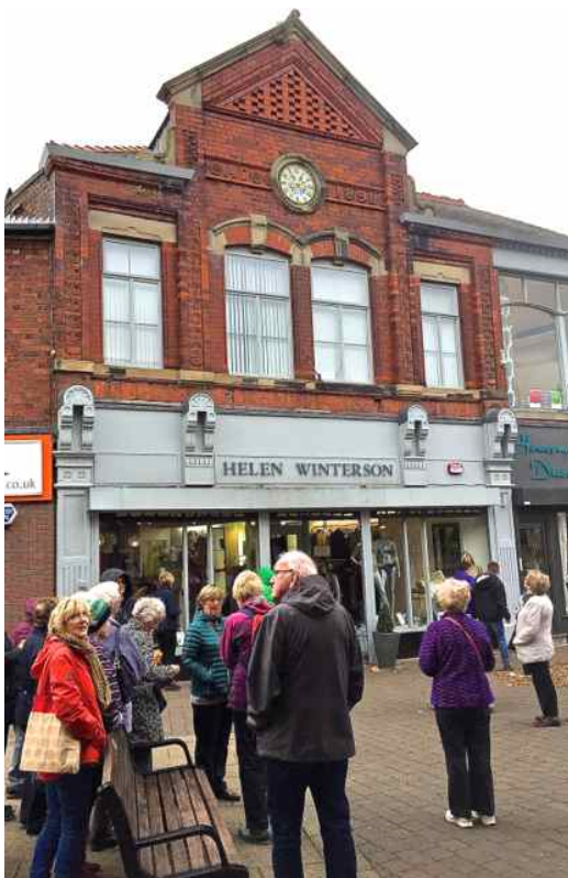
The building built for the Coop in 1891 and in continuous use as a shop ever since