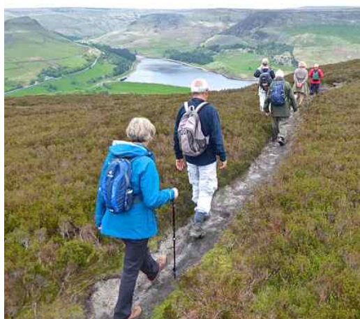
High above Dove Stone reservoir in May