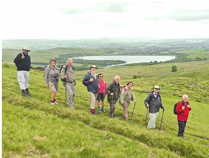
On the moors above Watergrove Reservoir in June

Car sharing from Gatley Hill House is the normal arrangement. If you would like to join us for fresh air and exercise in marvellous countryside with convivial company, then register your email to receive monthly details of the forthcoming walks, and feel free to come on as many or as few as you wish.