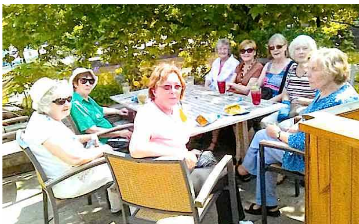
Strollers on their walk along the Rochdale Canal in central Manchester