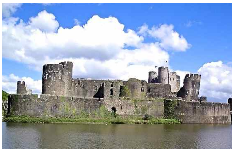
Caerphilly's 13 th century castle

Also in April, South Manchester Archaeology Research Trust began a preliminary excavation on Gatley Hill. At the end of June we participated in the Greater Manchester Archaeology Festival and joined SMART for an Open Day in Cheadle.