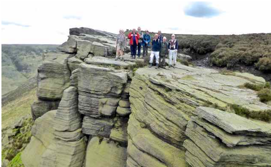
On Winberry Rocks in May

Car sharing from Gatley Hill House is the normal arrangement. If you would like to join us for fresh air and exercise in marvellous countryside with convivial company, then register your email to receive monthly details of the forthcoming walks, and feel free to come on as many or as few as you wish.