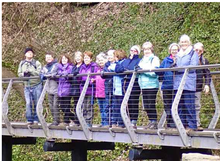
On the walk from New Mills

Anybody who would like to join should contact me.