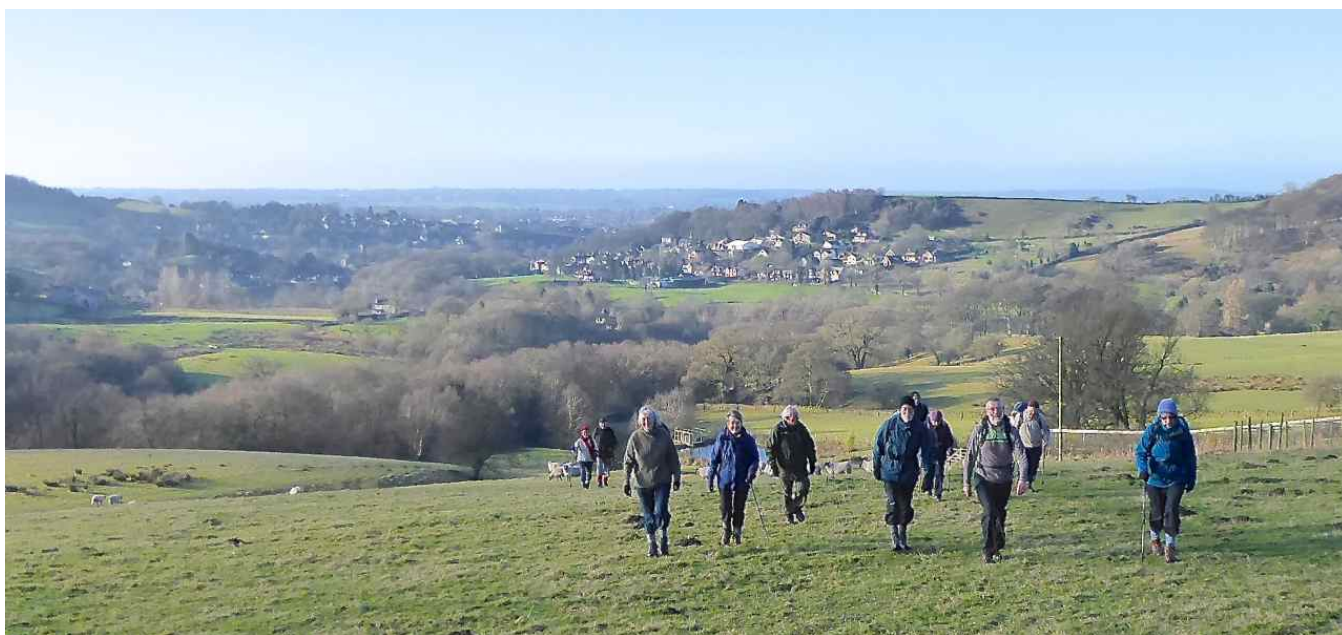
Walking up from Bollington on a crisp January day