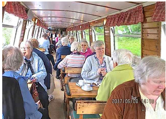
Afternoon tea on the narrow-boat