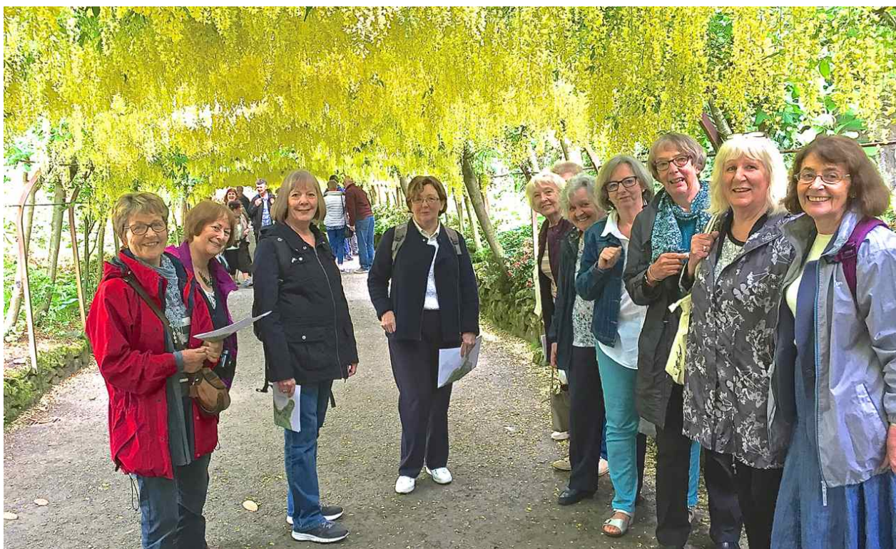
Underneath the Laburnum Arch at Bodnant Gardens