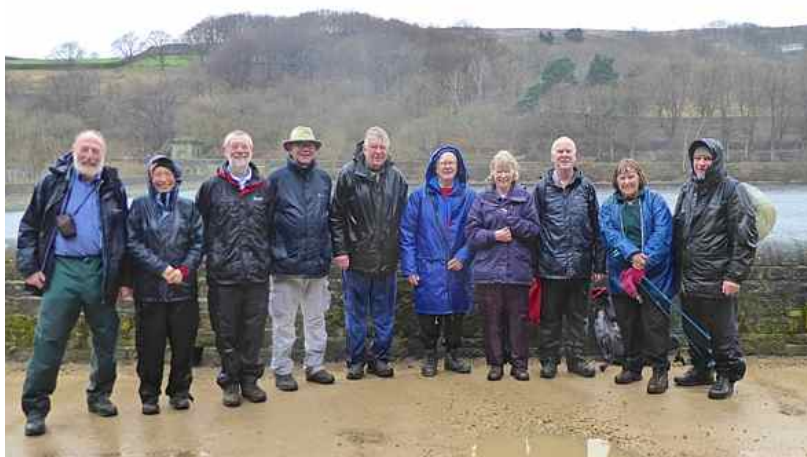
A wet walk in Longdendale in March