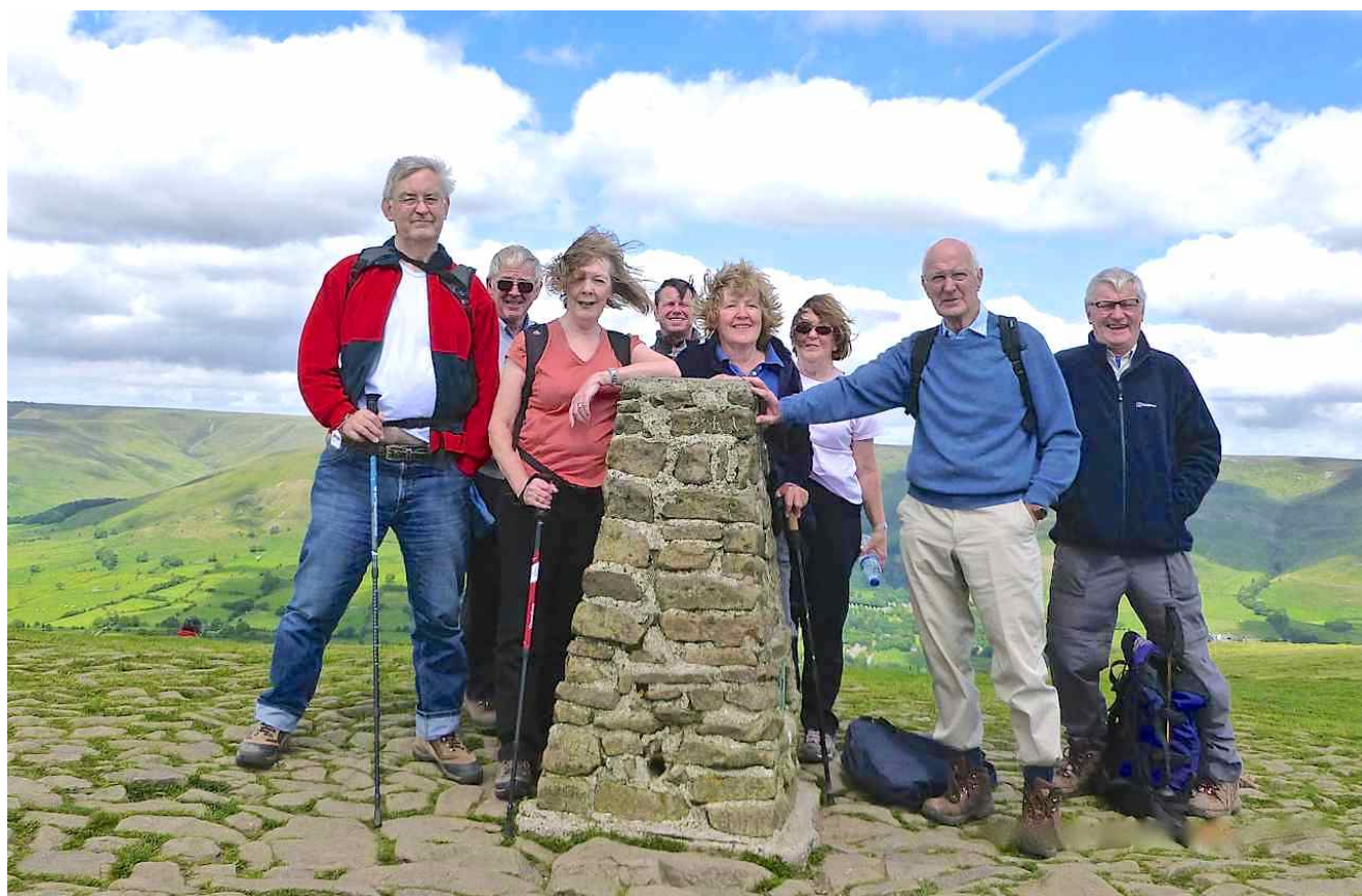
The Short Walks Group on the summit of Mam Tor on a bright and breezy day