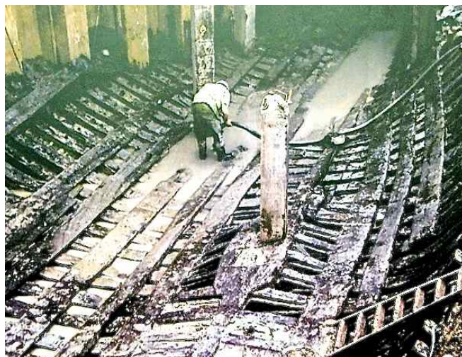
The excavation of Newport ship