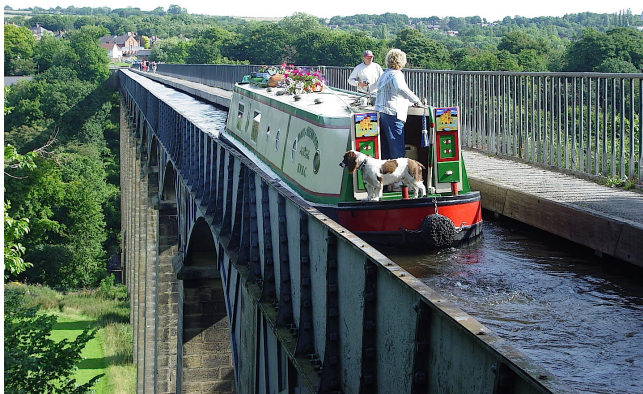
Pontcysyllte Aqueduct on a sunny day