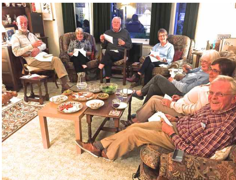
The Wine Appreciation Group studying hard during the 'Round the World' Wine Quiz

We have an annual quiz, a barbecue evening and a seasonal banquet in December and weather permitting some outdoor garden evenings, including 'Wine under the Vine'.