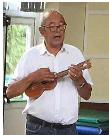
This is how to do it

We are at present trying to master new rhythms (as opposed to "umpty tumpy tumpy tum"); hard work but we'll get there.