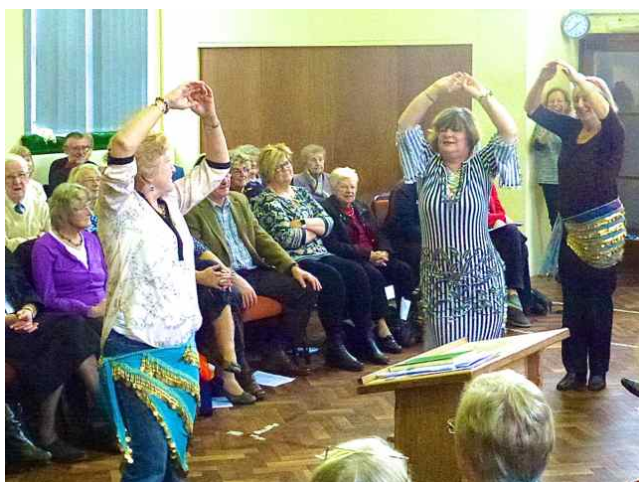
Entertainment: first by the belly dancers ...