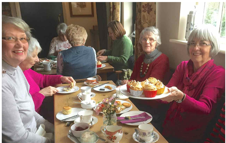
Tea and home made cakes at The Crown