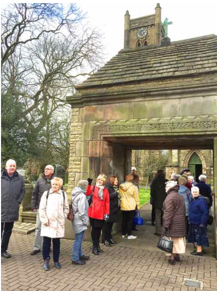
The entrance arch of St John's