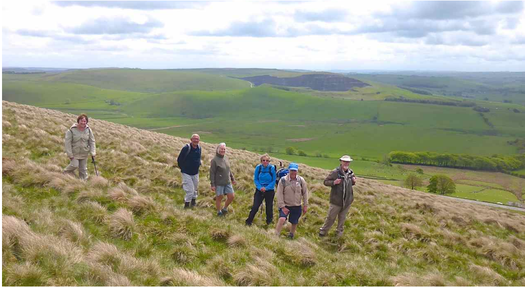
Coming off Rushup Edge with Eldon Hill quarry in the distance