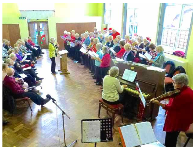
... then by the choir singing 'Fiddler on the Roof' ...