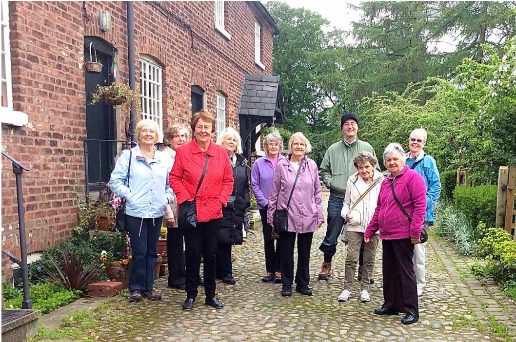
The Strollers in Styal Village ...

The Strollers meet twice a month for a walk of about one hour followed by a drink of at least an hour. We often walk in parks not far away such as Bramhall Park, Wythenshawe Park, Abney Hall Park and Vernon Park. It's a very friendly, welcoming group, and there are usually about 10 people taking part.