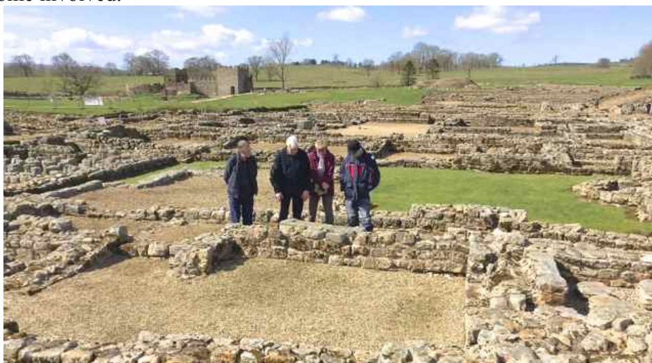
Inspecting the Roman remains