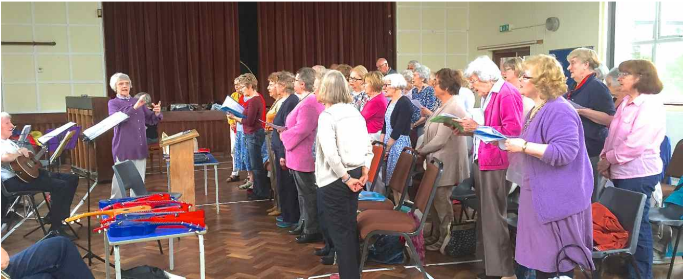
Singing for our Ukulele Band visitors