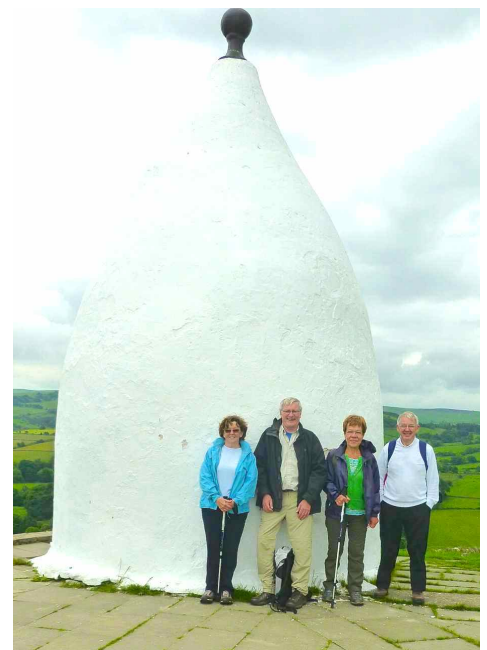
At White Nancy