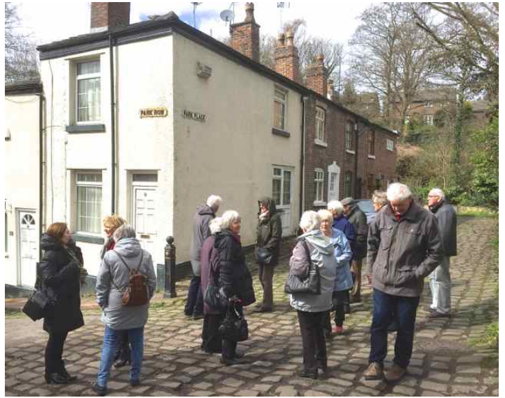
Looking round the street architecture of Heaton Mersey