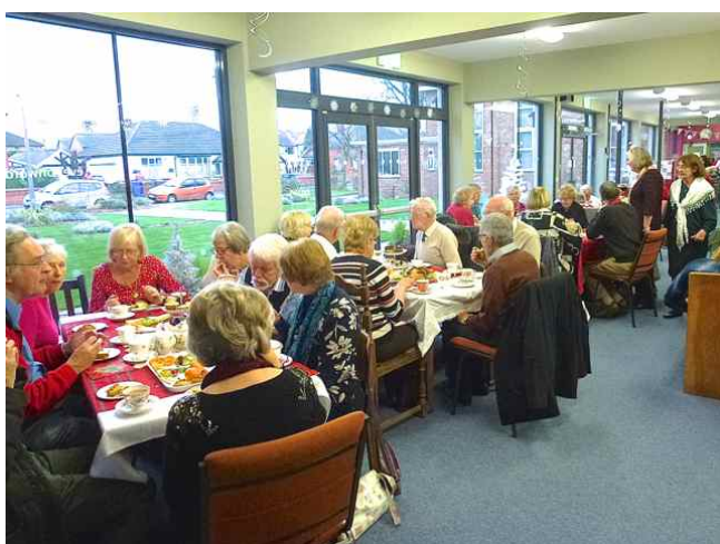
...followed by a marvellous spread enjoyed by all.