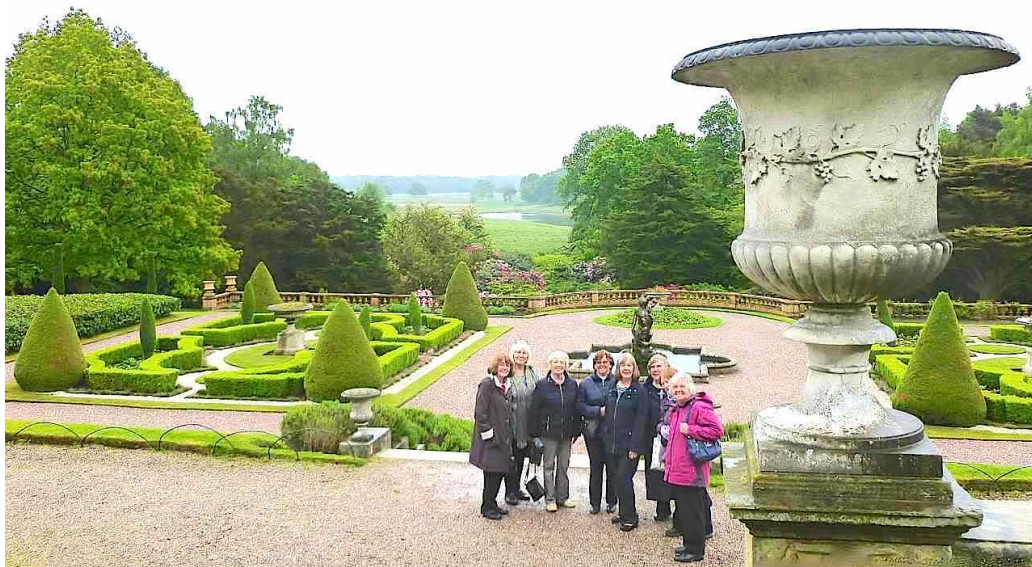
The Gardening Group at Tatton