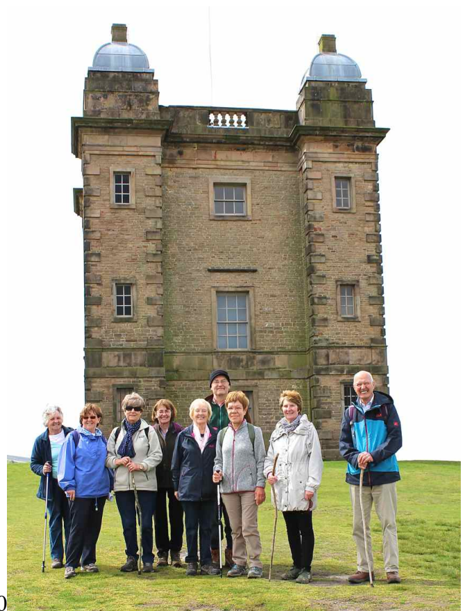
By the cage in Lyme Park