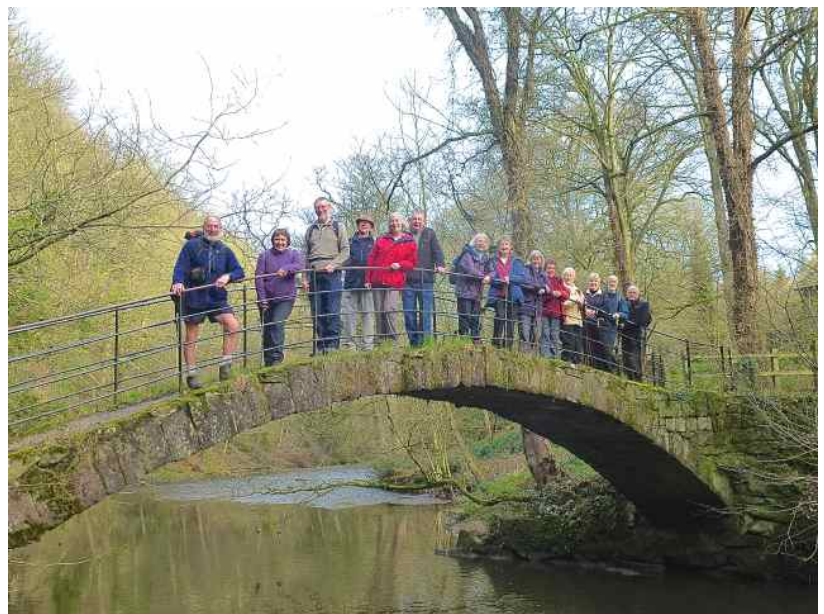
Our December walk along the Goyt Valley