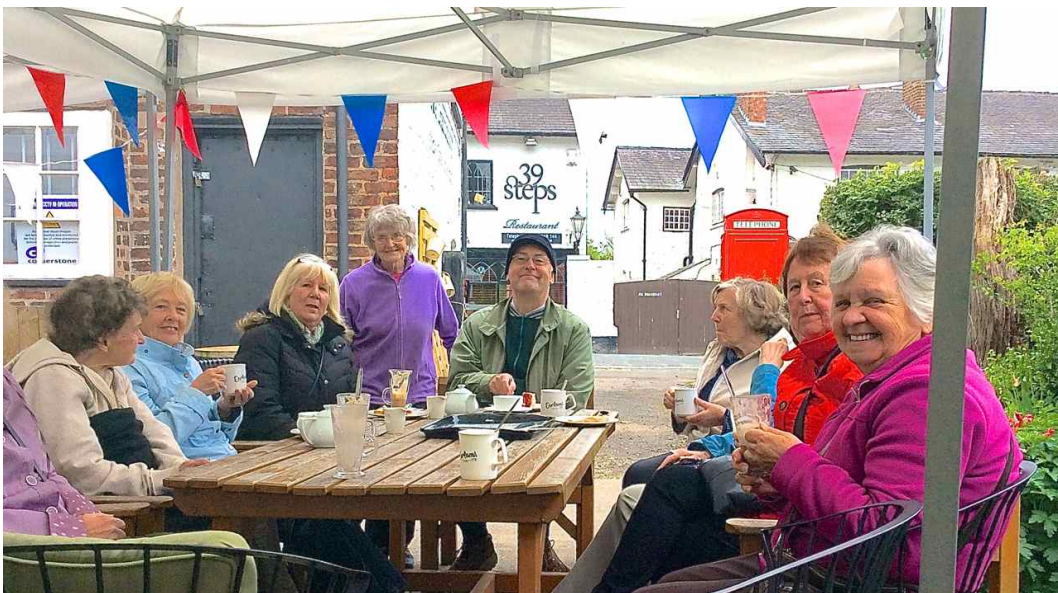
... and at the tea shop