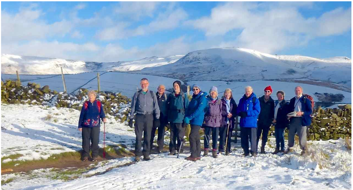
On the shoulder of Mount Famine in January, with Kinder Downfall and Kinder Low End on the skyline