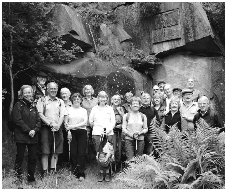
The group at Bowden Bridge Quarry, with the plaque commemorating the original trespass on the rock above

From there the Short Walkers returned via White Brow and Hayfield, while the Long Walkers went up to Sandy Heys and Kinder Downfall. Fortunately, neither group met any gamekeepers with sticks, there was no brawl, and nobody was arrested when we returned!