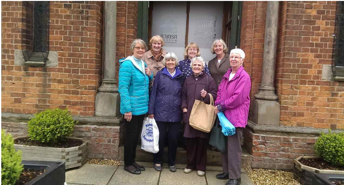
Some of the Lunchtime Concert goes visiting the Jewish Museum

As ever the Royal Northern College of Music and the University Music Department have presented us with not only a great variety of music in style and period, but also with many different combinations of instruments and voices. The concert with twelve harps at the RNCM was certainly a memorable musical and visual experience. In April we visited Manchester University for a performance of Klezmer Music. A visit beforehand to the Jewish Museum enhanced our appreciation and understanding of this special music.