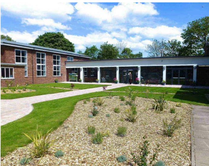
The new gardens and entrance to the URC halls