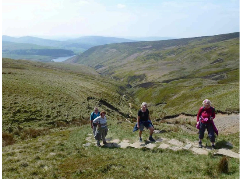
... and emerging at the top