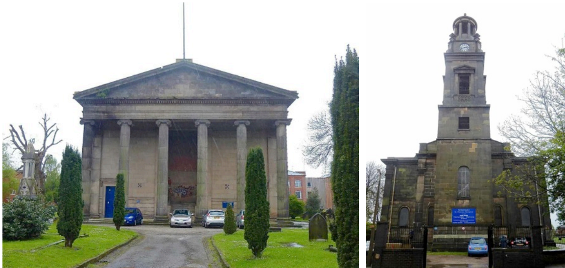
The exterior of St Thomas' church