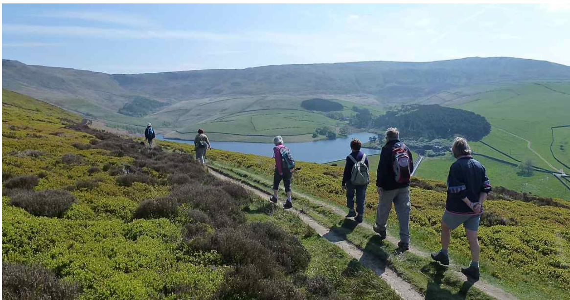
High above Kinder Reservoir en route to Mill Hill

It was a beautiful day for our walk up Mill hill to find the remains of the WW2 plane.