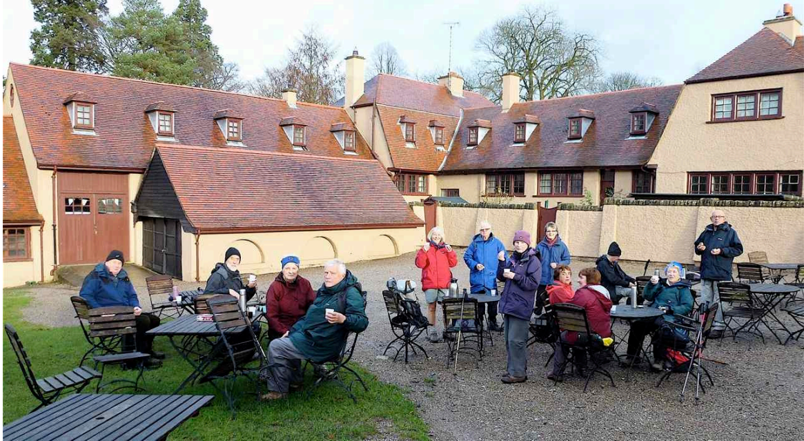
... with mulled wine and mince pies for elevenses