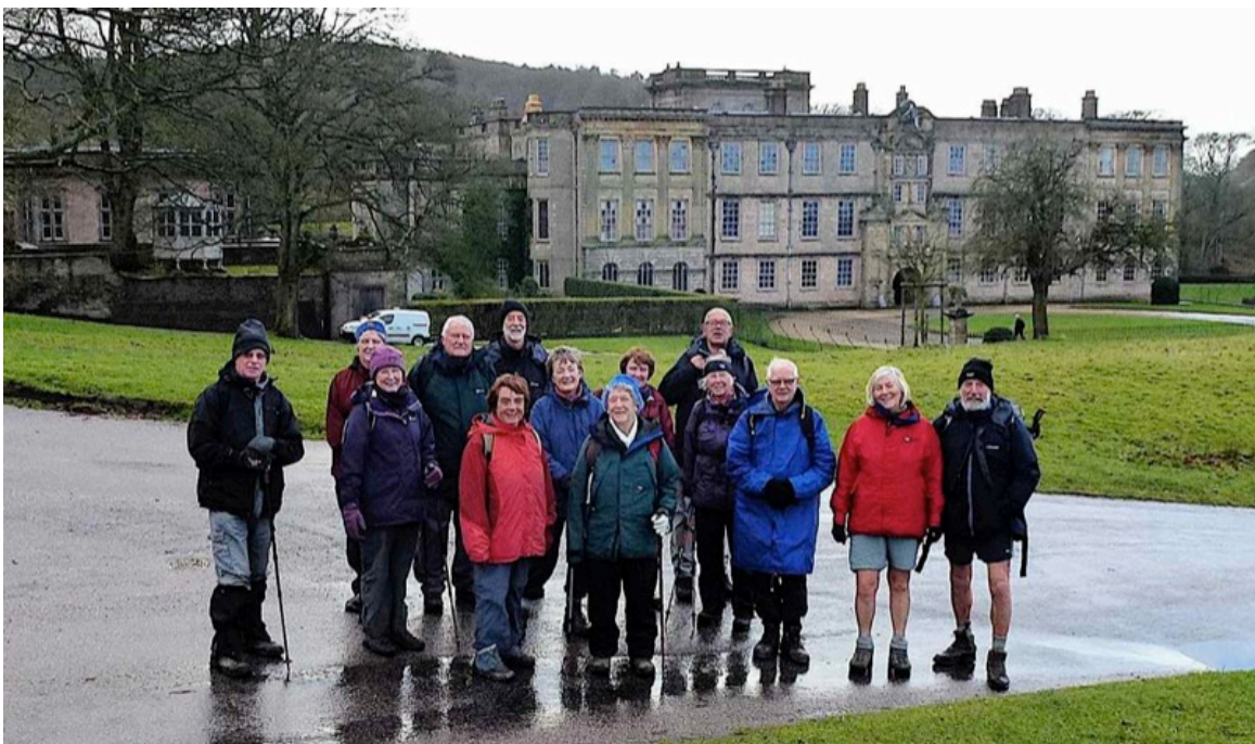
On the December walk through Lyme Park ...