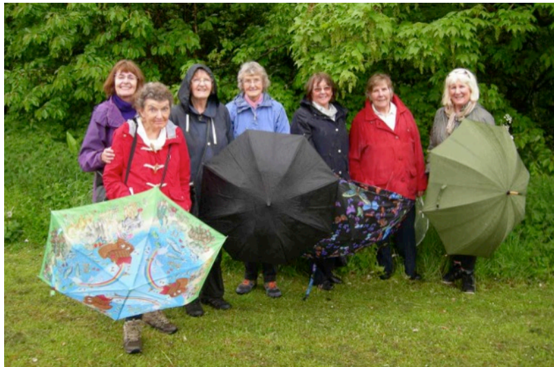
A rainy morning in May on Gatley Hill has not deterred the Strollers.

The Strollers meet every 1st and 3rd Monday morning at 10.30 at Elm Road URC for a walk of about one hour followed by a drink of at least an hour. We often walk in parks not far away such as Bramhall Park, Wythenshawe Park, Abney Hall Park and Vernon Park. It's a very friendly, welcoming group, and there are usually about 10 people taking part - all women.