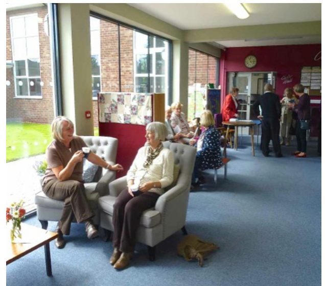
Relaxing inside the new foyer