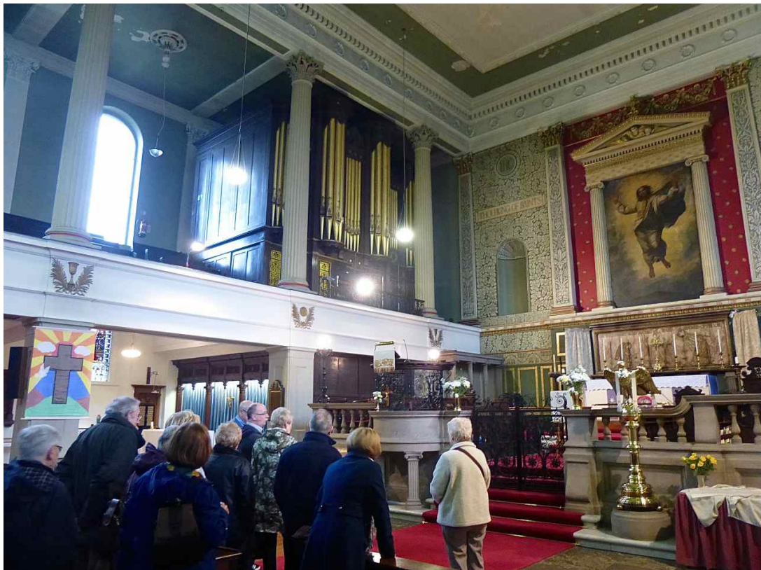
The Local History group visits the wonderful St. Thomas' church in Stockport