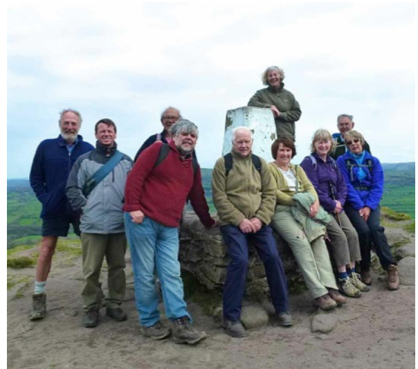
The whole party on the summit of The Cloud

It was a beautiful day for our walk up Mill hill to find the remains of the WW2 plane.