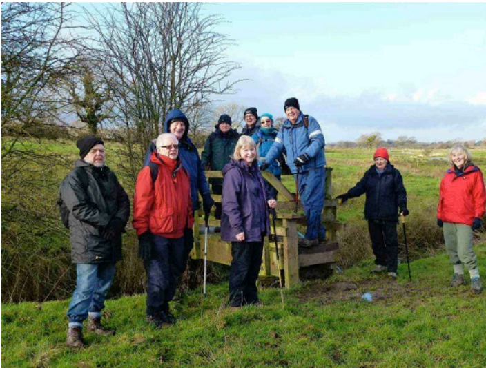
Crossing the fields near Dunham Woodhouses