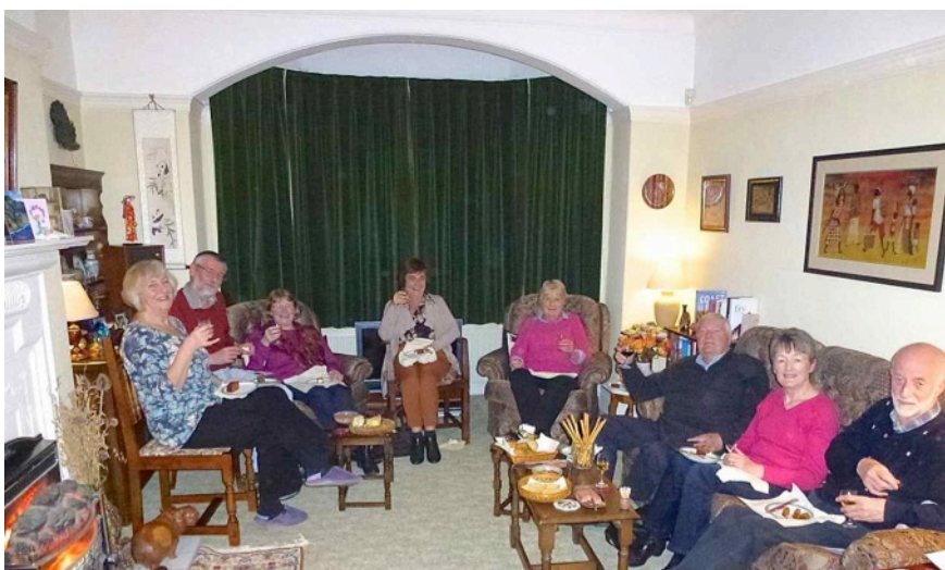
The group sampling wines for the 'What's that wine?' quiz