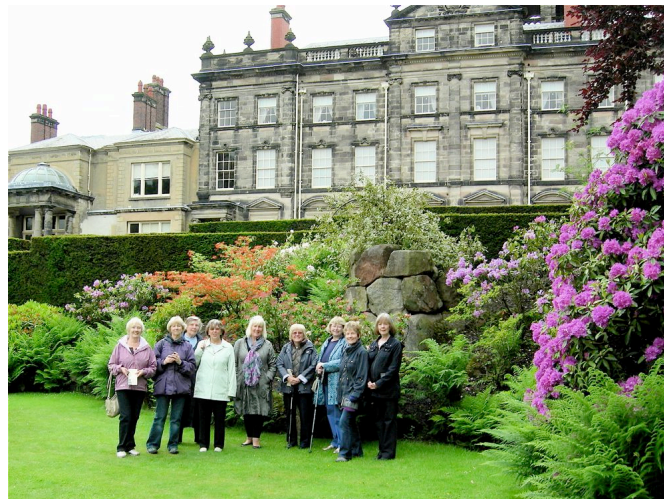
Members of the Gardening Group on their visit to Biddulph Grange

We continue to maintain the Patsy Calton Memorial Garden at Cheadle Library. The 2 smaller pots are planted with rockery plants and look very sweet. The 2 larger pots will soon have summer flowering plants. Do take a look next time you are there.