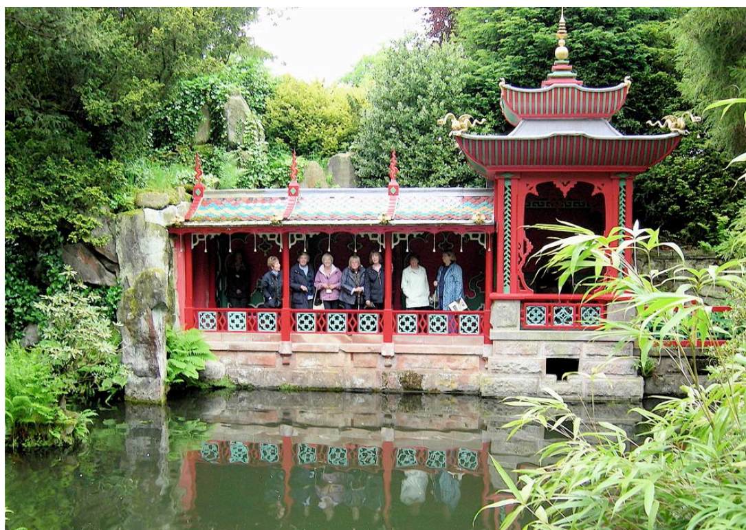
Members of the Gardening Group on their visit to Biddulph Grange