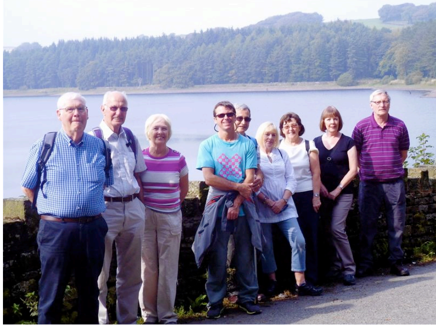
The group at Entwistle

Next year's list will take us further afield as we have an earlier start time of 11 a.m. and will take packed lunches. Any U3A members who would like to join us meet outside the URC on the Thursday of the week after the monthly U3A meeting.