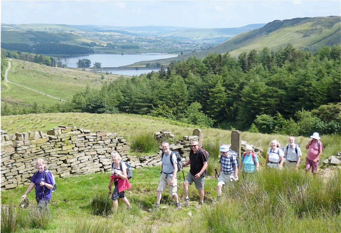
In the Grane valley ...