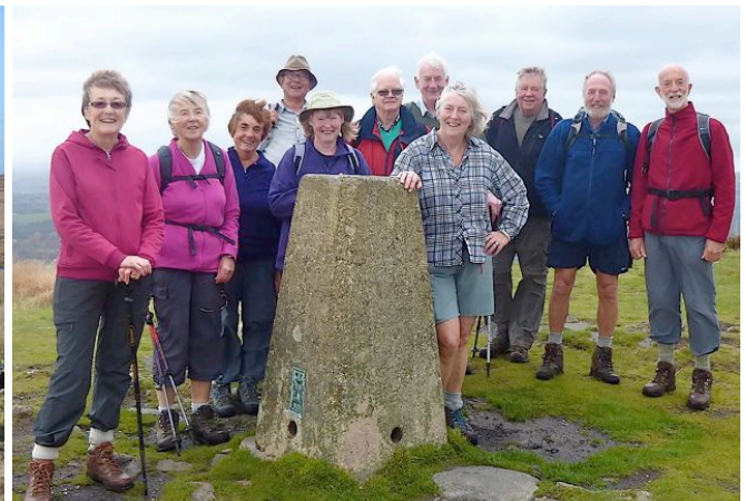
... and on the summit

Car sharing from Gatley Hill House is the normal arrangement. If you would like to join us occasionally then register your email to receive monthly details of the forthcoming walks, and feel free to come on as many or as few as you wish.