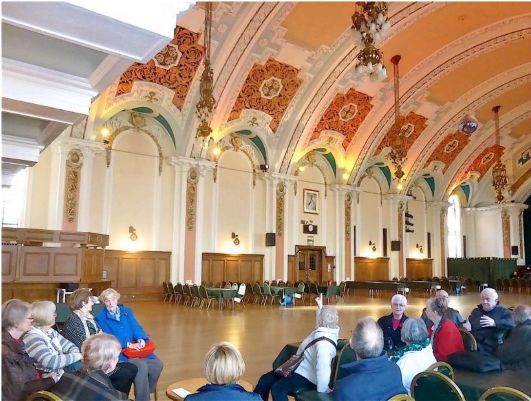
The Ballroom of the Town Hall ...