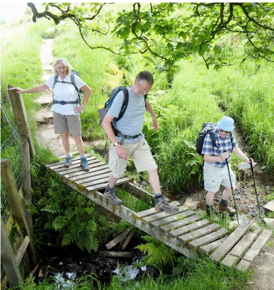
... mind the gap!