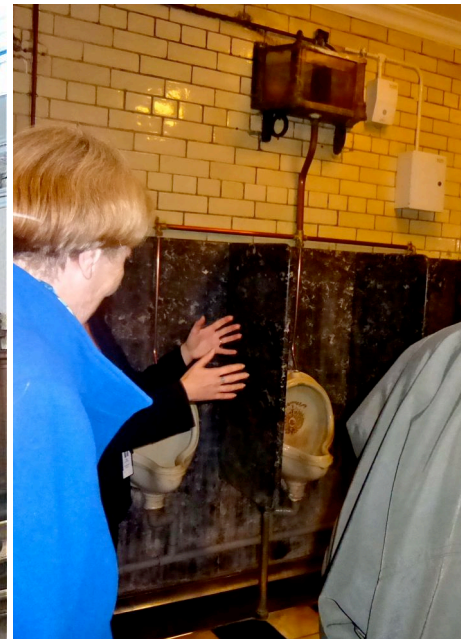
Inspecting the listed Gents' urinals!

We also contributed to the First World War Commemoration Day in November providing details of local involvement in the war.