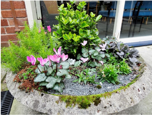
One of the pots we maintain at Cheadle library