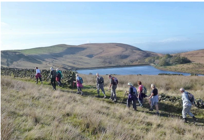
Heading up towards Hollingworthall Moor ...