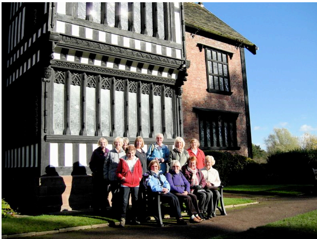
The Strollers at Bramhall Hall