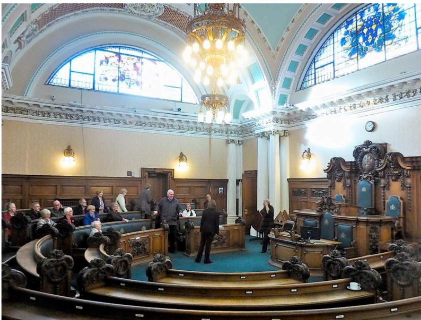
The Council Chamber