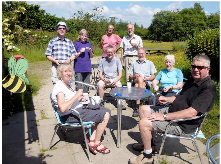
Ice creams back at the car park