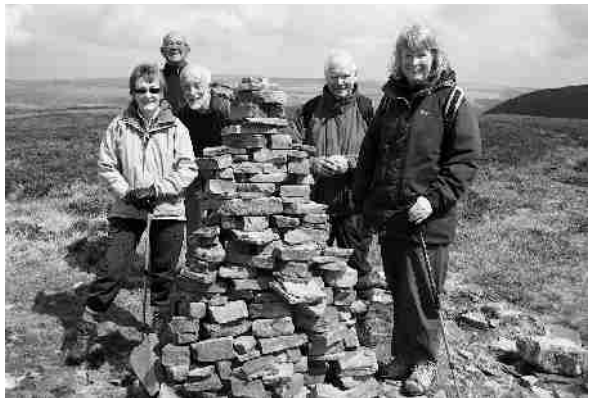
Over Bleaklow from Old Glossop in May