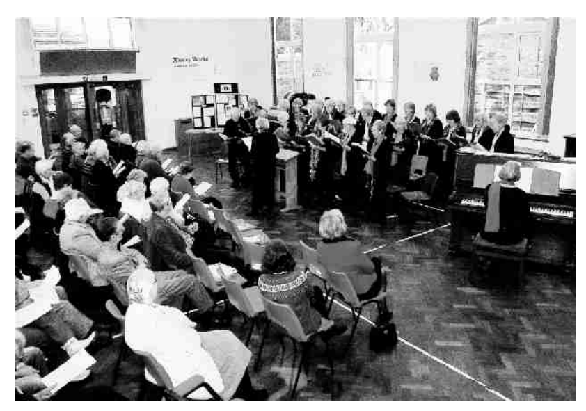
The choir entertains at the December Monthly Meeting

The choir with a regular attendance of 30-34 members continues to make progress, especially on producing a really good sound and in part-singing too.