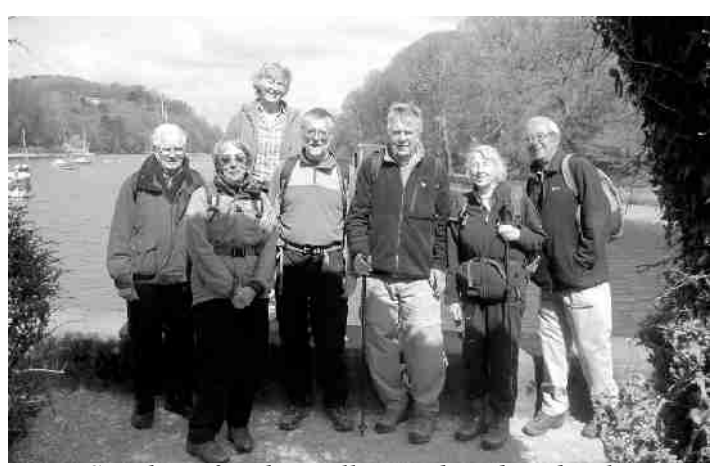
Sunshine for the walk round Rudyard Lake