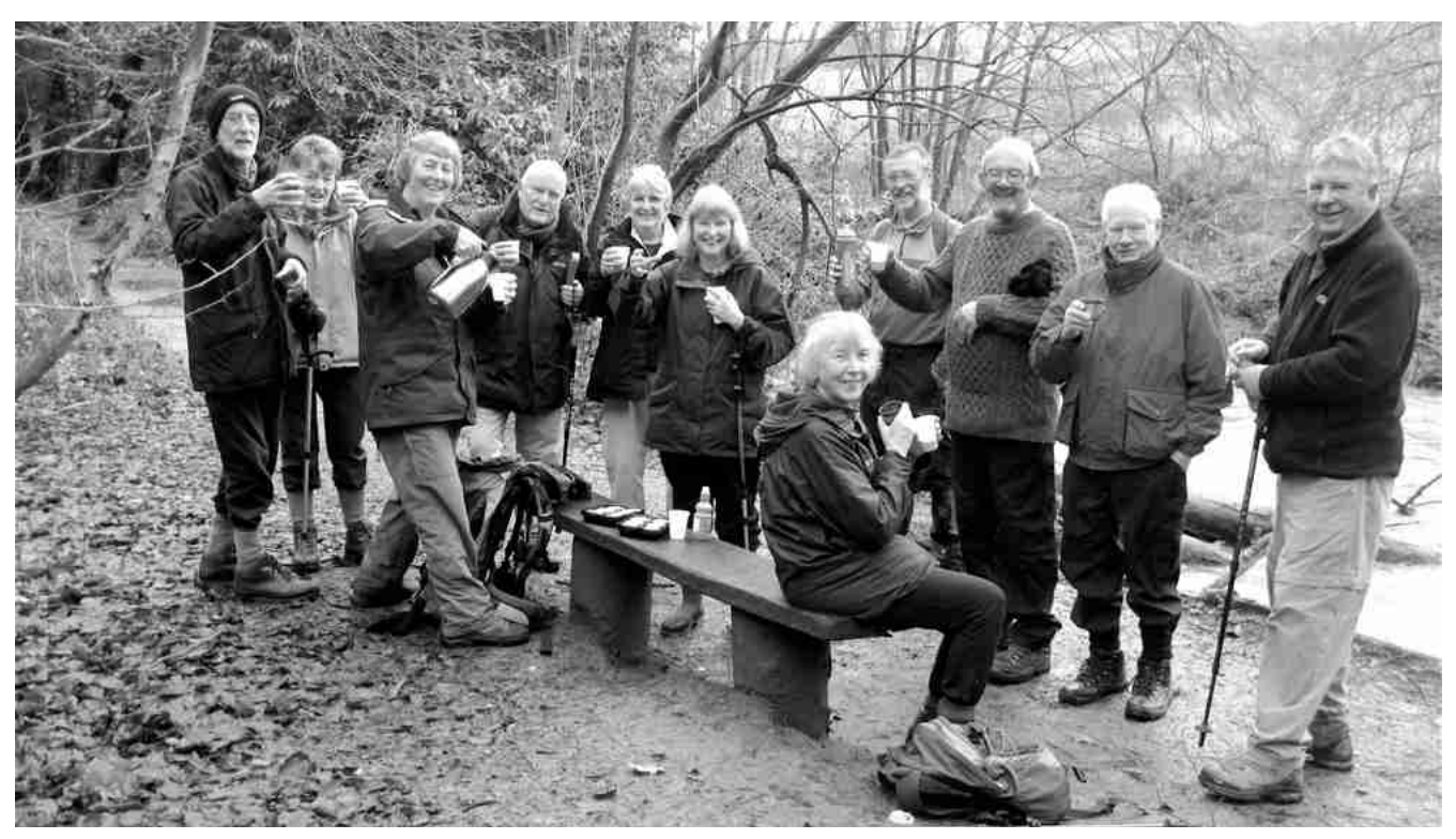
Members of the Long Walking Group enjoy mulled wine and mince pies for elevenses on the December walk along the Bollin Valley!

December 11th Christmas Meeting U3A Singers and Creative Writers