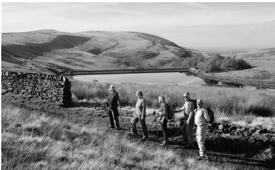
Heading up towards Hollingworthall Moor in October