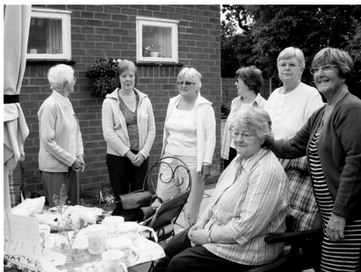
A visit to a member's garden