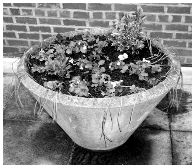
Replanted Memorial tub