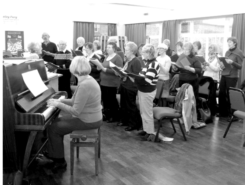
Singing practice at the URC

The singing group flourishes with a very good attendance for the fortnightly meetings. Early in October we took part in an AGE UK day at Stockport Town Hall with a half hour programme of songs. For the occasion we decide to appear in a Concert Uniform. It certainly made us look and feel more professional, dressed in all black with scarves for the ladies giving a splash of colour.