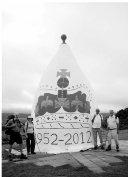
White Nancy in August

The last six months has seen the number of people on the Longer Walks emailing list increase to 18, fourteen of whom have been on at least one walk, with about half a dozen of those being regulars. We still don't have quite enough regulars to ensure a quorum for each month's walk, but we are getting there, and there were 9 on the November walk round Anglezarke Reservoir.