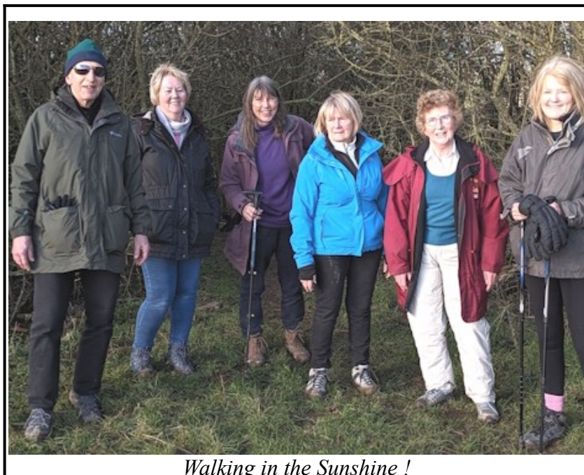
Walking in the Sunshine !